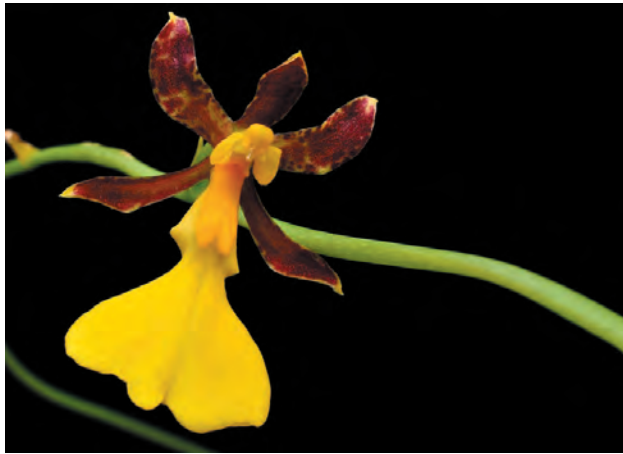
Figure 8. Nitidocidium gracile (Lindl.) F.Barros & V.T. Rodrigues.

It is similar and closely related to Alatiglossum , from which it differs by lacking fimbriate isthmus margins and having inconspicuous tabula infrastigmatica. Combining it with Alatiglossum would eventually cause problems with the definition of such a genus. Neoruschia is a monotypic genus restricted to SE Brazil: