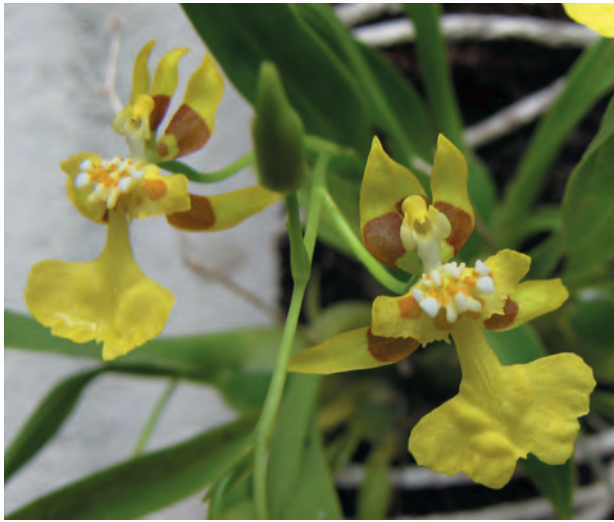
Figure 9. Neoruschia cogniauxiana (Schltr.) Cath. & V.P. Castro.

as synonyms of Alatiglossum . In another article, BARROS & RODRIGUES (2010b) created a new genus Nitidocidium to accommodate Oncidium gracile Lindl., previously treated as a member of Carenidium by Baptista (in DOCHA NETO et al. 2006), emphasizing the molecular results – placing O. gracile at the base of the Alatiglossum clade – and the absence of common morphological features between both entities.