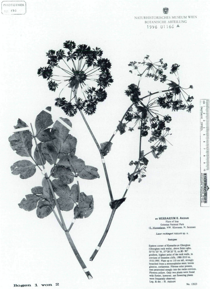
Fig. 2.: Laser rechingeri , isotype (Akhani 12023) in [W].