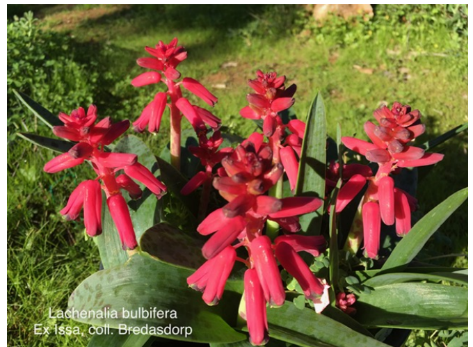
Lachenalia bulbifera Ex-155a, coll. Bredasdorp

As mentioned above, details of the date and speaker for the Spring 2022 meeting will be circulated when they are decided.