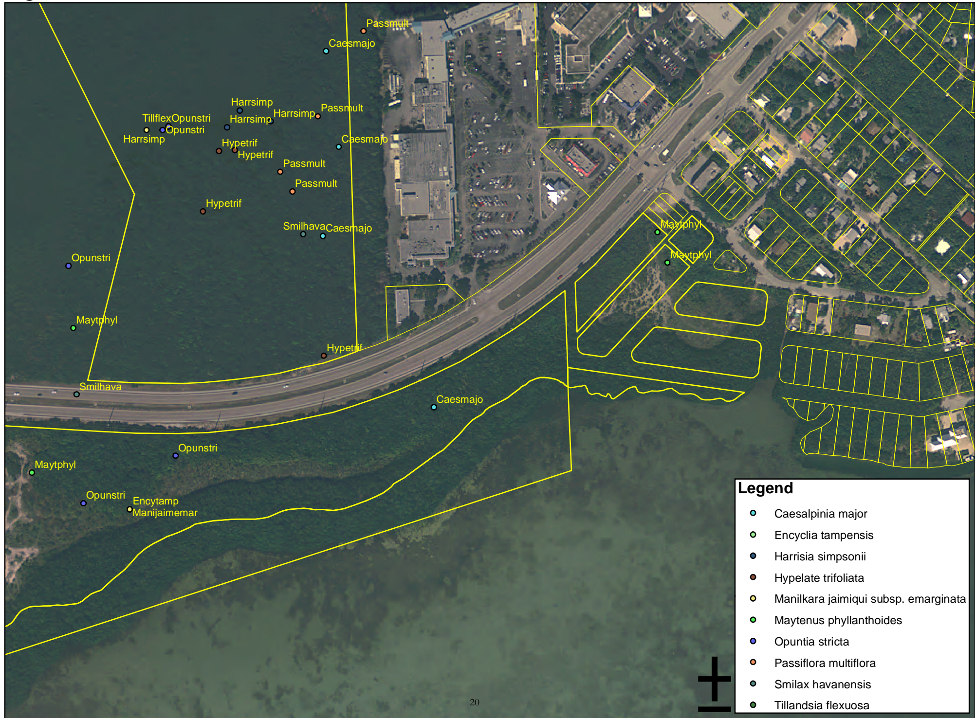
Figure 1: Tavernier Creek Hammock, Rare Plant Occurrences