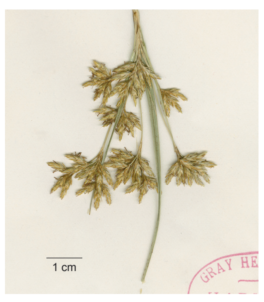
Fig. 1. Inflorescence of Cypringlea analecta (Beetle) M. T. Strong [ Purpus 5454 (GH, isotype)].

Cypringlea analecta (Beetle) M. T. Strong, Novon 13: 125. 2003. Scirpus analecta Beetle, Brittonia 5: 148. 1944 (as Scirpus analecti ). Type: Mexico. San Luis Potosí, Minas de San Rafael, May 1911, C. A. Purpus 5454 (holotype, NY; isotypes, F, GH, MO, UC (has date of July 1911 according to Strong, 2003), US).