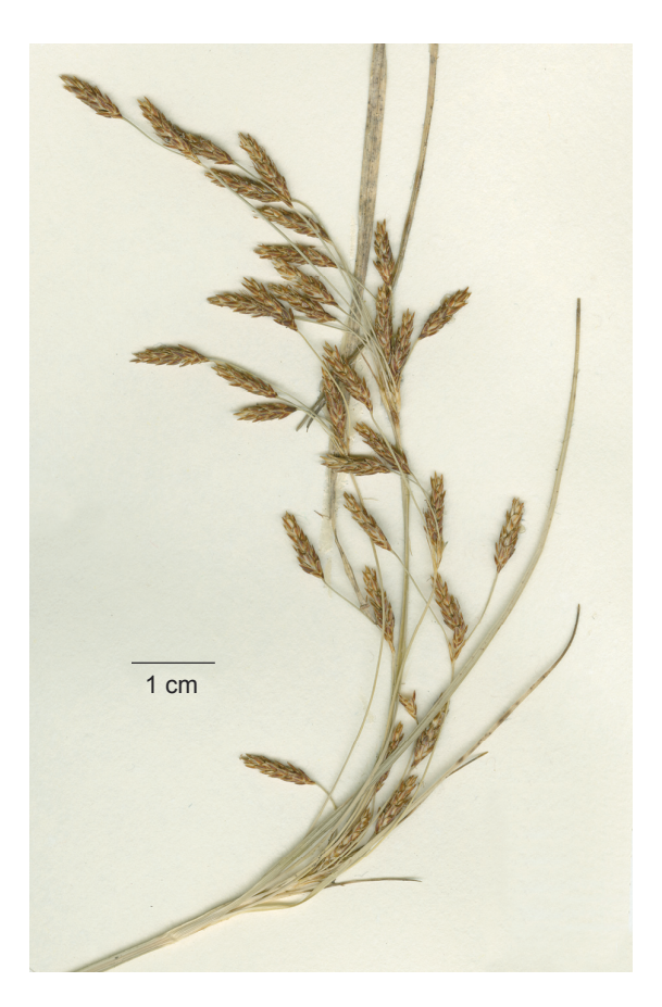
Fig. 2. Inflorescence of Cypringlea evadens (C. D. Adams) Reznicek & S. González [ Breedlove 11204 (MICH)].

as the inflorescence; primary rays 5-15 ascending to curving with age, at least the thinnest more or less flexuous, flattened or compressed-trigonous, antrorsely scabrous on margins distally, smooth proximally, the longest 5-11 cm, second, third, and occasionally fourth order branching present, with the spikelets ultimately sessile or rarely short-peduncled (< 5 mm) in fascicles of 2-7 or rarely solitary at tips of primary or second order branches. Spikelets 25-200 per inflorescence, not more than 15% peduncled, linear-ellipsoid, 4-9.5 mm long, 1.7-2.7 mm wide, cuneate at base, acute at apex; scales somewhat spreading, loosely spirally arranged, with 2-4 sterile scales at the base of the spikelet (excluding the prophyll) and 8-25 fertile