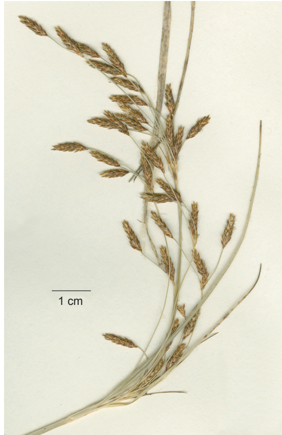
Fig. 2. Inflorescence of Cypringlea evadens (C. D. Adams) Reznicek & S. González [ Breedlove 11204 (MICH)].

as the inflorescence; primary rays 5-15 ascending to curving with age, at least the thinnest more or less flexuous, flattened or compressed-trigonous, antrorsely scabrous on margins distally, smooth proximally, the longest 5-11 cm, second, third, and occasionally fourth order branching present, with the spikelets ultimately sessile or rarely short-peduncled (< 5 mm) in fascicles of 2-7 or rarely solitary at tips of primary or second order branches. Spikelets 25-200 per inflorescence, not more than 15% peduncled, linear-ellipsoid, 4-9.5 mm long, 1.7-2.7 mm wide, cuneate at base, acute at apex; scales somewhat spreading, loosely spirally arranged, with 2-4 sterile scales at the base of the spikelet (excluding the prophyll) and 8-25 fertile