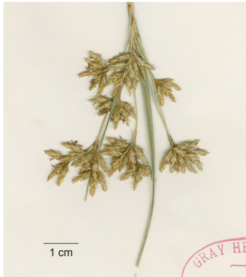
Fig. 1. Inflorescence of Cypringlea analecta (Beetle) M. T. Strong [ Purpus 5454 (GH, isotype)].

Cypringlea analecta (Beetle) M. T. Strong, Novon 13: 125. 2003. Scirpus analecta Beetle, Brittonia 5: 148. 1944 (as Scirpus analecti ). Type: Mexico. San Luis Potosí, Minas de San Rafael, May 1911, C. A. Purpus 5454 (holotype, NY; isotypes, F, GH, MO, UC (has date of July 1911 according to Strong, 2003), US).