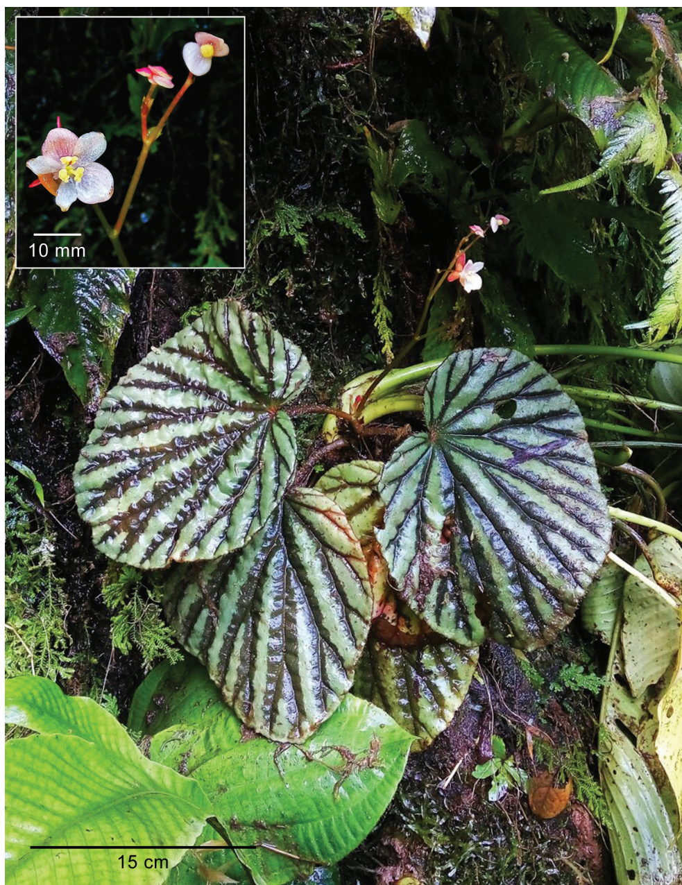
Fig. 2. Habit of Begonia promethea Ridl. in Bengkayang, West Kalimantan (inset: inflorescence showing basal female flower and distal male flowers). All from WEKBOE 185 .

Habitat. Lowland forest at 50–150 m elevation, growing on wet, shaded and almost vertical sandstone cliffs (Buso) or basalt cliffs with water spray, sometimes in direct sunlight (Berawat'n Waterfall). Very local but can densely cover the rock face in small