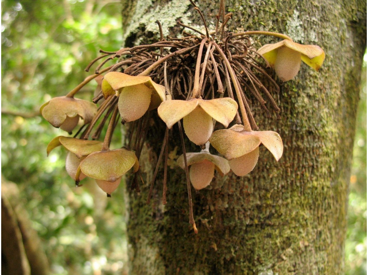
Figure 4. Fruits on the trunk of a tree of Diospyros labatiana , a newly identified species that can reach 16 m tall and almost 30 cm in diameter.

The current taxonomic information and the available identification tools are both seriously inadequate. For instance, individual logs that belong to the same species of Dalbergia could be classified, using today's tools, as either palissander or rosewood, depending on the definition of these two categories and the knowledge of the person identifying the logs. Without reproductive structures, wood samples cannot be assigned with certainty to a species. In its current implementation, the TRAFFIC wood identifier can only classify wood as ebony, palissander or rosewood in the field and cannot identify the corresponding Dalbergia or Diospyros species. 12