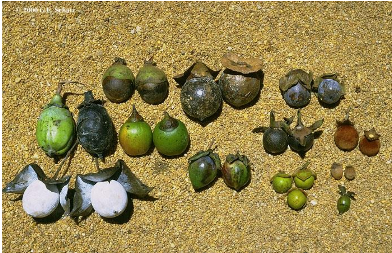
Figure 3. Twelve species of Diospyros fruiting simultaneously on Nosy Mangabe island in northeastern Madagascar, seven of which are new to science.

Authoritatively identified herbarium material provides information on the geographic distribution and commonness/rarity (number of documented localities) of Diospyros species in Madagascar. This information is available for all published species (including as on-line maps) through the Diospyros page on the Madagascar Catalogue (The Madagascar Catalogue, 2016). For species that remain to be formally named and described, data on geographic range have been compiled by the two specialists working on the genus (see Box 3 for more information on how species are formally named and described). Some species of potentially exploitable size that can reach 40-60 cm DBH are widespread, such as D. haplostylis , D. sakalavarum and D. tropophila , while others, including D. bemarivensis , D. antongilensis and D. taikintana (the latter two unpublished), have much more restricted ranges. Most Malagasy forests contain multiple species of Diospyros , almost always including some that have large enough trunks to produce commercially valuable wood. At least half of the co-occurring species shown in Figure 3 are large trees and Figure 4 shows an example of a potentially exploitable species in the wild.