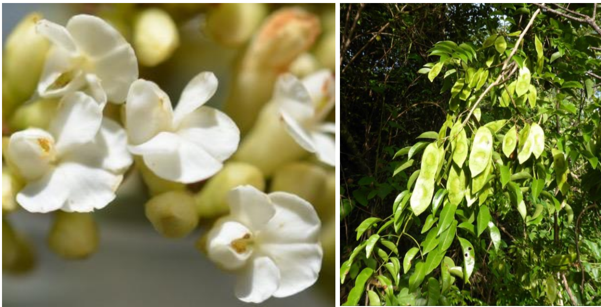
Figure 2. (Left) Flowers of Dalbergia monticola; (Right) Fruits of Dalbergia bracteolata.

in Madagascar, out of a worldwide total of 140 (250 total taxa when subspecies and varieties are included) (Bossler & Rabevohitra, 2002; Klitgaard & Lavin, 2005). The species of Dalbergia occurring in Madagascar can be distinguished from one another by characters of their flowers and fruits but even expert scientists are unable to tell species apart without these reproductive structures (i.e., when only leaves are available; see Figure 2 for examples of Dalbergia flowers and fruits). Moreover, recent studies involving DNA sequence data from field-collected material (Hassold et al., unpublished data) and careful examination of herbarium specimens (Phillipson et al., unpublished data) have shown that some of the species defined in the most recent taxonomic treatment of the genus in Madagascar (Bossler & Rabevohitra, 2002) appear to represent several distinct entities and that at least some of the subspecies and varieties they described should be recognized as separate species (see Box 4 for a description on how plant species are formally named and described). Wood features are helpful for recognizing some species or species groups, but require specialist knowledge. As a consequence, the names used in published sources and on commercial export permits are frequently incorrect or wrongly assigned.