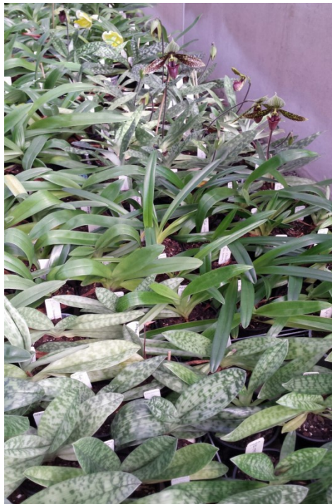
Unheated glasshouse with light shading Temperature of 0 to 5 degrees C in winter