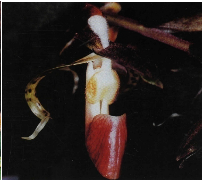
Paphiopedilum gigantifolium Braem, Baker & Baker