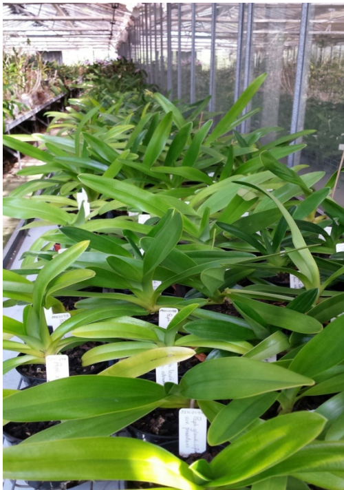
Heated glasshouse with light shading

The above is only a guide and must not be relied upon completely. It is necessary to experiment and test out your own growing environment with lesser quality plants in your collection before you put your entire collection under these conditions.