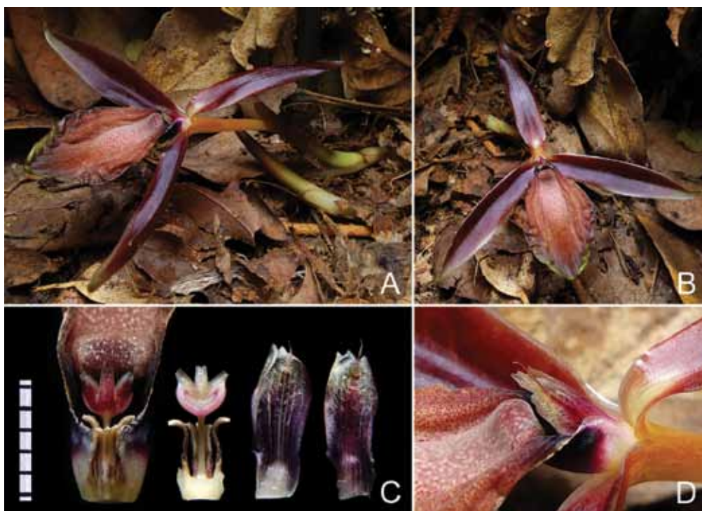
Fig. 2. Orchidantha lengguanii Škorničk. A. Flower (semi-side view). B. Flower (front view). C. Detail of stigma (dorsal view) with anthers attached and petals removed, stigma (ventral view) and petals (scale in mm). D. Detail of petals and a prominent bulge on the basal part of the labellum opposite the stigma. Photographed at Forest Research Institute Malaysia, Acc. No. FRIM 2002-0665.

with prominently inflexed side lobes, 4 mm wide (with side lobes unextended – i.e. in their inflexed position), dark maroon-purple (almost black) but lighter towards the ovary extension. Stamens c. 3 mm long; filament c. 0.5 mm long, anther thecae c. 2.5 mm long, longitudinally dehiscent throughout their length. Style 2–3 mm long; stigma 2–2.5 mm long, deeply three-lobed, dorsal surface pink with purple patches; stigma lobes pink purple, conduplicate, with margin whitish, semi-translucent, membranous, irregularly and sparsely serrated; median lobe 2–2.5 mm long; lateral lobes c. 2 mm long; viscidium broadly U-shaped. Fruits and seeds not seen. Based on living and spirit material of FRI 75738 and spirit material of FRI 48193.