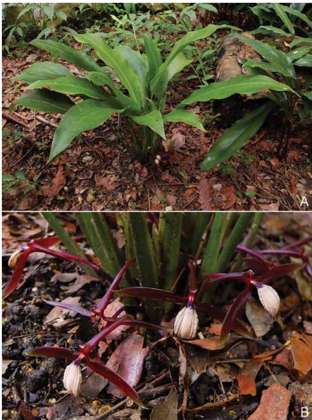
Fig. 3. Orchidantha maxillarioides (Ridl.) K.Schum. A. Habit. B. Flowers. Photographed at Singapore Botanic Gardens, SBG 20104107.