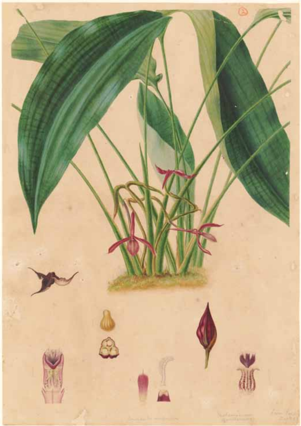
Fig. 5. The colour painting of Protamomum maxillarioides made from living material in Singapore Botanic Gardens by James de Alwis, designated as epitype. Reproduced with permission of the Singapore Botanic Gardens.