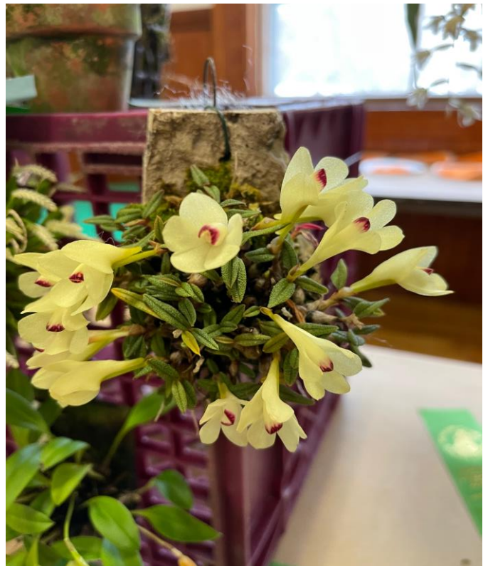
Den. cuthbertsonii white