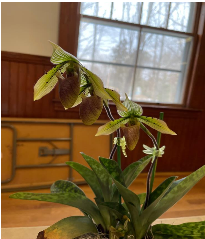
Paph. Stella Scope

Masd. Snowbird Ddc. wenzelii 'Cooper' Ddc. quadrilobum