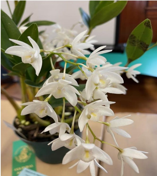
Den. kingianum x delicatum