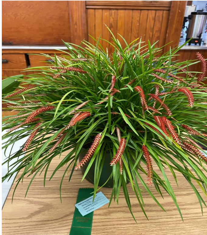
Ddc. wenzelii 'Cooper'