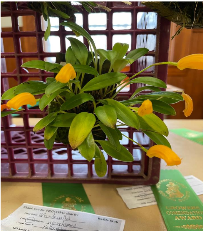
Masd. mendozae yellow