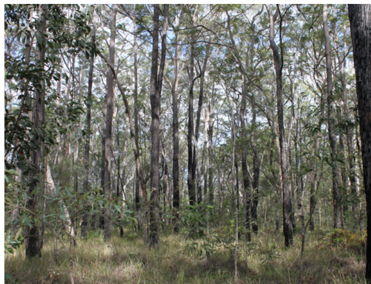
Photo lower right also shows RE 12.5.3 with a Scribbly Gum ( Eucalyptus racemosa subsp. racemosa ) dominated open woodland with Forest Grass Trees ( Xanthorrhoea johnsonii ) in the understorey.

Photo top right shows RE 12.5.3 with Queensland White Mahogany ( Eucalyptus tindaliae ) dominating.