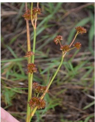
Juncus holoschoenus - Joint-leaved Rush