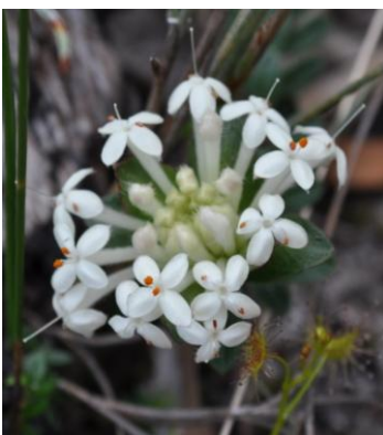
Pimelea glauca - Smooth Rice-flower