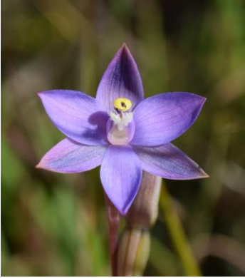
Thelymitra arenaria - Forest Sun-orchid