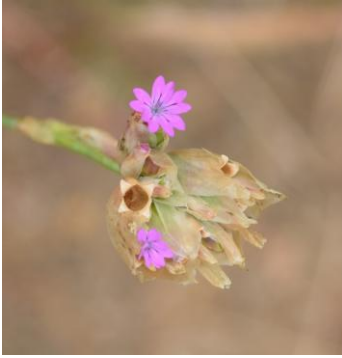
*Petrorhagia dubia - Proliferous pink