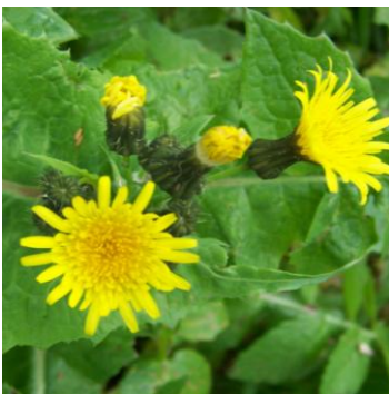
*Sonchus oleraceus - Sow Thistle

Naturalised species with scattered occurrences on this site.