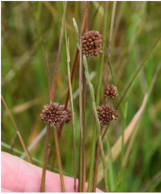
Ficinia nodosa - Knobby Club-rush