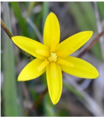
Hypoxis hygrometrica - Yellow Star