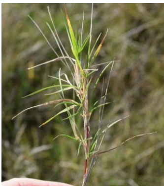
Distichlis distichophylla - Australian Salt-grass