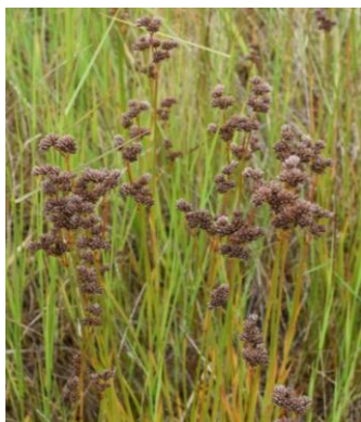
Juncus caespiticius - Grassy Rush