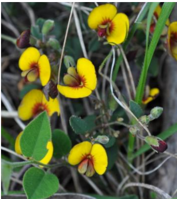
Bossiaea prostrata - Creeping Bossiaea