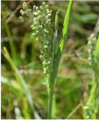
*Briza minor - Shivery Grass