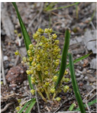
Lomandra filiformis spp coriacea - Wattle Mat-rush