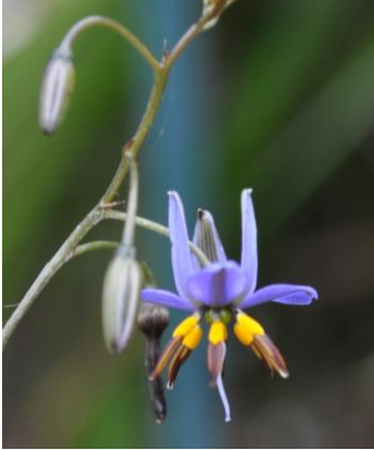
Dianella admixta/revoluta - Black-anther Flax-lily