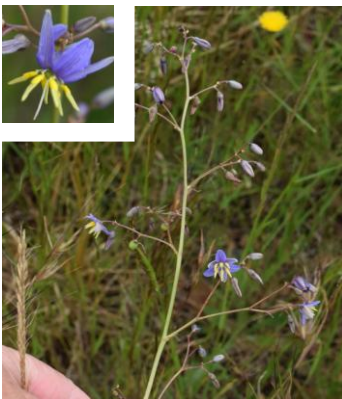
Dianella longifolia var. longifolia - Pale Flax-lily