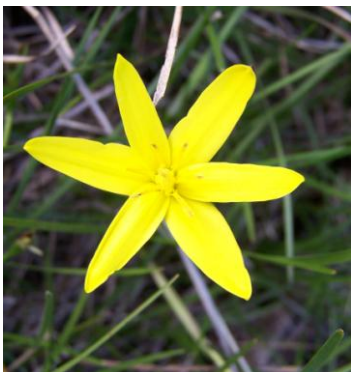
Hypoxis vaginata var. vaginata - Yellow Star

Relatively common on this site in wetter zones.