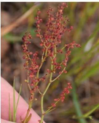
* Acetosella vulgaris - Sheep's Sorrel