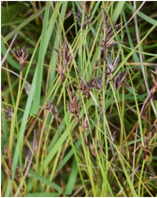
Schoenus apogon - Common Bog-rush