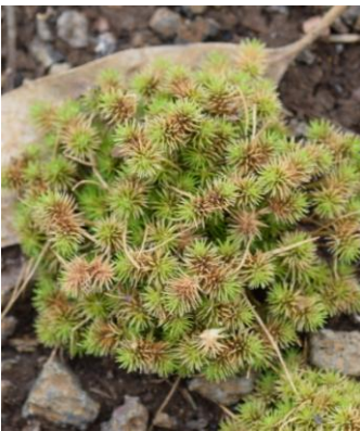
Isolepis hystrix - Awned Club-sedge