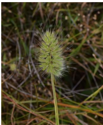
*Cynosurus echinatus - Rough Dog's Tail

Naturalised species which is very common on this site.