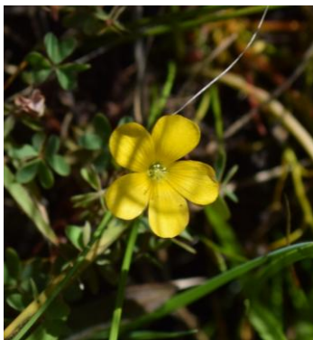
Oxalis perennans - Grassland Wood-sorrel

Small population surviving in a drain line.