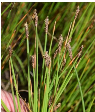
Eleocharis acuta - Common Spike-rush