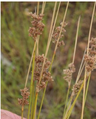
Juncus amabilis - Hollow Rush