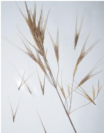
*Bromus diandrus - Great Brome

Naturalised species which is very common on this site.