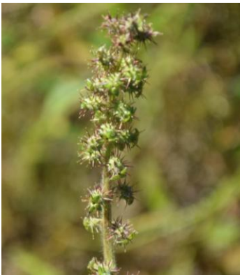
Acaena ovina - Sheep's Burr