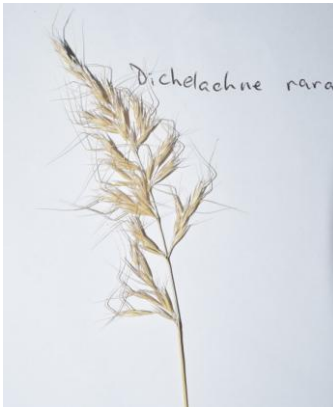
Dichelachne rara - Plume Grass