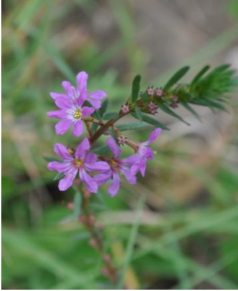
Lythrum hyssopifolia - Small Loosestrife