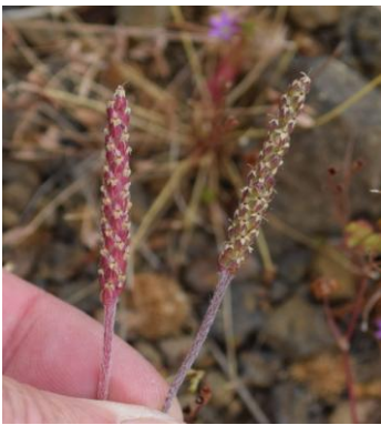
*Plantago coronopus subsp. coronopus - Buck's Horn Plantain

Naturalised species with scattered occurrences on this site.