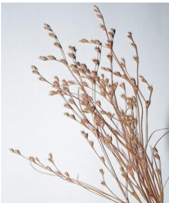
Juncus bufonius - Toad Rush