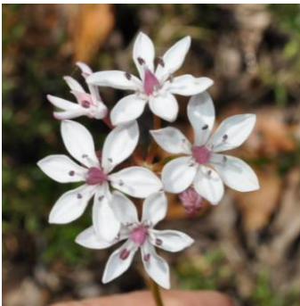
Burchardia umbellata - Milkmaids