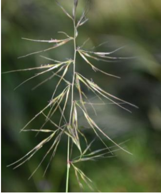
Rytidosperma sp. - Wallaby-grass