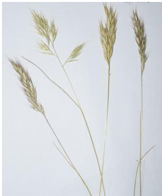
*Bromus hordeaceus - Soft Brome

Naturalised species which is very common on this site.