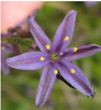
Caesia calliantha - Blue Grass-lily