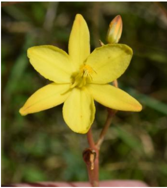
Bulbine bulbosa - Bulbine Lily