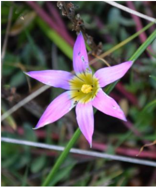
*Romulea rosea - Onion Grass