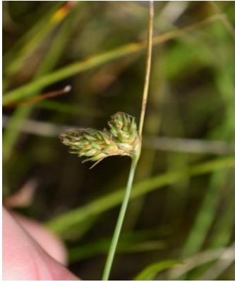
Carex inversa - Knob Sedge