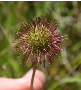
Acaena novae-zelandiae - Bidgee Widgee