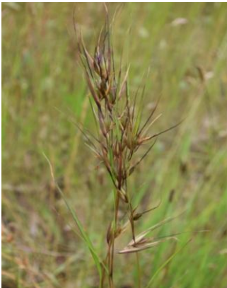
Themeda triandra - Kangaroo Grass