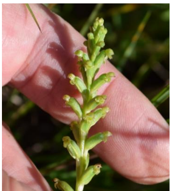
Microtis unifolia - Onion Orchid