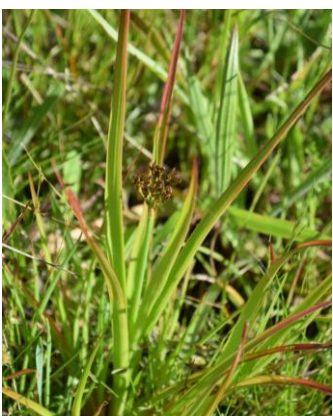
Juncus planifolius - Broad-leaved Rush