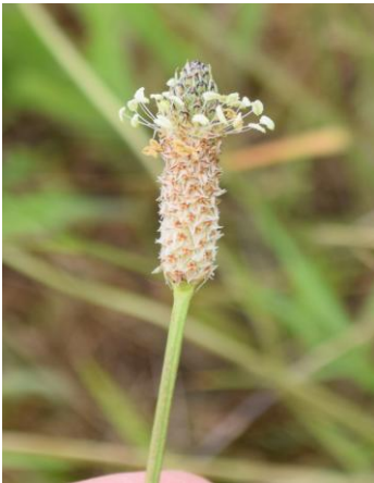
*Plantago lanceolata - Plantain

Naturalised species with scattered occurrences on this site.