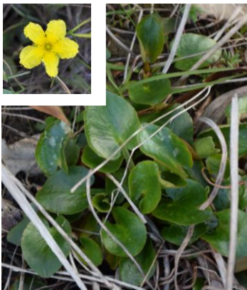
Ornduffia (Villarsia) reniformis - Running Marsh Flower