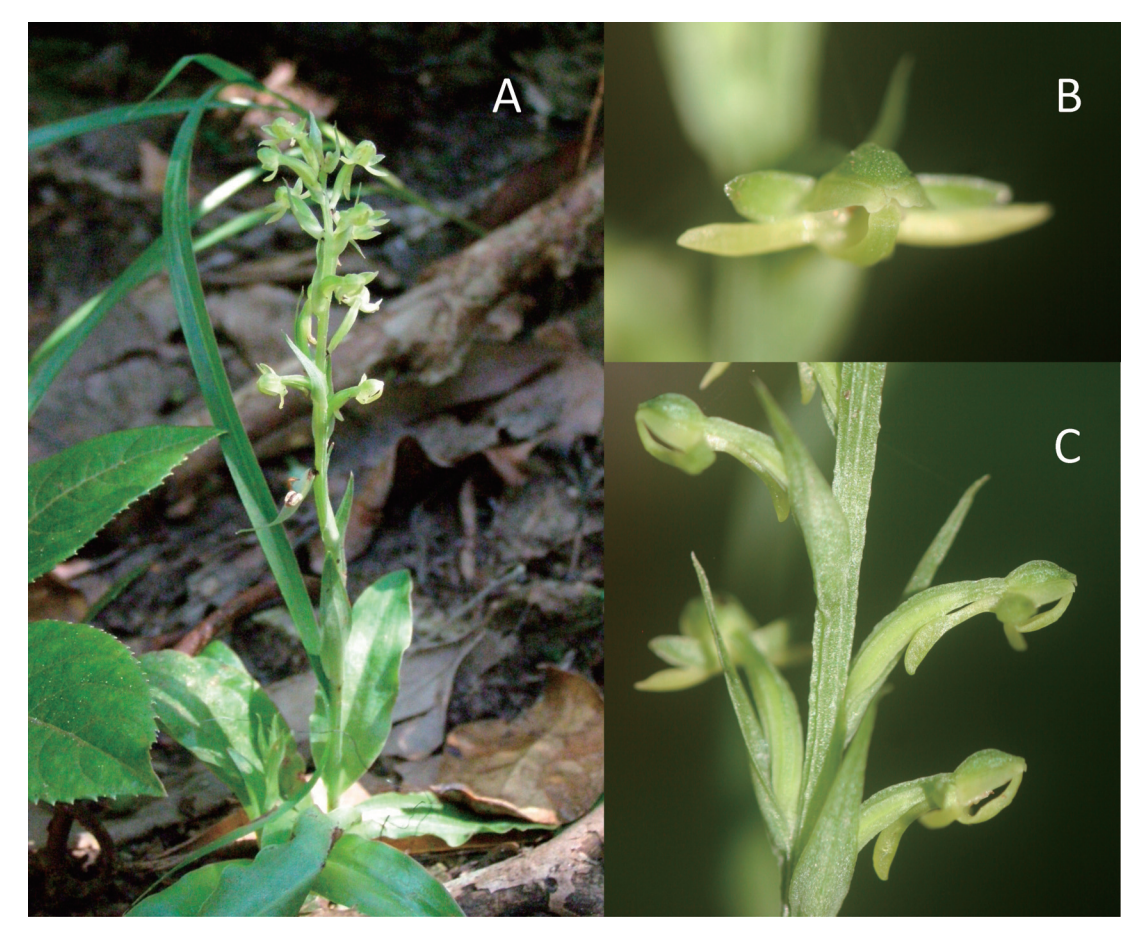
Fig. 2. Habenaria crassilabia Kraenzl. from the habitat of Niijima Island, Japan. A. Habit; B . Flower, front view; C . Flower, side view.

Native Orch. Taiwan 2: 198 (1977). Chen & Cribb, Fl. China 25: 158 (2009), pro parte.