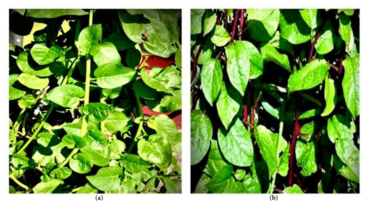
Figure 1. Photographic representation of (a) Basella alba and (b) Basella rubra . [ Basella alba (" alba " means "white" in Latin) has white stem; B. rubra (" rubra " means "red" in Latin ) has reddish stem]

Comparison between the five species, " Basella alba " and " Basella rubra " are widely studied in the country of Bangladesh. Basella alba L. states of sound phytochemical establishment, wellsprings of phytosterols, phenolic acids,