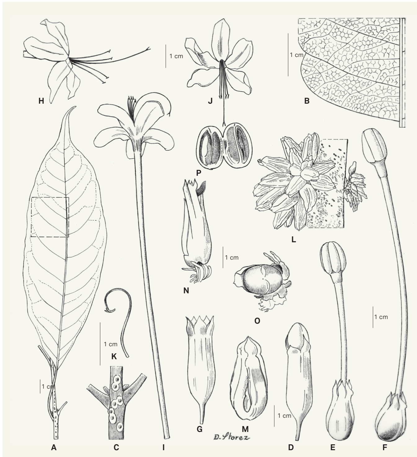
Fig. 1. – Line drawings of Clerodendrum kamhyoae Phillipson & Allorge. A. Leaf showing long attenuate-acuminate apex and arcuate secondary veins; B. Detail of secondary and tertiary leaf venation; C. Stem node showing lenticelles; D. Early flower bud with the corolla pushing open the sepals; E. Young flower bud with elongating corolla tube; F. Pre-anthesis flower bud; G. Mature calyx; H. Corolla seen from side (tube incomplete); I. Corolla seen from below; J. Corolla seen from front; K. Stamen with mobile anther thecae; L. Young inflorescences; M. Calyx surrounding an immature drupe showing an irregular split due to the expansion of the ovary; N. Part of infructescence, with calyx enveloping immature fruit and pedicels of fallen flowers visible; O. Fruit with calyx removed to show the upper surface of the drupe; P. Longitudinal section of the ovary showing the two locules. [A-K: Allorge 2839, P; L-P: redrawn from photographs] [Drawings: D. Storez]