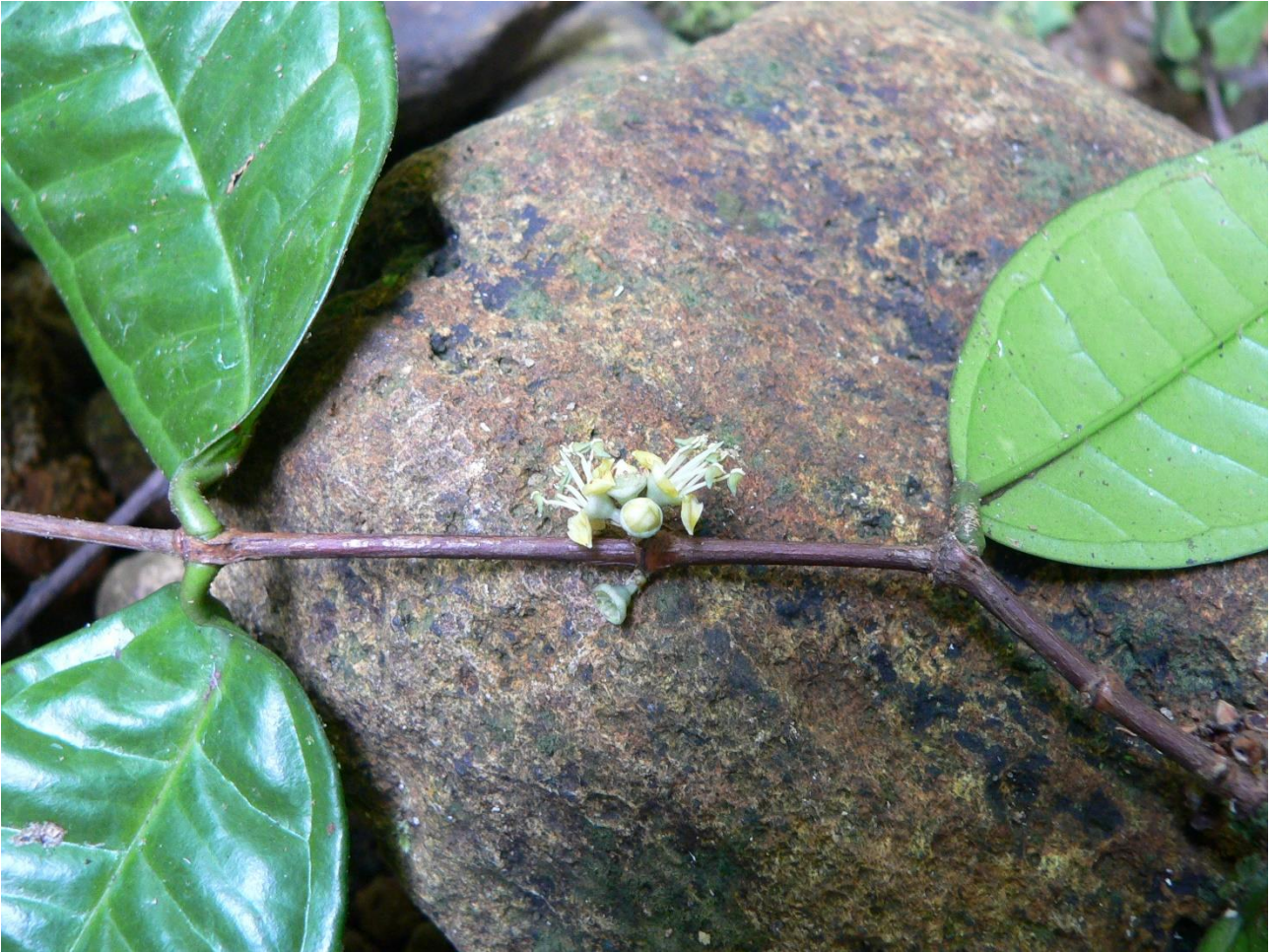
Fig. 1 Memecylon ebo Flowering branch of Prenner 23.