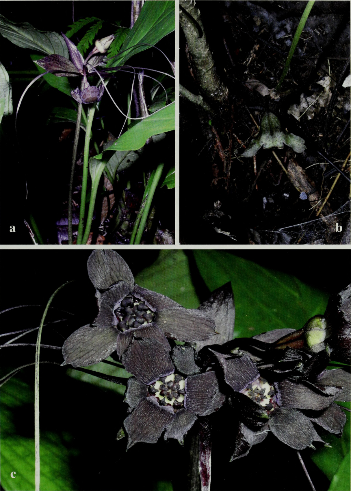
Plate 3a. Tacca reducta . Note the stellate arrangement of the small homeomorphic involucral bracts. 3b. close up of flowers. 3c. Nearly ripe fruit. Note the persistent perianth.