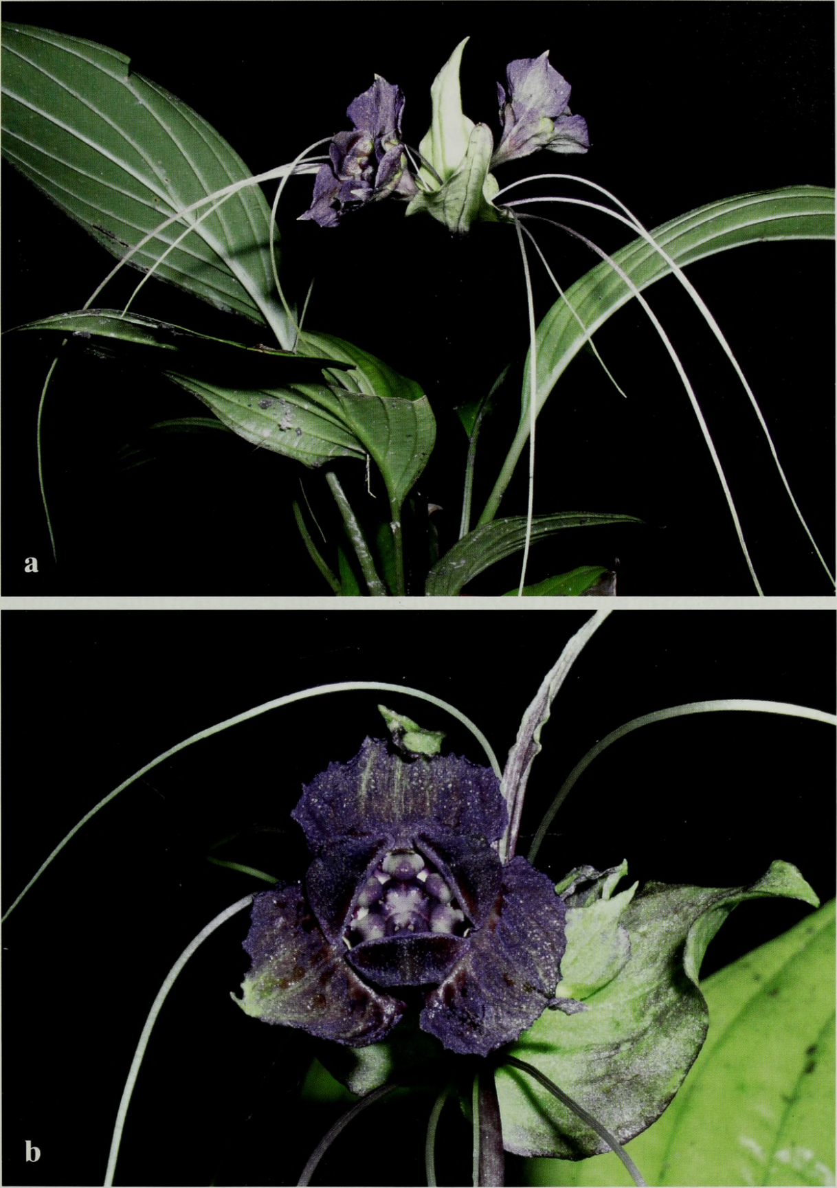
Plate 2a. Tacca bibracteata . Note the inner involucre bracts nearly indistinguishable from the filiform bracts, the inflorescence giving the impression of only two involucre bracts. 2b. Close up of flowers.