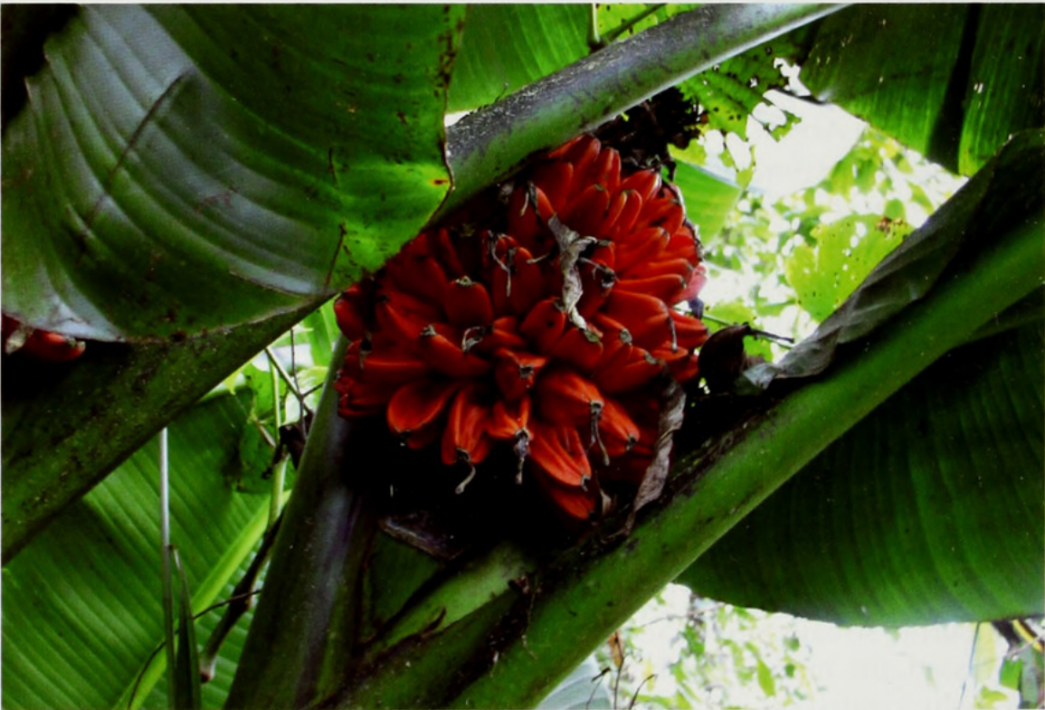
Figure 2. Musa arfakaina with mature fruit.