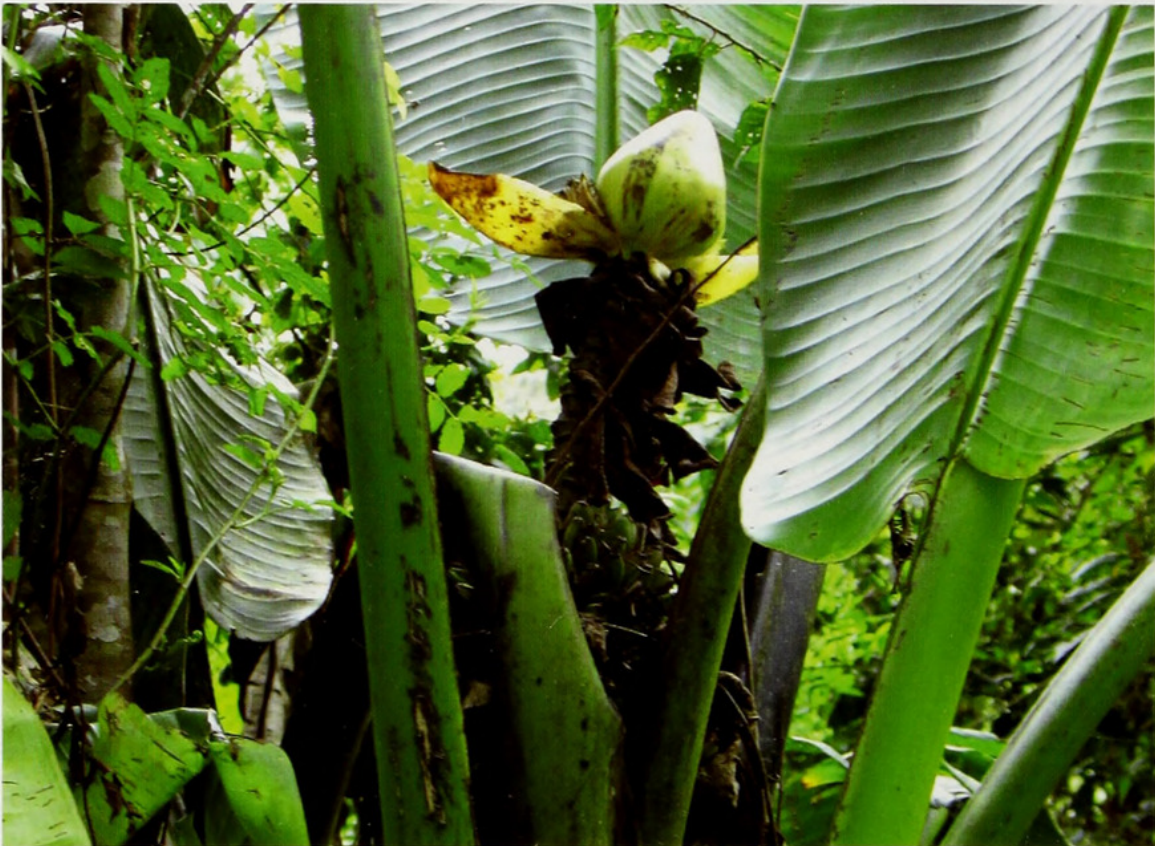
Figure 1. Musa arfakiana with inflorescence showing the male bud.