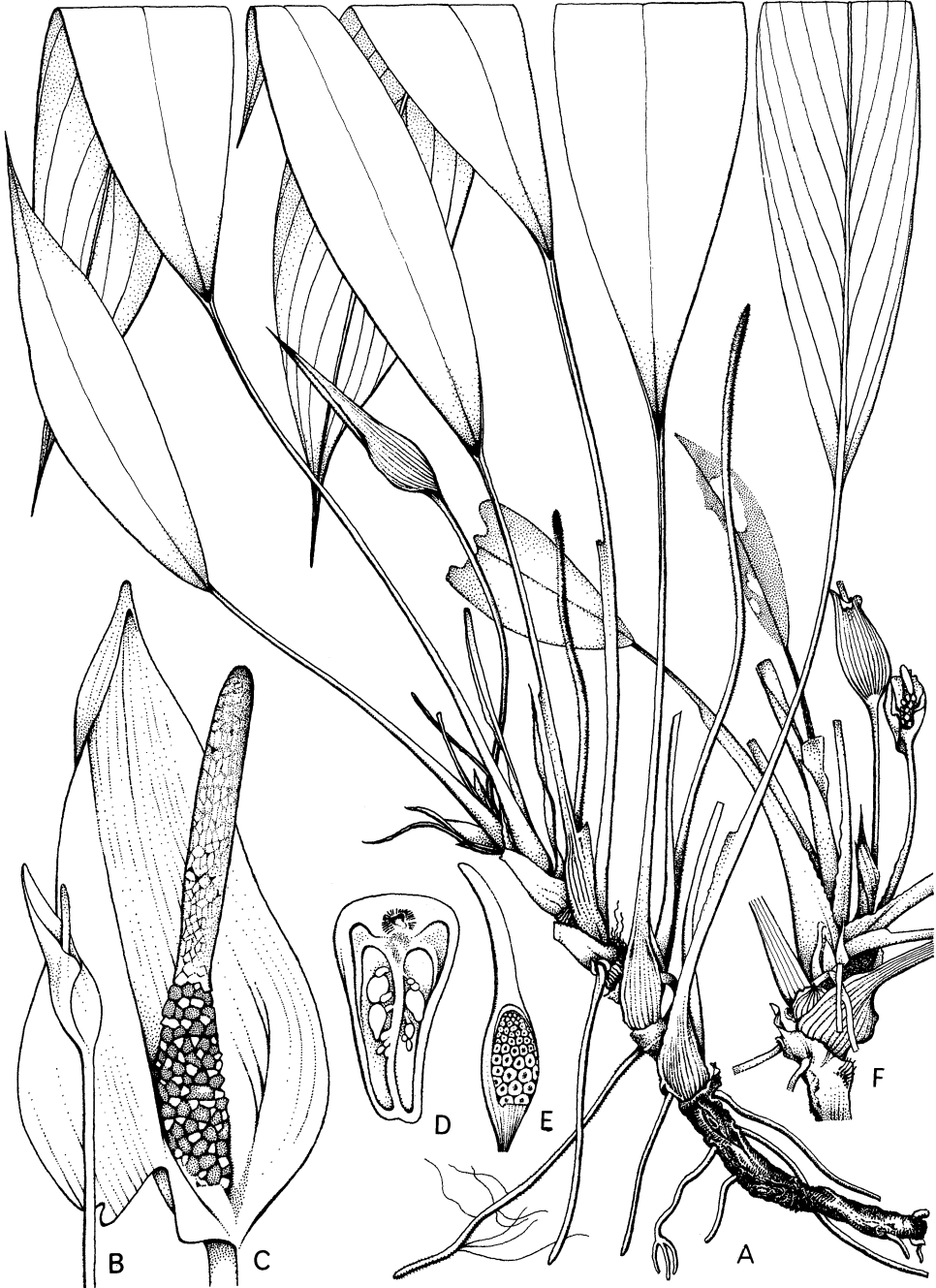
FIG. 3. Homalomena vagans . A habit \times \frac{1}{2} ; B inflorescence \times \frac{2}{3} ; C inflorescence with spathe partially removed to reveal spadix \times 2 ; D ovary, longitudinal section \times 9 ; E infructescence with spathe partially removed to reveal berries \times \frac{2}{3} ; F fruiting habit \times \frac{1}{2} . Drawn from ( A , B , F ) Poulsen & de la Motte 47, ( C , D , E ) Poulsen & de la Motte 273 by Emmanuel Papadopoulos.