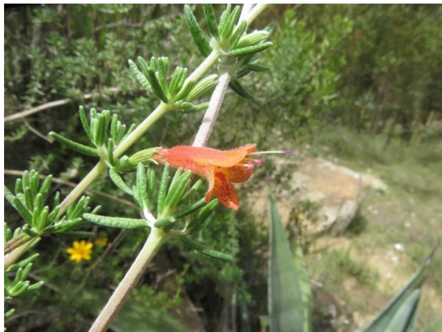
Figure S1. Picture of Clinopodium sericeum , collected in Cajamarca, Peru.