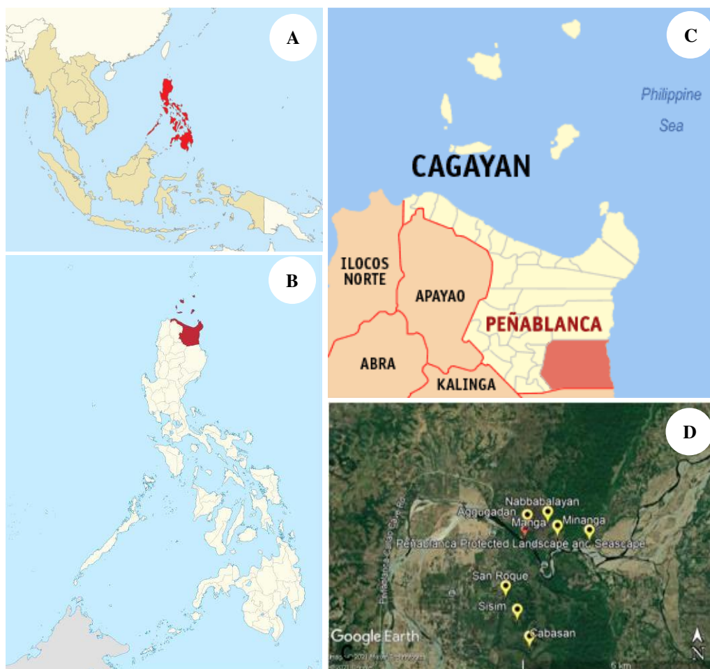
Figure 1. A. Map of South East Asia showing the Philippines, B. Map of the Philippines showing the location of Peñablanca, C. Map of Peñablanca showing the Peñablanca PLS D. Surveyed sites are secondary growth forests on limestone karst substrates and are marked yellow

The survey was conducted at Peñablanca PLS, the southernmost part of Cagayan province at 121°49' to 122°13' E and 17°32' to 17°50' N covering seven barangays/districts, i.e., Aggugaddan, Cabasan, Nabbabalayan, San Roque, and Sisim on the western side and Mangga and Minanga on the eastern side. The boundaries of Peñablanca PLS are the municipality of Baggao, Cagayan, in the north; the Pacific Ocean in the east; the province of Isabela in the south and by Tuguegarao City and the municipality of Iguig, Cagayan, in the west (Figure 1). Peñablanca PLS has a total area of 103,801 ha of land and was declared a protected area under Proclamation No. 416 signed by then-President Fidel V. Ramos on June 29, 1994. The collection was particularly done in secondary-growth forests on limestone karst substrates covering an area of 7,000 ha. Profile of surveyed barangay is presented in Table 1.