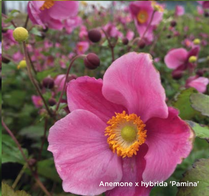
Anemone x hybrida 'Pamina'