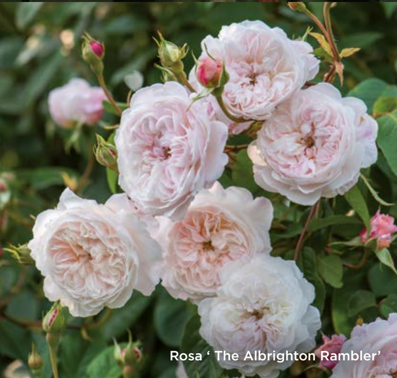
Rosa 'The Albrighton Rambler'