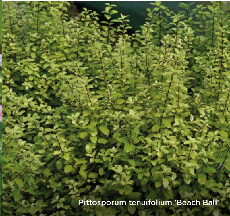
Pittosporum tenuifolium 'Beach Ball'