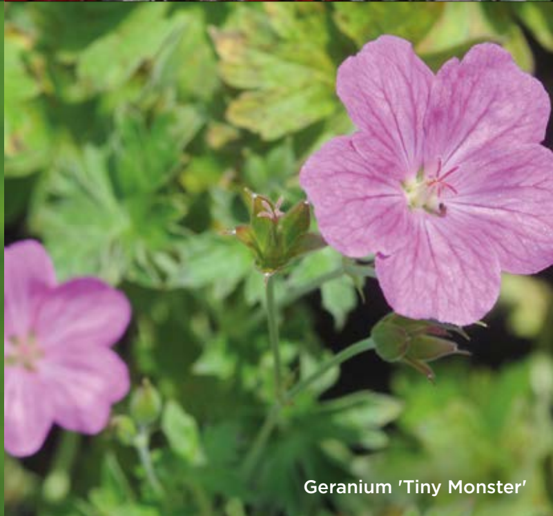
Geranium 'Tiny Monster'