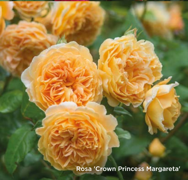
Rosa 'Crown Princess Margareta'