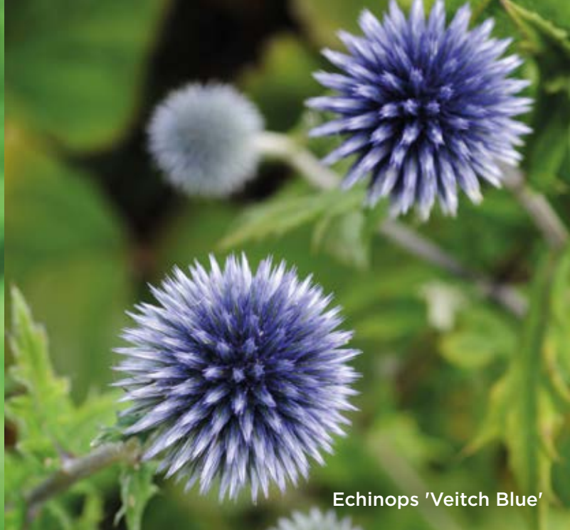
Echinops 'Veitch Blue'