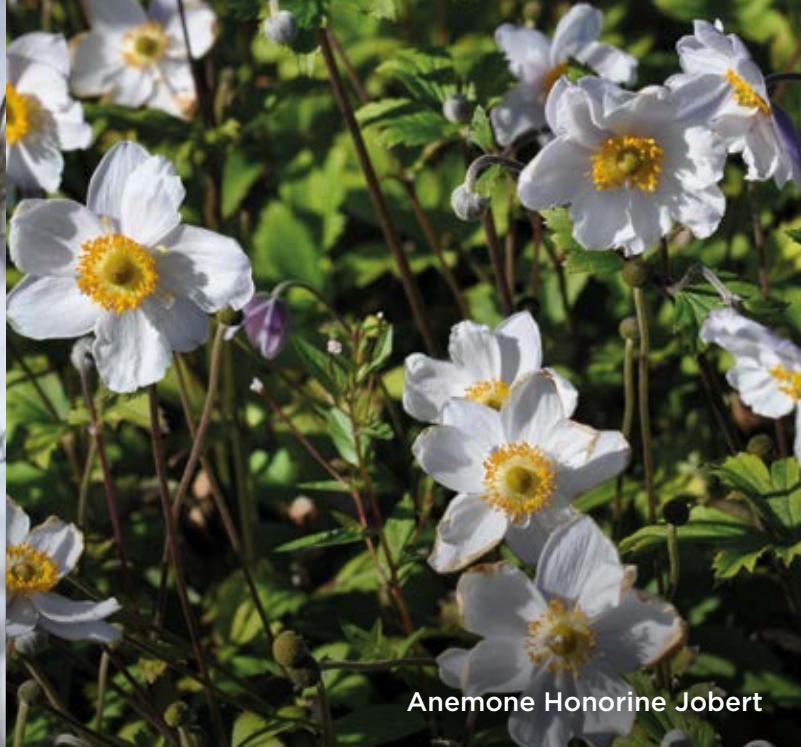
Anemone Honorine Jobert