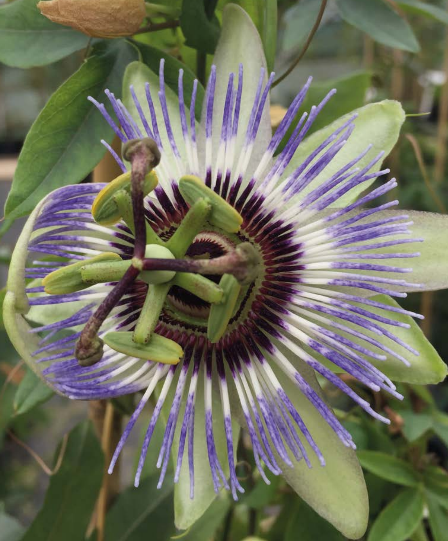
Passiflora caerulea 'Clear Sky'