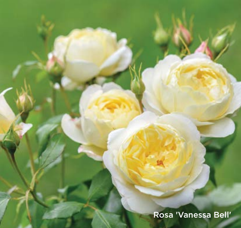
Rosa 'Vanessa Bell'