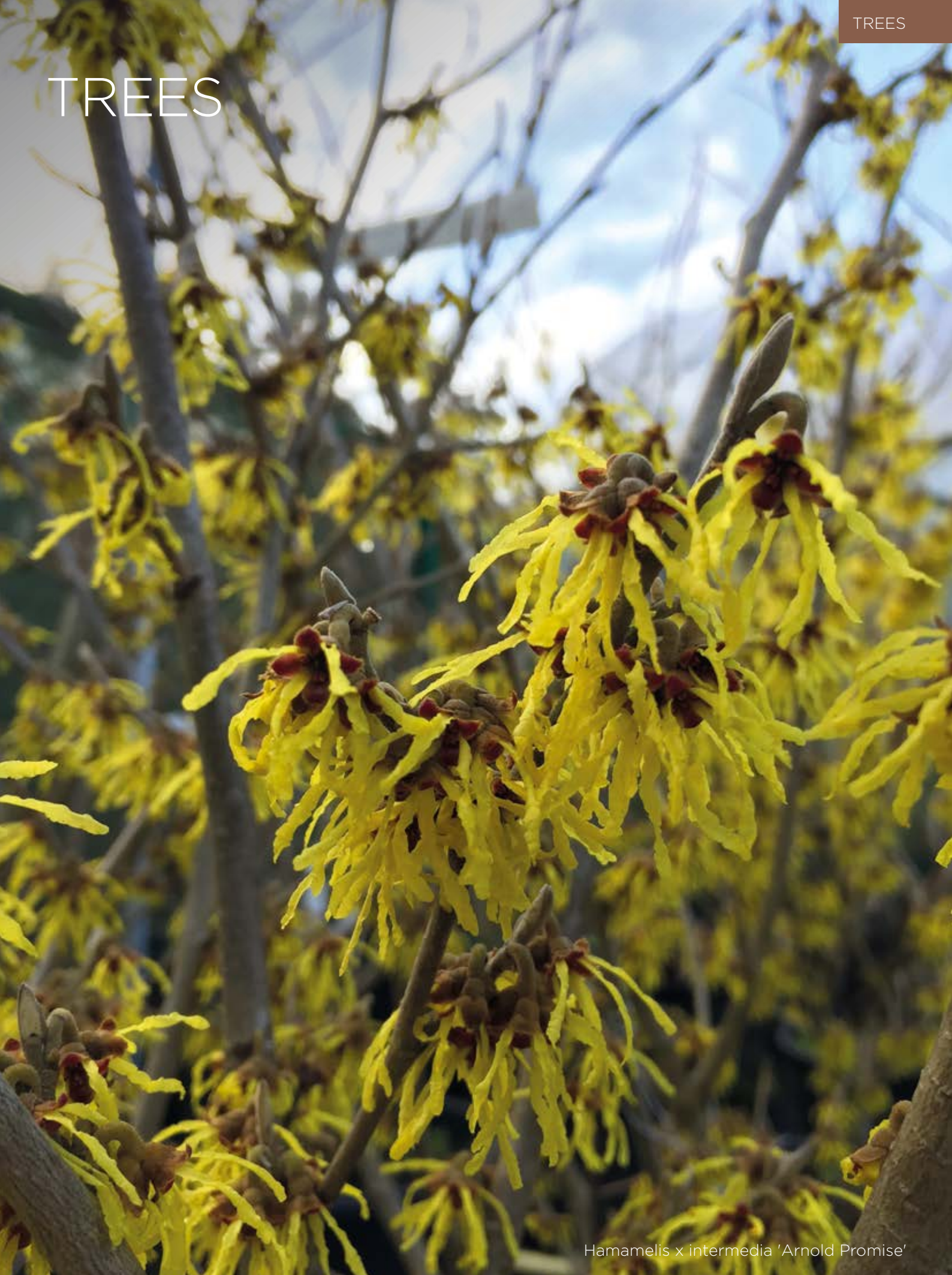
Hamamelis x intermedia 'Arnold Promise'