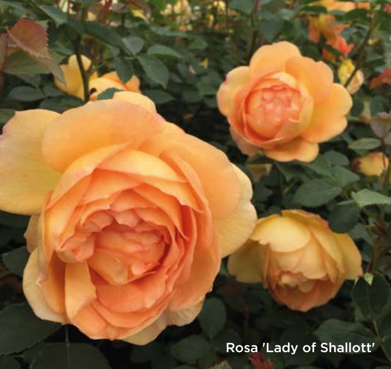
Rosa 'Lady of Shallott'