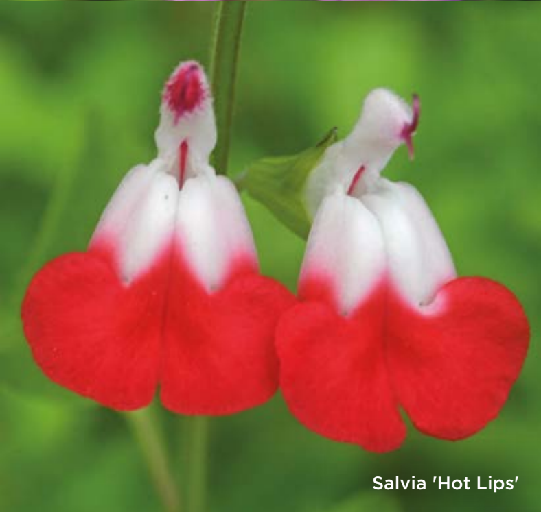
Salvia 'Hot Lips'