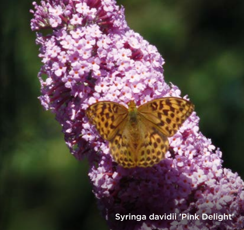
Syringa davidii 'Pink Delight'