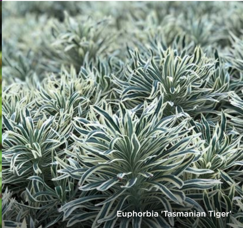
Euphorbia 'Tasmanian Tiger'