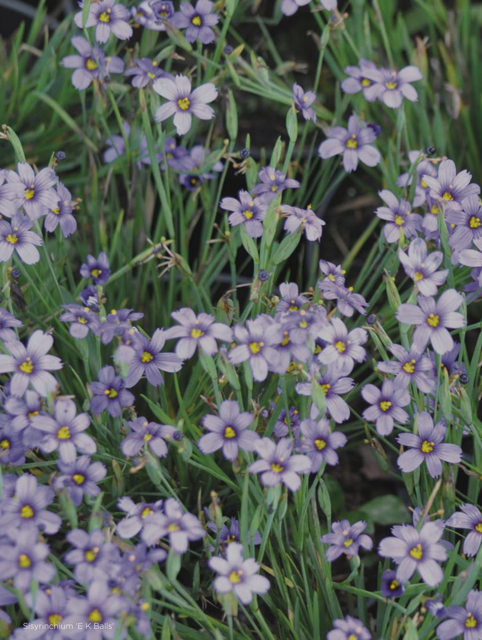
Sisyrinchium 'E K Balls'