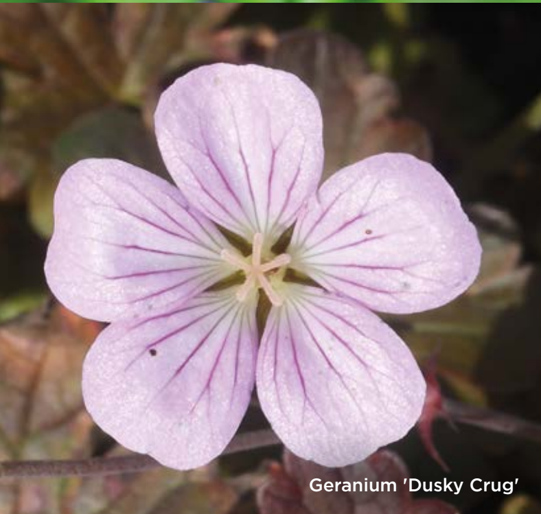
Geranium 'Dusky Crug'