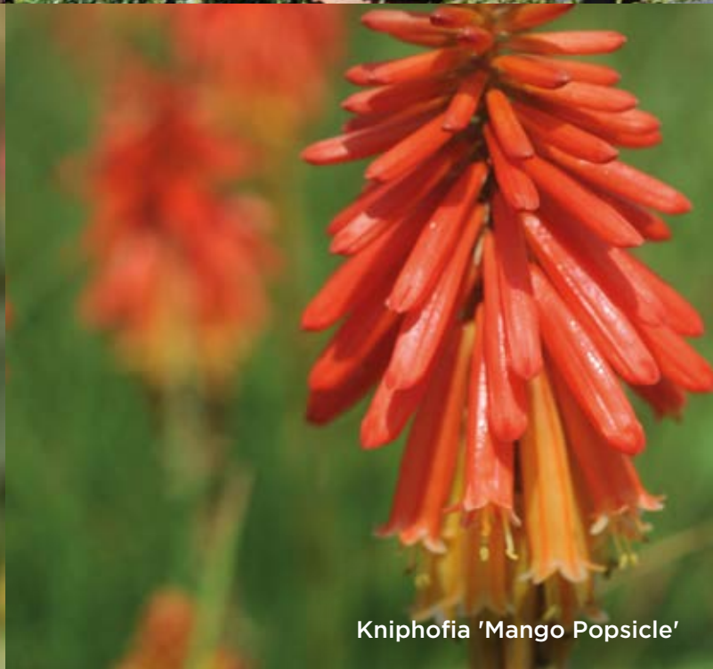
Kniphofia 'Mango Popsicle'