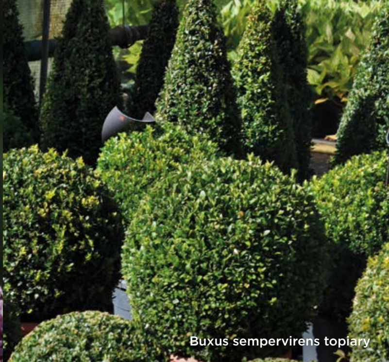
Buxus sempervirens topiary