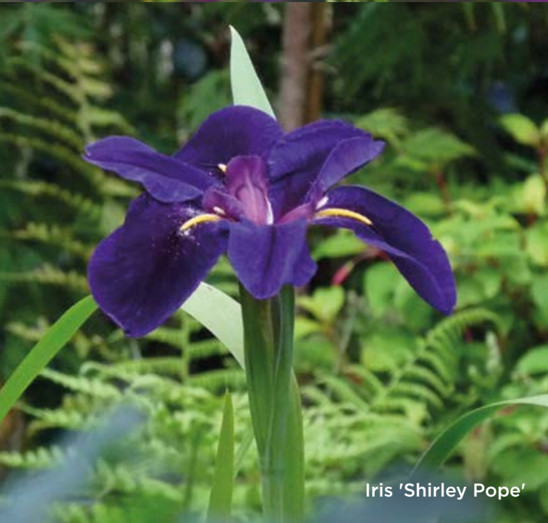
Iris 'Shirley Pope'