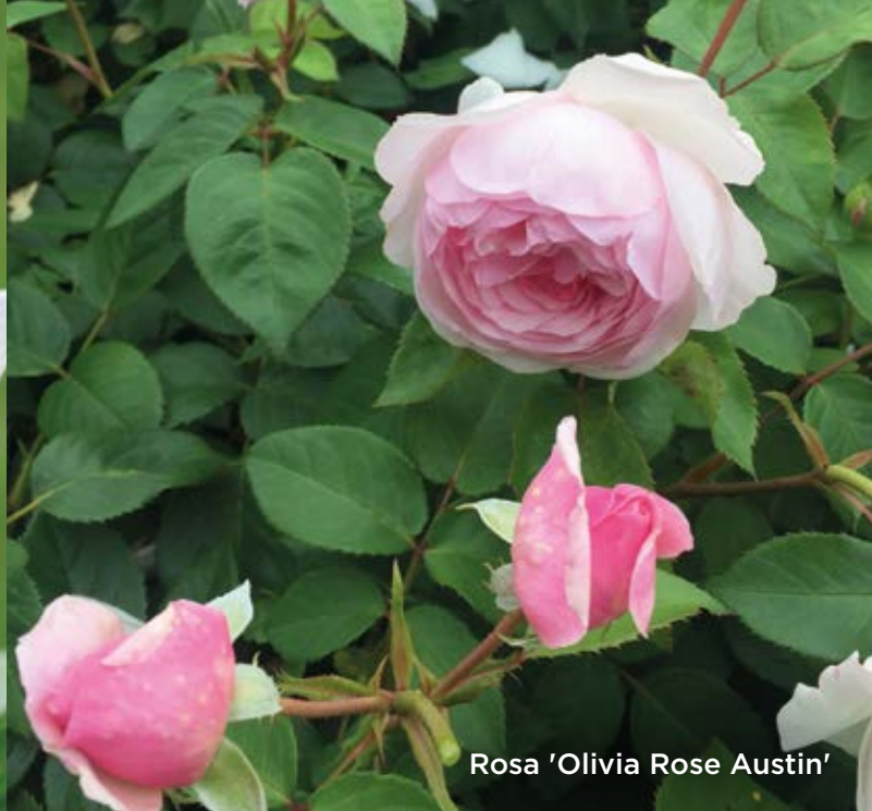
Rosa 'Olivia Rose Austin'