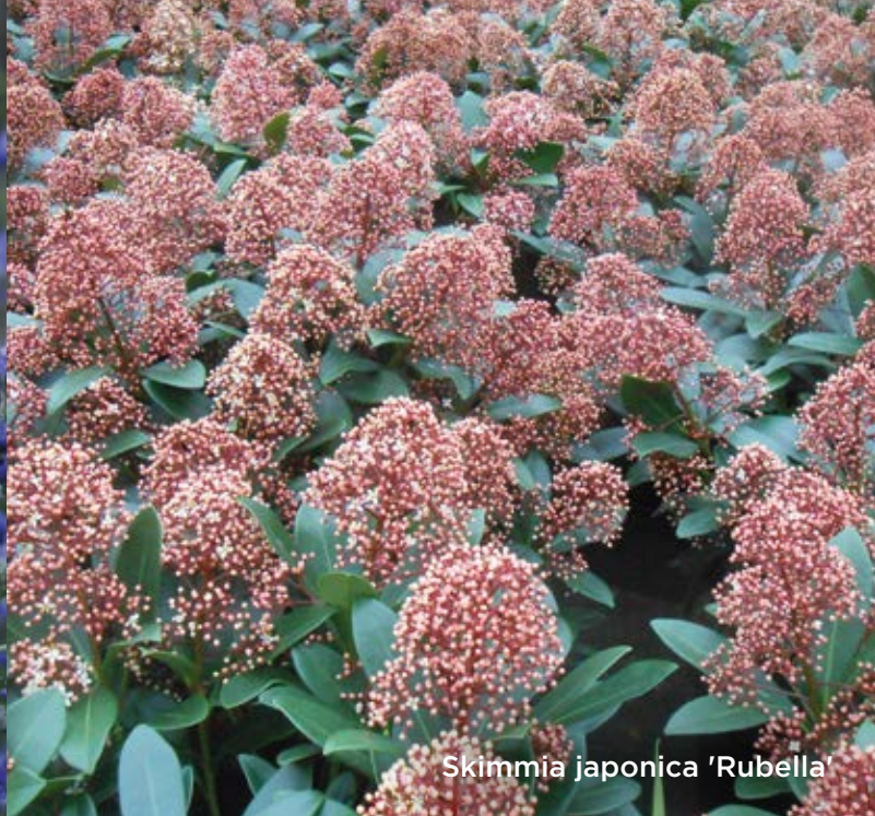
Skimmia japonica 'Rubella'