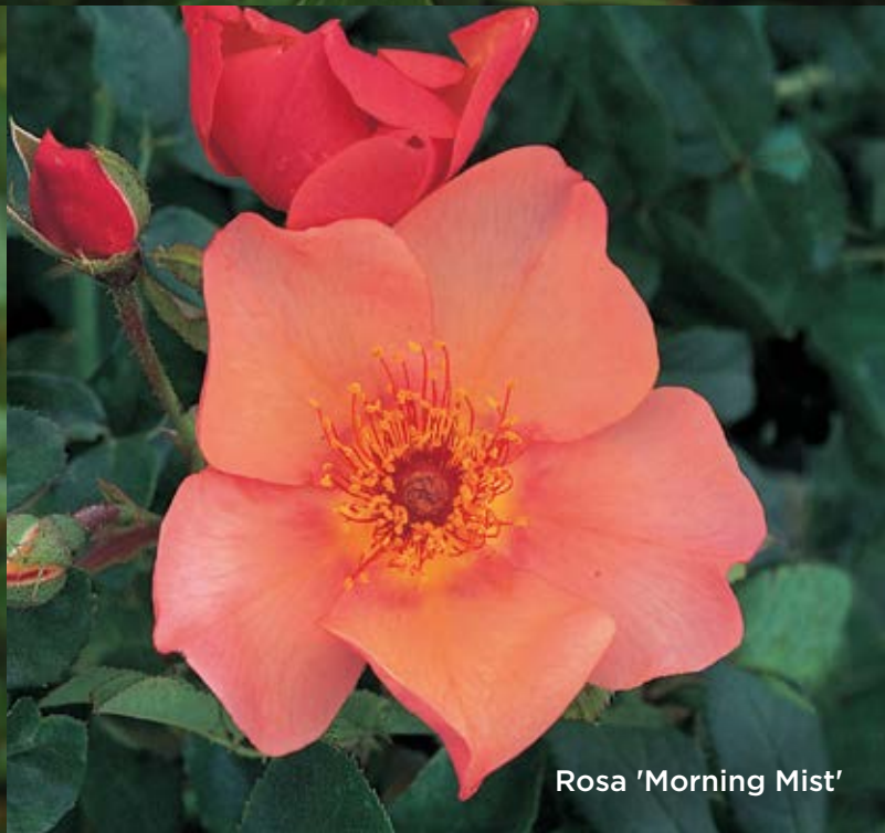
Rosa 'Morning Mist'