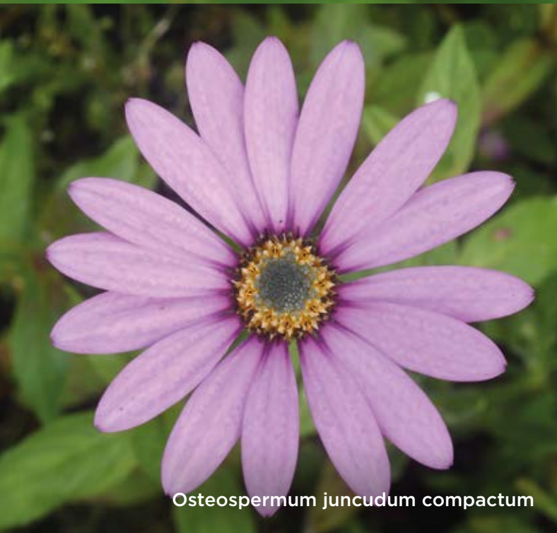
Osteospermum juncudum compactum