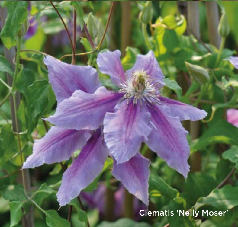
Clematis 'Nelly Moser'