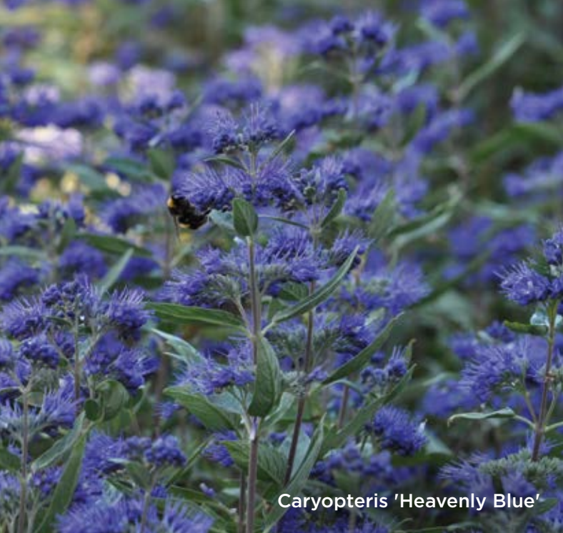
Caryopteris 'Heavenly Blue'