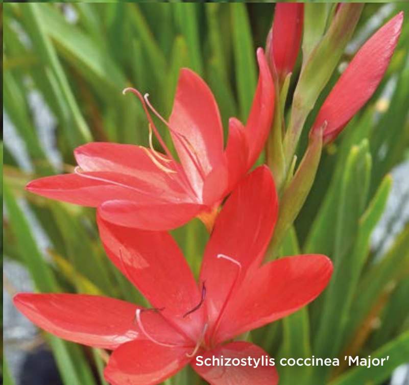
Schizostylis coccinea 'Major'