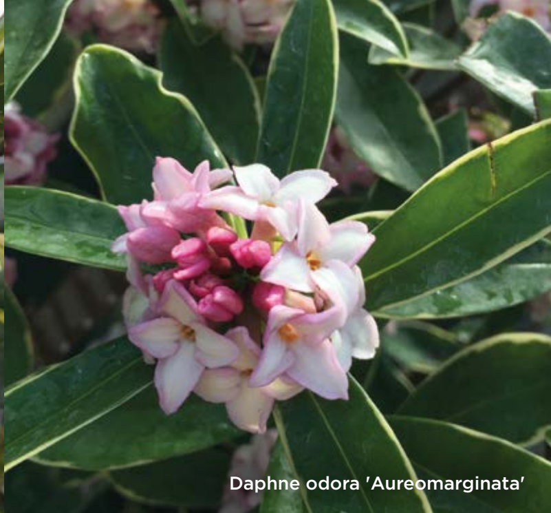
Daphne odora 'Aureomarginata'