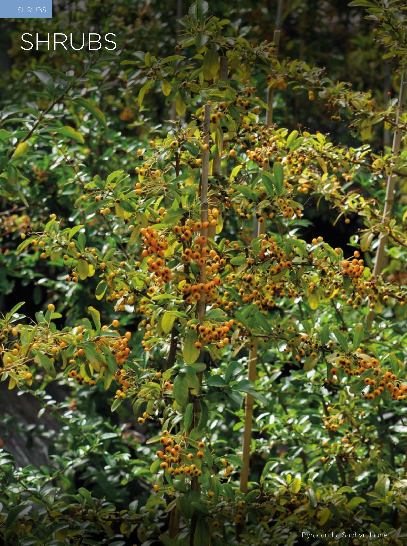
Pyracantha Saphyr Jaune