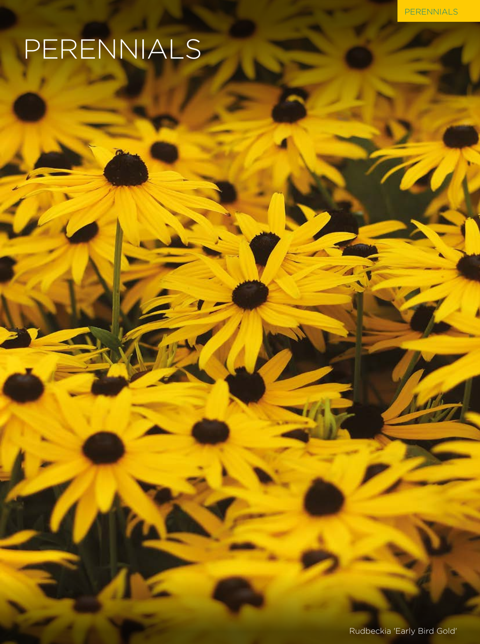
Rudbeckia 'Early Bird Gold'