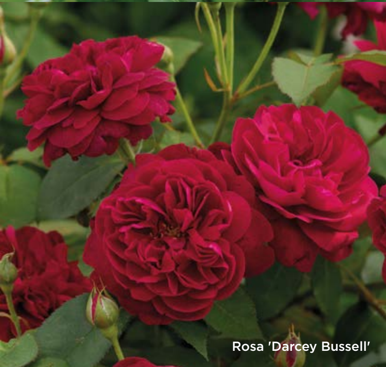
Rosa 'Darcey Bussell'