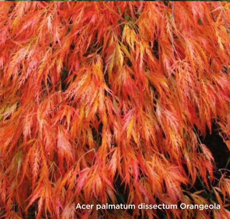
Acer palmatum dissectum Orangeola