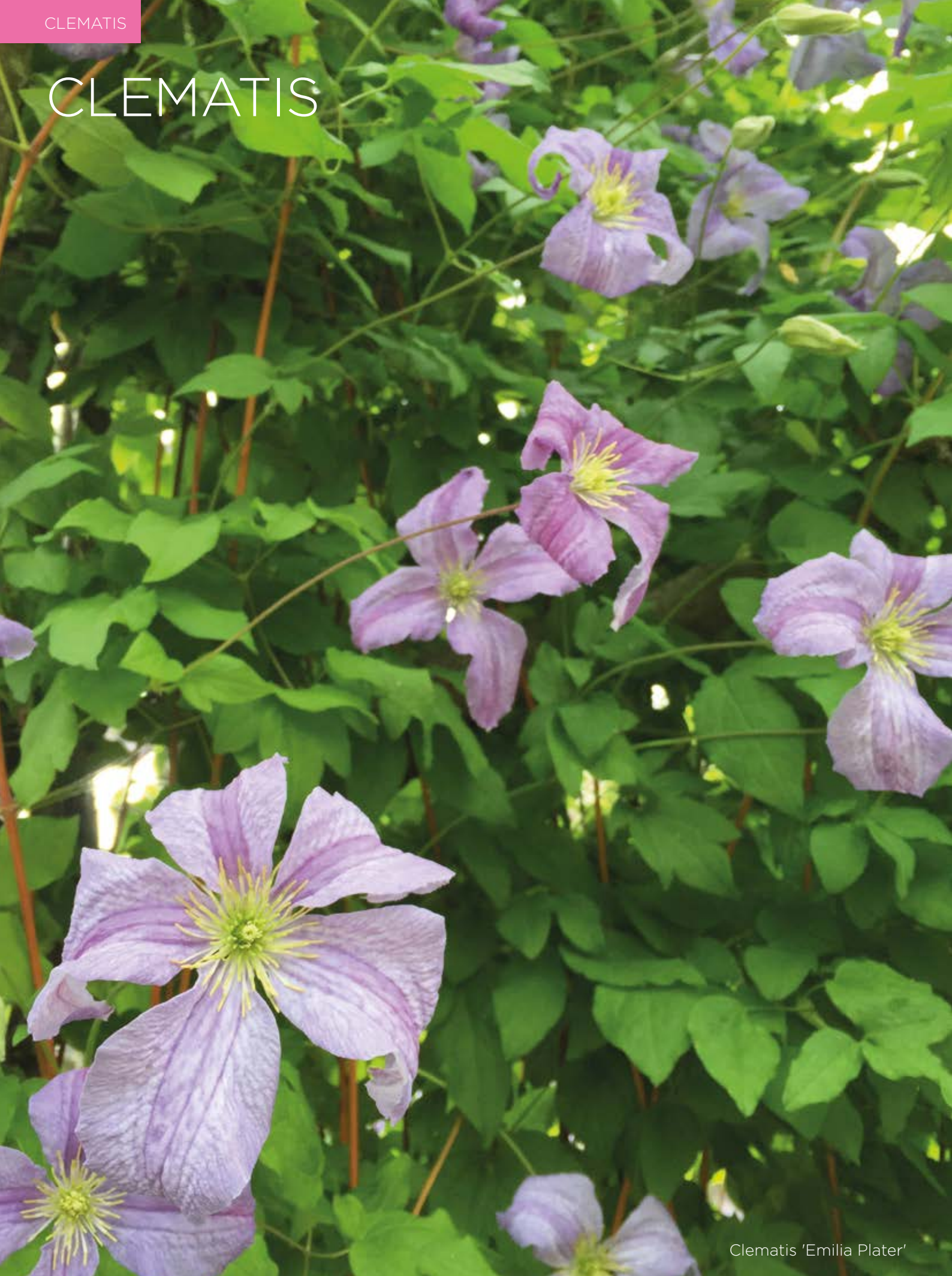
Clematis 'Emilia Plater'