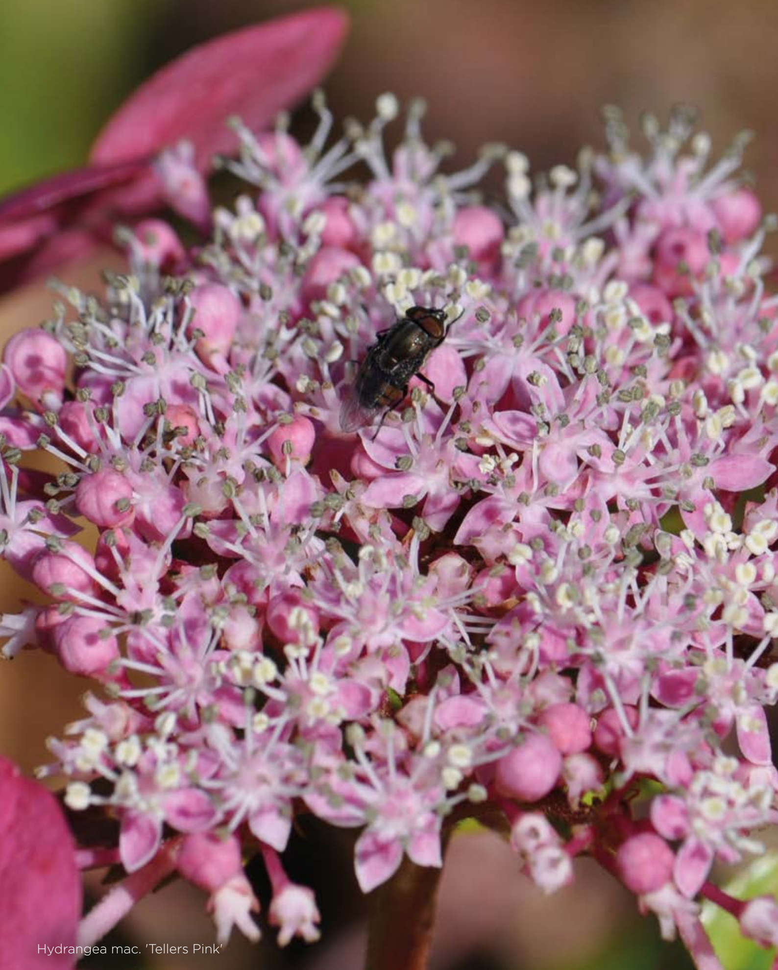
Hydrangea mac. 'Tellers Pink'