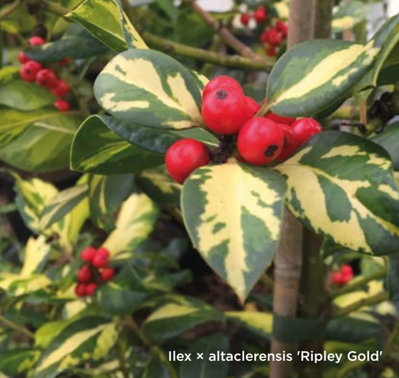
Ilex x altaclerensis 'Ripley Gold'