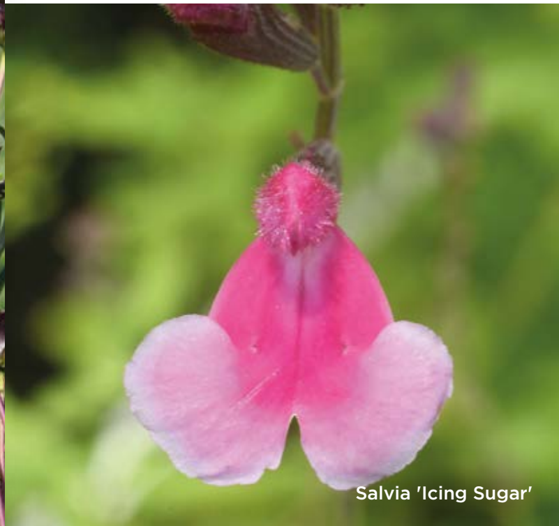
Salvia 'Icing Sugar'