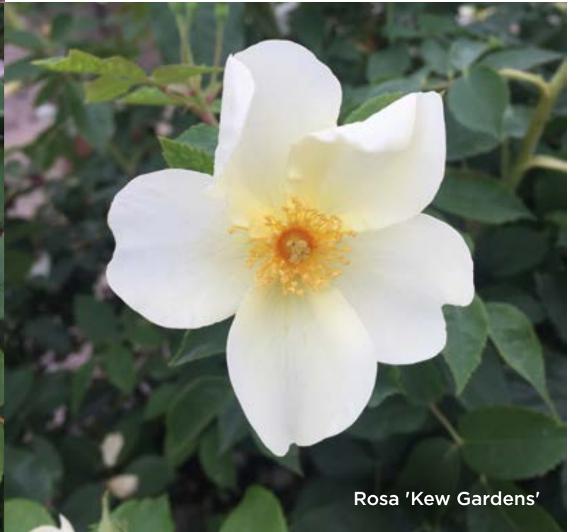
Rosa 'Kew Gardens'