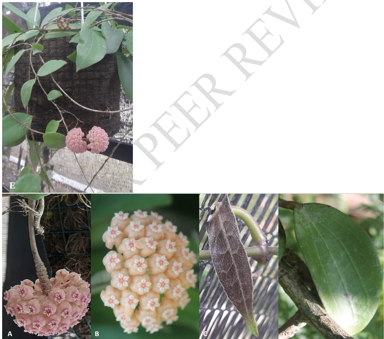
Figure 3. Inflorescence and leaves of Hoya pachyphylla from Ubiyau Village, West Papua (A)