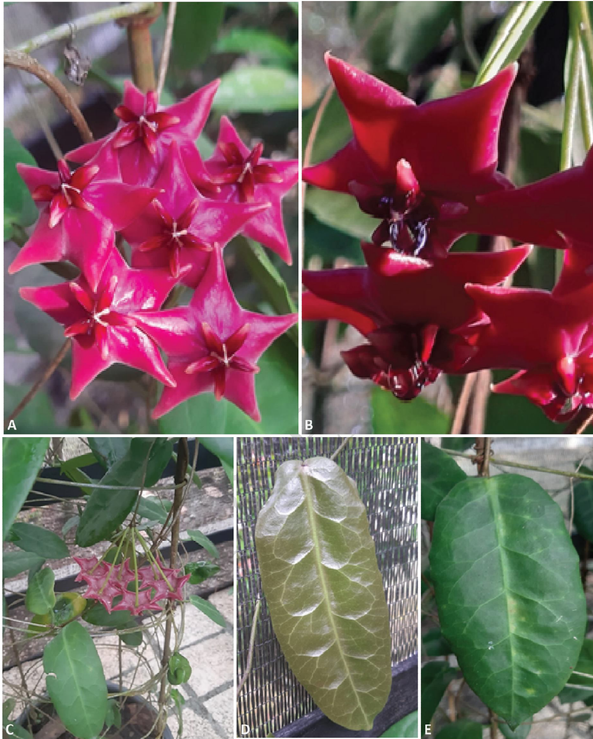
Figure 2. Hoya megalaster collected from Ubiyau forest, West Papua (A) The inflorescence (B) The release of nectar from the flowers in the morning (C) Leaf pairs and inflorescence (D) young leaf (E) mature leaf