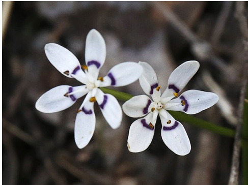
Early Nancy, Wurmbea dioica

Monthly newsletter of the Castlemaine Field Naturalists Club Inc.