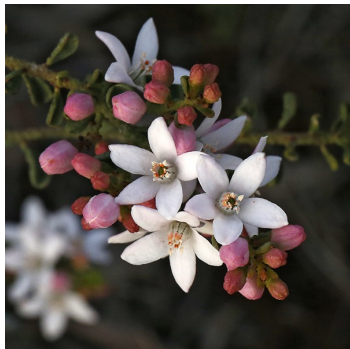
Cyanicula caerulea (top) and Philothea verrucosa