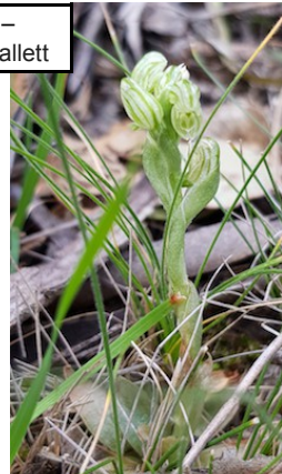
Swan Greenhood