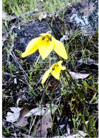
Golden Moth Orchids; unusual in Kalimna Park