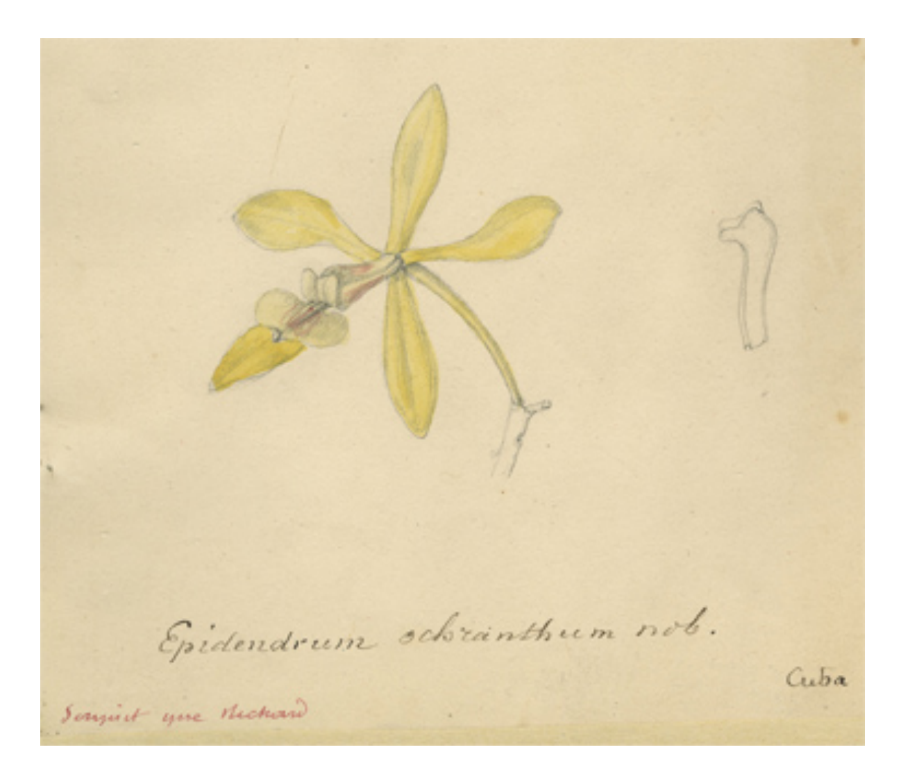
Detail of drawing on TYPE (P) of Encyclia ochrantha (A. Rich.) Withner.