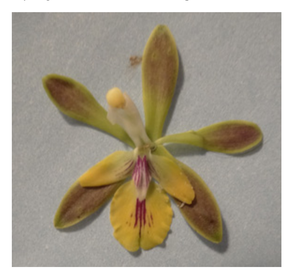
Encyclia bocourtii Muj. Benitez & Pupulin.