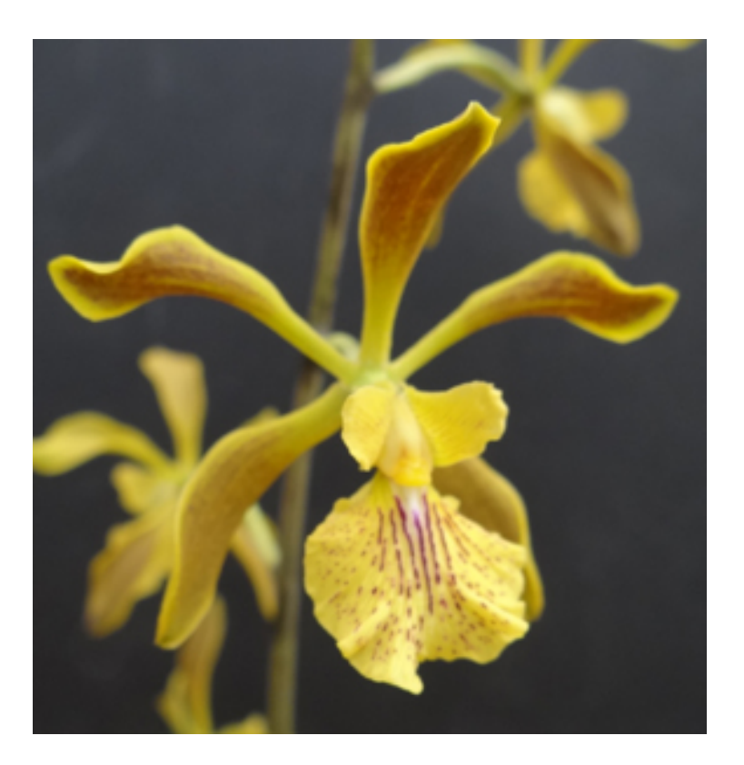
Encyclia guanahacabibensis Sauleda & Esperon.