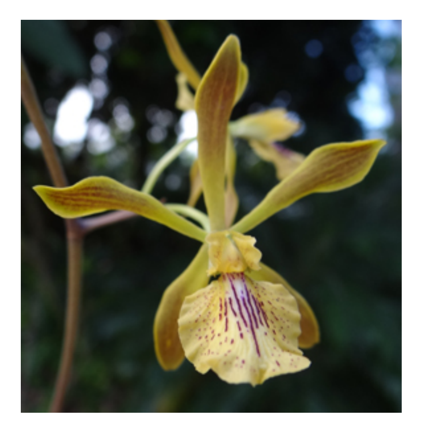
Encyclia guanahacabibensis Sauleda & Esperon.