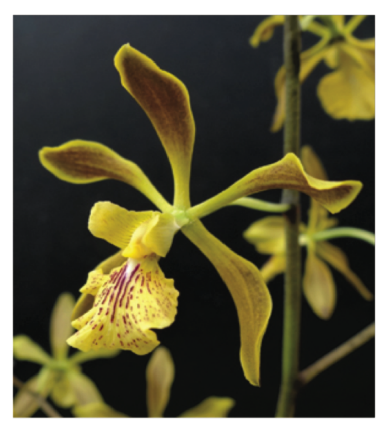
Encyclia guanahacabibensis Sauleda & Esperon.