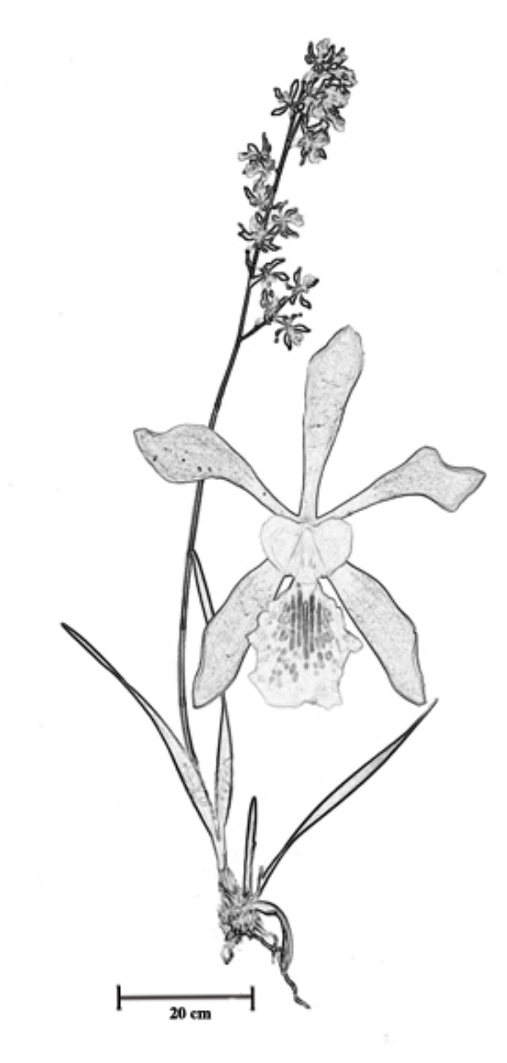
Illustration of Encyclia guanahacabibensis Sauleda & Esperon.