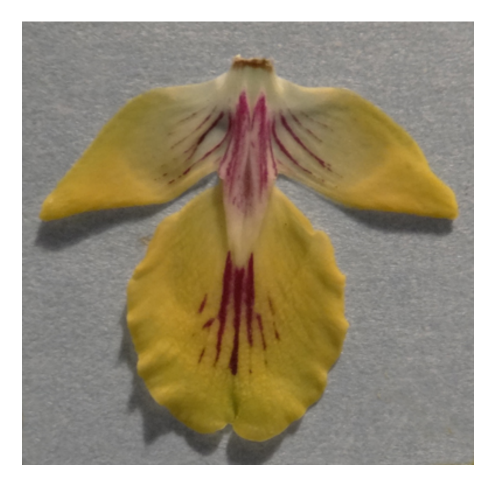
Labellum of Encyclia bocourtii Muj. Benitez & Pupulin demonstrating the smooth mid lobe.