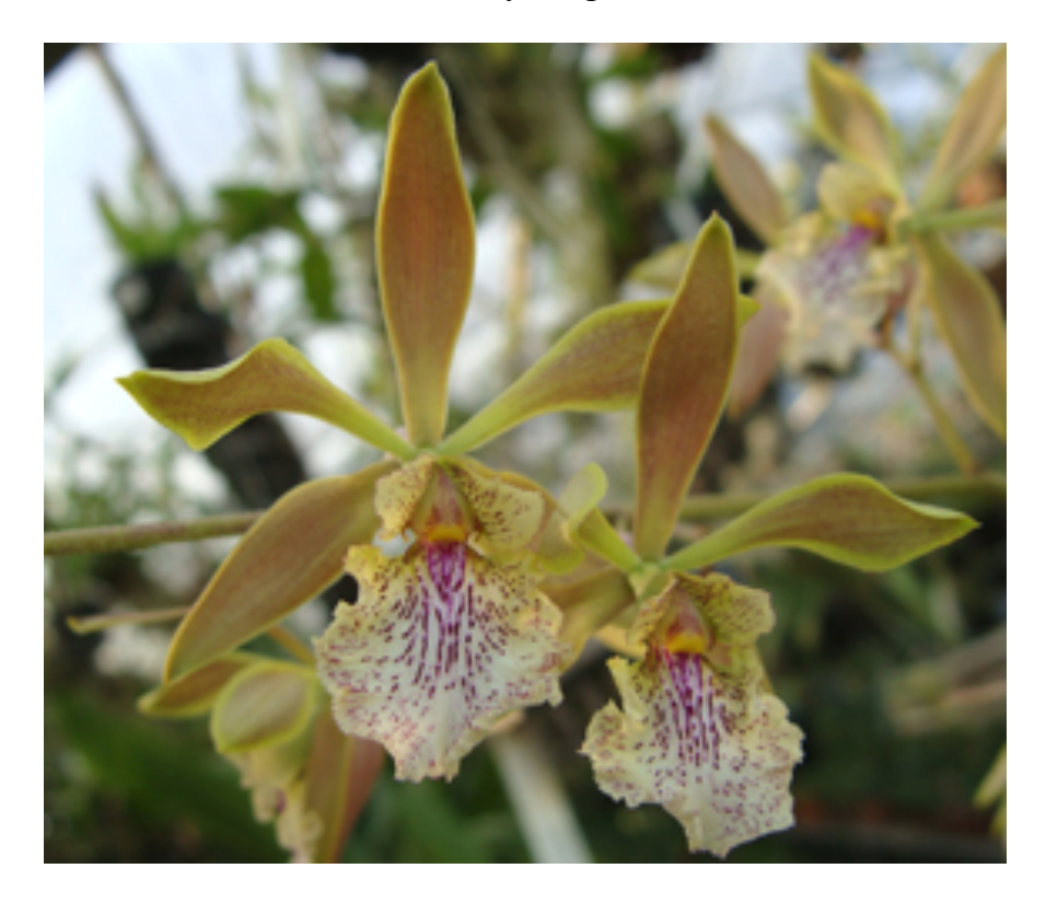
Encyclia ambigua (Lindl.) Schltr.