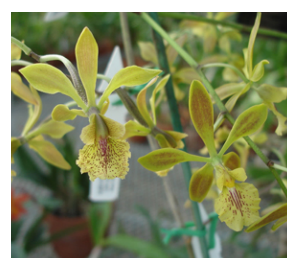
Encyclia ambigua (Lindl.) Schltr. and Encyclia guanahacabiensis Sauleda & Esperon side by side for comparison.