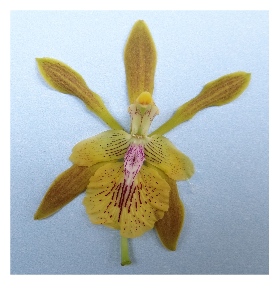
Encyclia guanahacabibensis Sauleda & Esperon