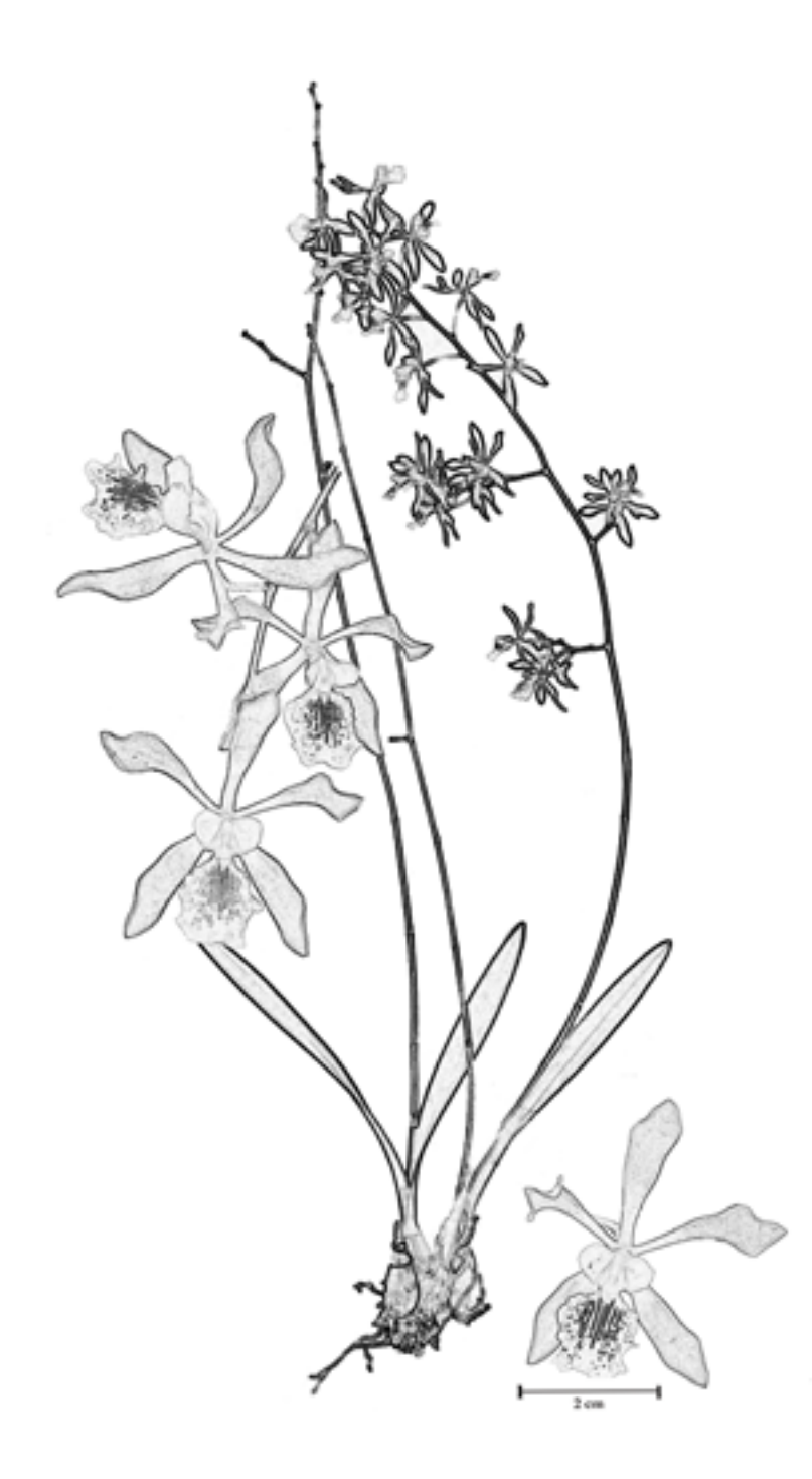
Illustration of Encyclia guanahacabibensis Sauleda & Esperon.