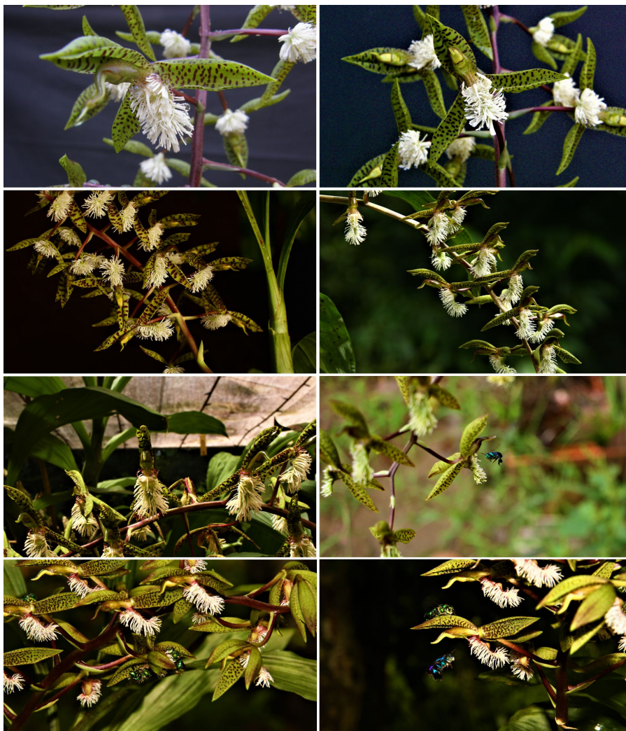
Fig. 3. Morphotypes and floral visitors of Catasetum saracataquense

saracataquense is visited by bee males Euglossa spp. These bees mainly explore the appendages (fimbriae) on the lip surface, probably looking for volatile compounds (Fig. 3).