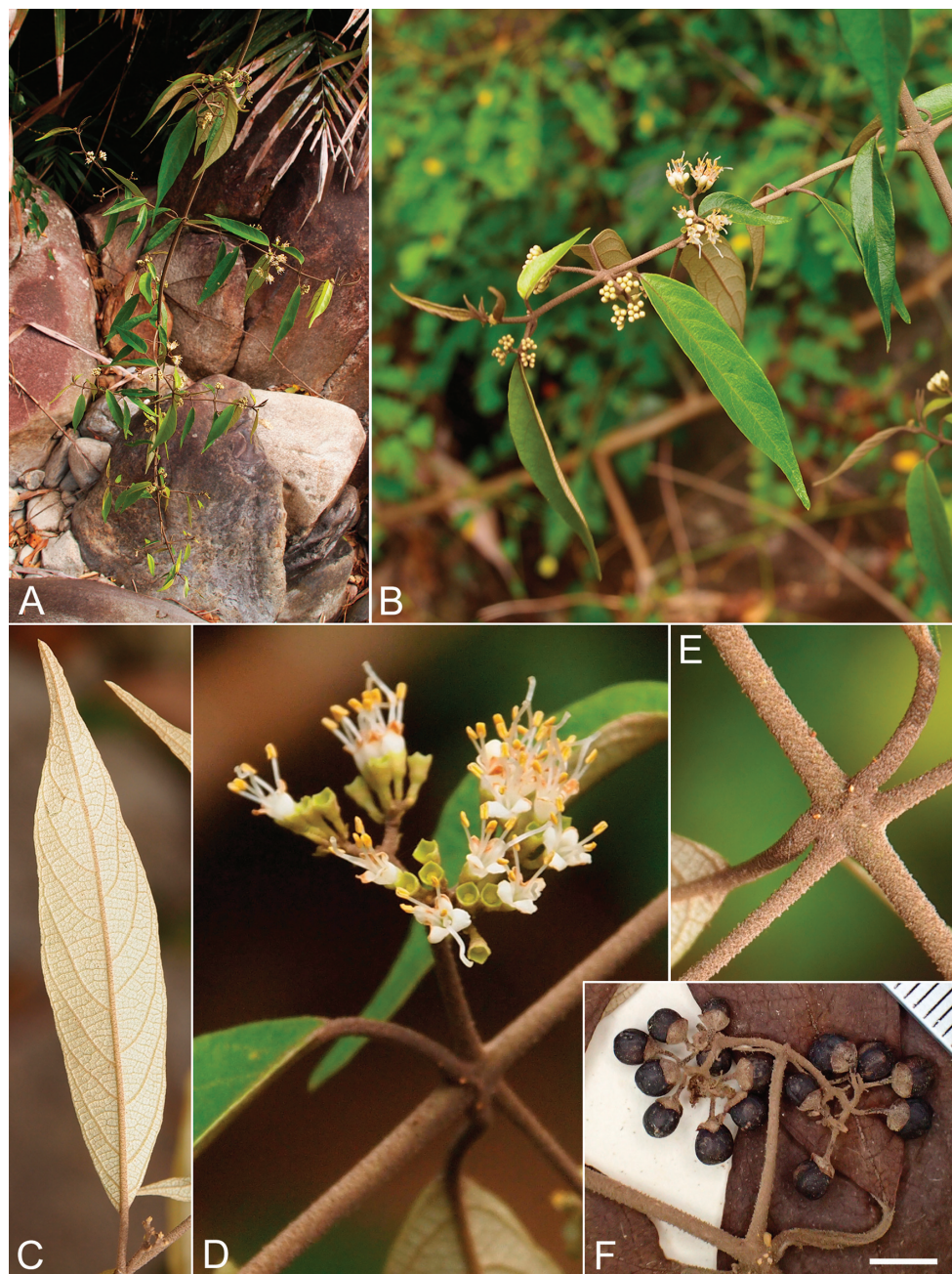
Figure 1. Callicarpa bachmaensis Soejima & Tagane, sp. nov. A Branch apex B Flowering branch C Abaxial surface of lamina D Inflorescences E Twigs and base of petiole, F Infructescence [ Binh & Cuong VN1985 (HN)]. Scale bar E = 5 mm).