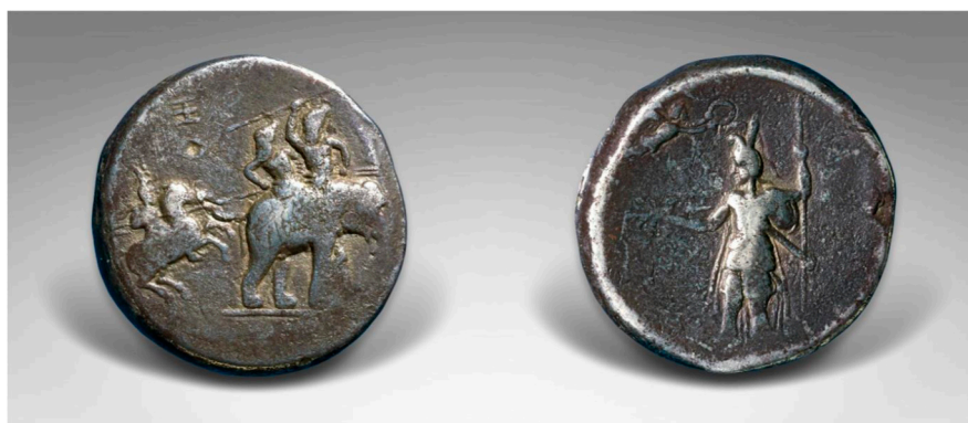
Figure 2. Porus Medallion (BM reg. no. 1926,0402.1); silver; Babylon, Iraq (?), local mint; ca. 324–321 BCE. [Image courtesy of the Trustees of the British Museum, London].

The importance of the elephant for Alexander's eastern campaign is vividly illustrated by 10 surviving examples of large-size silver coins known as the elephant or Porus medallions. 28 The obverse features Alexander on horseback attacking Porus and his mahout on an elephant; the reverse immortalizes Alexander standing with a thunderbolt in one hand and holding a spear in the other as Nike hovers toward him with a wreath (Figure 2). 29 In 1973, an Iraqi hoard (allegedly found in or near Babylon) included not only half a dozen of the 10 examples, but also added two more types: one featuring an archer standing with bow drawn (obv.) and a standing Indian elephant (rev.); the other showing an archer standing in or next to a chariot drawn by four horses (obv.) and two men wearing turbans riding an Indian elephant (Figures 3 and 4). 30 This is not the place to go into details of exact date, mint, and monograms, nor to dwell on the golden modern pastiches of the 1990s. 31 Suffice it here to emphasize the importance of the elephant for Alexander's military victory in India.