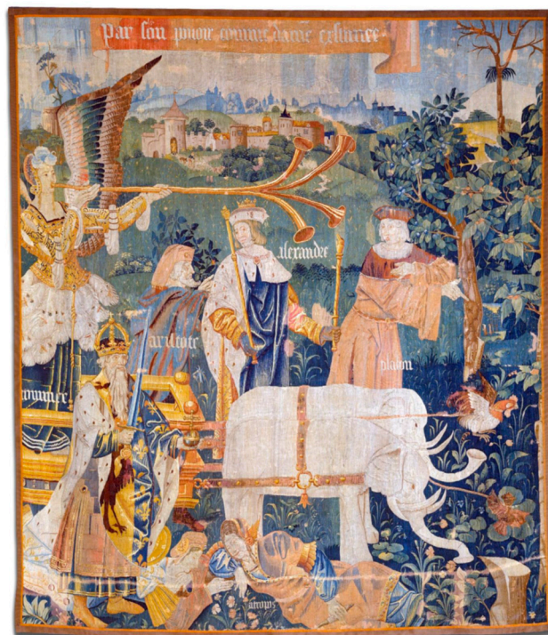
Figure 34. The Triumph of Fame over Death (MMA acc. no. 41.167.2); tapestry; South Netherlandish; ca. 1500–1530.

In the preceding sections, I have endeavored to argue that the elephant in Hellenistic history and art should be understood as a mythic monster and an emblem of military might. Ancient authors regularly affirmed the elephant’s capacity to strike fear in one’s opponents. It has to be emphasized, though, that panic was believed to be divinely inspired. At any rate, there is an obvious association made with victory and power. Nonetheless, neither Darius nor Porus could defeat Alexander the Great, and neither Pyrrhus nor Hannibal could defeat Rome despite their elephant forces; even Ptolemy IV defeated Antiochus III at Raphia, his inferior elephant forces notwithstanding. The elephant’s function to instill terror was thus more symbolic. In that respect, it may well be compared to the aegis and gorgoneum that similarly served the apotropaic function to ward off one’s foes and evil forces generally. The aegis is associated with protection and thus defense. In fact, it might be added here that the ram’s horn was likewise connected with terror and fear, as it could also be considered an attribute of Pan and the satyrs of Dionysus’ retinue.