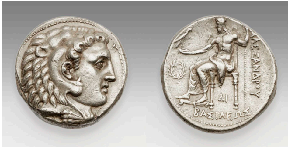
Figure 32. Heracles in Lion Scalp (MFA inv. no. 04.727); silver; Side (?), Asia Minor (mod. Turkey); ca. 326–318 BCE. [Image courtesy of the Museum of Fine Arts, Boston].

Moreover, as Lorber rightly remarks, the elephant's trunk curls up as if raised in prayer to the heavens—just as ancient authors as Pliny, Plutarch, and Aelian observed. 127 The trunk might also have been curved purposely to resemble the uraeus , the upright cobra that was considered the protector of Pharaonic kingship. Furthermore, the exuvia elephantis is worn over the head just as Heracles wore the scalp of the Nemean Lion—an image regularly struck by the royal mint during Alexander's reign and beyond (Figure 32). 128 Heracles, the son of Zeus, to be sure, was considered the forefather of the Temenids and the Argead royal house of Macedon. Like Heracles, Alexander is thus portrayed appropriating a monstrous attribute as an emblem of his victory over a foe, and, so as to bring this discussion back to India, ancient authors such as Megasthenes recognized Heracles in a local Hindu divinity. 129