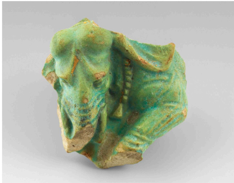
Figure 19. Elephant Head (APM inv. no. 7572); faience; Memphis (?), Egypt; ca. 3rd century BCE.