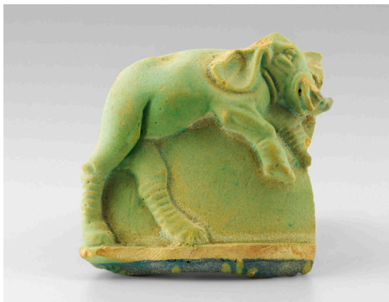
Figure 20. Attacking Elephant (APM inv. no. 7578); faience; Memphis (?), Egypt; ca. 3rd century BCE.

The turreted war elephant, furthermore, is beautifully illustrated on twin decorative gilded silver harness plaques ( phalerae ) said to have been discovered in a grave during Russian excavations in Eastern Iran (Figure 21). 90 In nearly identical but mirrored design they depict an elephant ( Elephas maximus ) wearing a bell on a string around its neck. Atop the animal's neck sits a mahout wearing a turban, with a goad in his hand. From the crenulated turret, which is decorated with croix pattées and upright arrows, emerge two heads, one in profile with a broad-brimmed helmet, the other (nearly) facing with a turban. In addition to their deployment on the battlefield, these phalerae illustrate the persistent association of the elephant with mythic creatures, in this case the hippocampus shown within a border of waves on the saddle cloths on the animal's back.