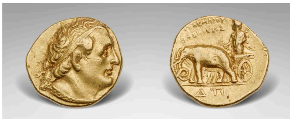
Figure 5. Alexander in Elephant Chariot (MFA acc. no. 11.1754); gold; Alexandria, Egypt; ca. 304–298 BCE.

After his proclamation of kingship, Ptolemy issued his own portrait coinage (ca. 305/4–298 BCE) that featured his head bound by the royal fillet ( diadēma ) and his bust covered by the sacred fleece ( aegis ) on the obverse (Figure 5). 39 Of particular interest here is his choice of reverse image, which shows the deified Alexander holding a scepter and a thunderbolt—as on the Porus medallions—standing in a chariot drawn by four elephants ( quadriga ). The obvious connection between Alexander and Ptolemy's proclaimed kingship is therefore further emphasized by the symbolic association between the elephants and military victory. 40