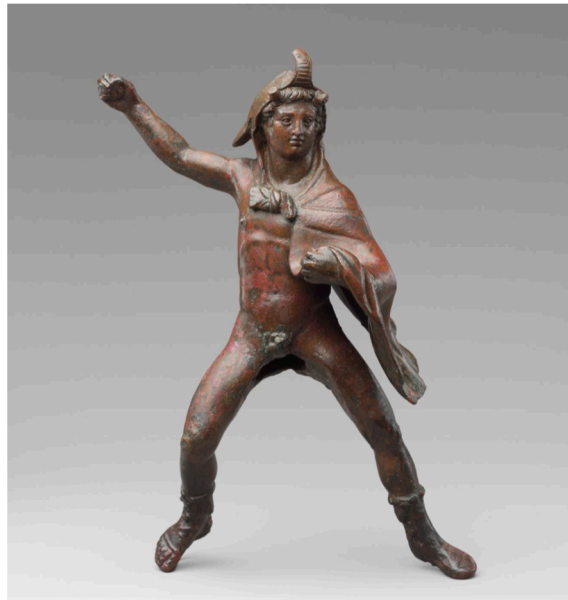
Figure 30. Alexander as Rider (MMA acc. no. 55.11.11); bronze; Athribis (?), Egypt; ca. 3rd century BCE.