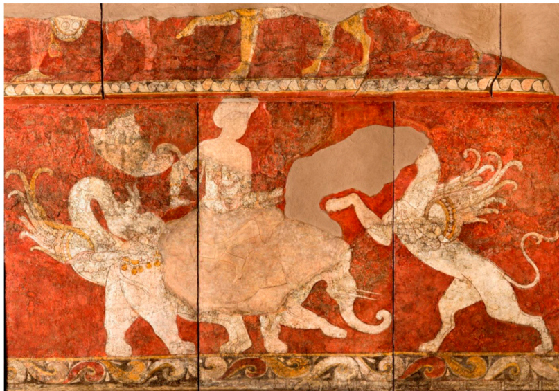
Figure 27. Ahura-Mazda (?) on Elephant (SHM inv. no. SA-14.658–675); mural, Varachsha, Uzbekistan; ca. 720–740 CE.

deliberate effort to represent Ahura Mazda himself, the supreme divinity called Adbag in Zoroastrian Sogdian. 111 It should be stressed that Sogdiana, north of Bactria, across the Oxus River (present-day Amu Darya), was close to the homeland of Zarathustra (Zoroaster). 112