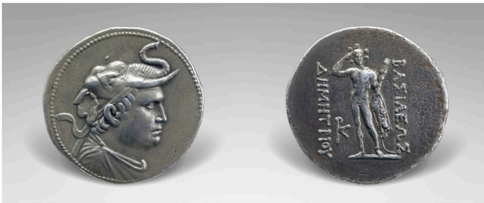
Figure 22. Demetrius I in Elephant Scalp (ANS inv. no. 1995.51.23); silver; Panjshir, Afghanistan; ca. 190–171 BCE.

Farther still to the East, elephants were depicted on many coins and seals from Hellenistic Bactria and India—a practice going back to Harappan stamp seals of the Indus Civilization (Figure 1). For instance, the Greco-Bactrian king Demetrius I (r. ca. 205–171 BCE) is portrayed wearing an exuvia elephantis , diadēma , and chlamys (Macedonian cloak) on the obverse of his silver coins (Figure 22). 91 The elephant scalp, first devised for Alexander the Great on the coinage of Ptolemy I, was thus appropriated in a Greco-Indian context. 92 The reverse depicts a youthful, nude Heracles standing with the lion's skin and his club in his left hand, while placing an ivy wreath on his head with his right hand.