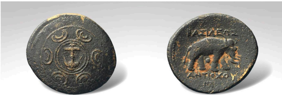
Figure 13. Macedonian Shield and Elephant (APM inv. no. 5147); bronze; Antioch, Syria; ca. 280–261 BCE. [Image courtesy of the Allard Pierson Museum, Amsterdam].