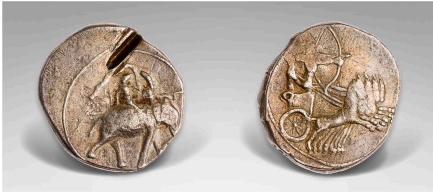
Figure 4. Archer in Chariot Medallion (ANS inv. no. 1995.51.68); silver; Babylon, Iraq (?), local mint; ca. 324–321 BCE.

After Alexander's sudden death in Babylon, his embalmed body was supposed to be returned to Macedon under the supervision of general Arrhidaeus for burial at the old capital Aegae (mod. Vergina). 32 A magnificent carriage was prepared for the funeral cortege. In his description of that carriage, Diodorus mentioned a tablet showing war elephants following the royal bodyguard and added that the elephants carried Indian mahouts; fully-equipped Macedonian troops followed in tow. 33 Although the funerary carriage was eventually hijacked by Ptolemy and Alexander's body transferred to Memphis (321 BCE), the panel again illustrates the importance of the elephant as an expression of Alexander's military might. Through the funeral procession, the elephants also became associated with Hellenistic military processions and later Roman triumphs.