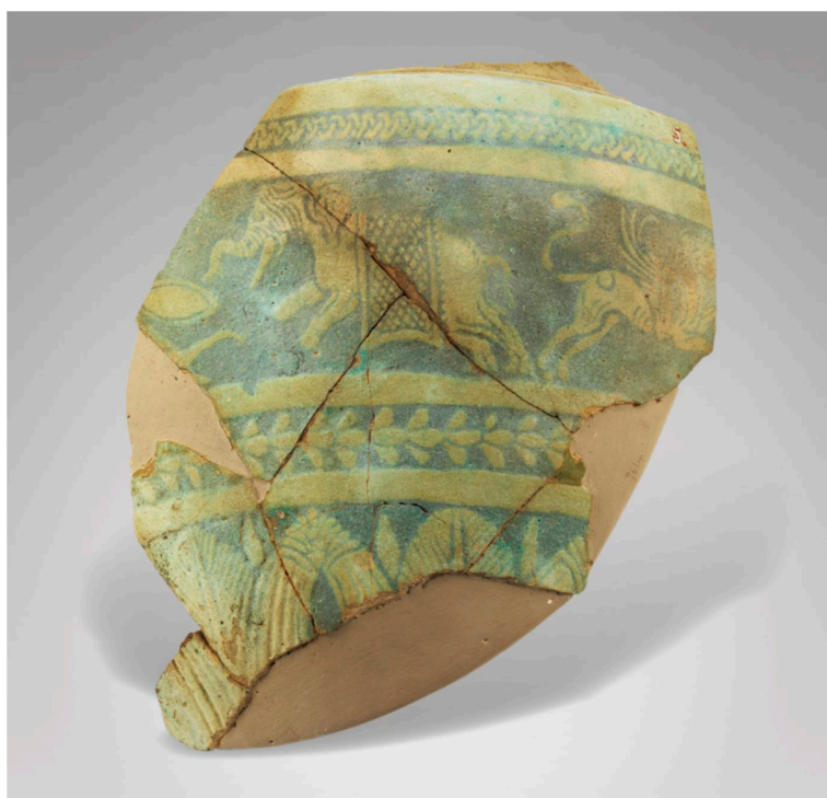
Figure 17. Battle Scene with Elephant and Griffon (APM inv. no. 7614); faience; Memphis (?), Egypt; ca. 3rd century BCE.

decoration (Figures 19 and 20). 89 Moreover, traces of gilding and polychromy indicate that— notwithstanding their small size (and therefore imitations of larger-scale works of art)—these were expensive artefacts fashioned for domestic use among the affluent population of Ptolemaic Memphis and Alexandria, as well as elsewhere in Hellenistic Egypt.