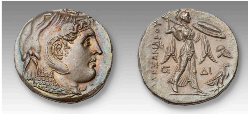
Figure 6. Alexander in Elephant Scalp (MFA acc. no. 20.768); silver; Alexandria, Egypt; ca. 315/300 BCE.

Among the Successors (viz., early 3rd century BCE), sources report some approximate numbers of elephants, including 40 each for Ptolemy and Cassander, an astounding 400 to 500 for Seleucus, and 20 for Pyrrhus—for the most part, these animals disappeared mysteriously from the historical record afterward (post 275 BCE). 45 After the death of Lysimachus at the Battle of Corupedium (280 BCE), Ptolemy Ceraunus (ca. 319/8–279 BCE; the eldest son of Ptolemy with his wife Eurydice) murdered Seleucus to appear as the avenger of Lysimachus. According to Wilhelm Hollstein, Ceraunus continued Lysimachus' portrait coinage featuring Alexander with ram's horn and diadēma (Figure 7). 46 Significantly, the reverse of this very rare gold and silver coinage minted at Lysimachia in Thrace shows Athena Nikephorus with various marks and symbols, including not only a lion's head, but also an elephant (ca. 281/0 BCE). He must thus have obtained some elephants from the Seleucid forces. 47 In fact, he rode on the back of an elephant against the invading Gauls under the command of Belgius. 48 Ceraunus was, however, thrown off his elephant during the battle, captured and beheaded—his head was allegedly carried about on a spear, as Justin added in apparent delight, to strike terror in the enemy (279 BCE). 49