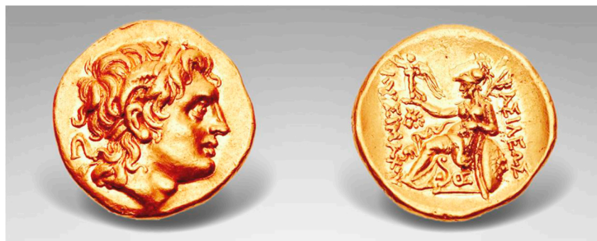
Figure 7. Alexander and Athena Nicephorus (CNG 101, lot 2037); gold; Lysimachia, Thrace (mod. Turkey); ca. 281–280 BCE.

Among the Successors (viz., early 3rd century BCE), sources report some approximate numbers of elephants, including 40 each for Ptolemy and Cassander, an astounding 400 to 500 for Seleucus, and 20 for Pyrrhus—for the most part, these animals disappeared mysteriously from the historical record afterward (post 275 BCE). 45 After the death of Lysimachus at the Battle of Corupedium (280 BCE), Ptolemy Ceraunus (ca. 319/8–279 BCE; the eldest son of Ptolemy with his wife Eurydice) murdered Seleucus to appear as the avenger of Lysimachus. According to Wilhelm Hollstein, Ceraunus continued Lysimachus' portrait coinage featuring Alexander with ram's horn and diadēma (Figure 7). 46 Significantly, the reverse of this very rare gold and silver coinage minted at Lysimachia in Thrace shows Athena Nikephorus with various marks and symbols, including not only a lion's head, but also an elephant (ca. 281/0 BCE). He must thus have obtained some elephants from the Seleucid forces. 47 In fact, he rode on the back of an elephant against the invading Gauls under the command of Belgius. 48 Ceraunus was, however, thrown off his elephant during the battle, captured and beheaded—his head was allegedly carried about on a spear, as Justin added in apparent delight, to strike terror in the enemy (279 BCE). 49