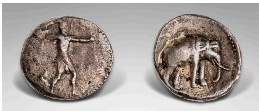
Figure 3. Archer Medallion (ANS inv. no. 1990.1.1); silver; Babylon, Iraq (?), local mint; ca. 324–321 BCE.