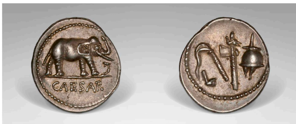
Figure 10. Elephant Trampling Serpent (BM reg. no. R.8822); the reverse features the pontifical emblems of the culullus (sacrificial vessel), aspergillum (lustral implement), apex (priestly cap), and securis (sacrificial axe); silver; Roman empire, traveling mint; ca. 49/48 BCE.

After Octavian (63 BCE–14 CE) annexed Egypt, he had Caesarion—the son of Julius Caesar and Cleopatra VII (69–30 BCE)—killed and brought Cleopatra’s children with Mark Antony (83–30 BCE) to Rome. 65 Their daughter Cleopatra Selene (40–5 BCE) was subsequently married to Juba II (52 BCE–23 CE), who had been restored to his father’s kingdom of Numidia (30 BCE). 66 Juba and Cleopatra were established as rulers of Mauretania when Numidia was turned into a Roman province (25 BCE). One of the most beautiful and intriguing works of Hellenistic art, certainly the most precious artefact among the Boscoreale treasures, is a gilded silver emblemata dish with an allegorical portrait supposed to be of Cleopatra Selene, surrounded by a plethora of religious symbols and attributes within a garland of myrtle berries and laurel leaves (Figure 11). 67 She wears an exuviae elephantis , evincing that the elephant remained a powerful image even in the post-Hellenistic age.