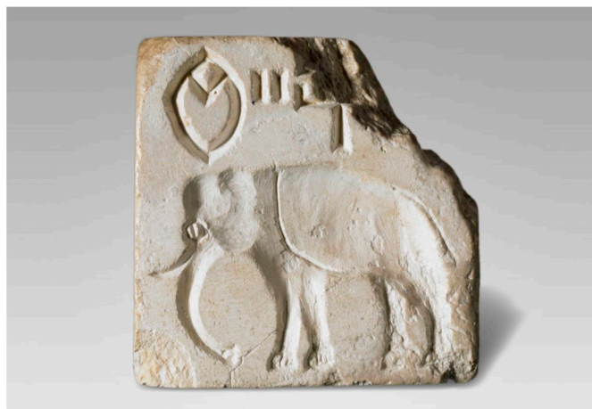
Figure 1. Stamp seal from the Indus Valley (BM reg. no 1947,0416.5); steatite; Mohenjo-daro, Pakistan; ca. 2600–1900 BCE. [Image courtesy of the Trustees of the British Museum, London].

expressed, for instance, on a steatite seal stamp from Mohenjo-daro, Pakistan (Figure 1). 19 After the Battle at Gaugamela, Alexander's general Parmenion captured the elephants from the Persian camp, along with their baggage, chariots, and camels. 20 As the Macedonian army advanced towards Susiana, Abulites, the satrap (provincial governor) of Susa, opened the city gates to Alexander's troops and offered 12 more elephants. 21