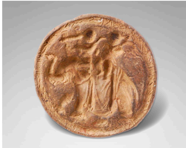
Figure 26. Cupids on Elephant (BM reg. no. 1889,1014.60); terracotta; Bubastis, Egypt; ca. 3rd–2nd century BCE.

A lovely illustration of the religious connotations associated with the elephant might be gleaned from an early Hellenistic terracotta bread-stamp from Bubastis (mod. Tell Basta), now in the British Museum (Figure 26). 106 Within a circular wreath, it shows two winged cupids riding an elephant, its back covered by a draped cloth. The little Eros figure in front sits astride the animal's neck and plays a lyra ( cithara ). The iconography might well be an allusion to a Dionysian procession of the Ptolemaic era such as the Grand Procession of Ptolemy II Philadelphus, which included 24 war chariots drawn by elephants. 107