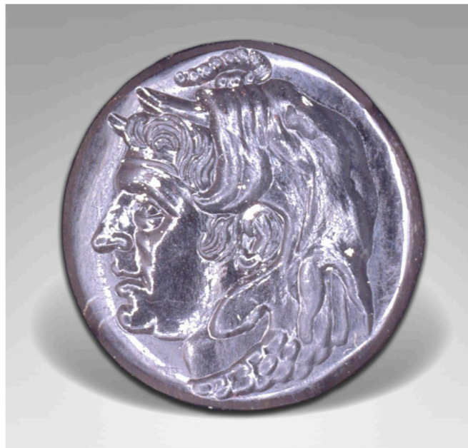
Figure 31. Alexander in Elephant Scalp (BM reg. no. 1866,0804.1); jasper; unknown provenance; ca. 3rd–2nd century BCE.

It bears reiterating that Alexander's posthumous portraiture with the elephant scalp, among other attributes, was first devised under Ptolemy in Egypt (Figure 6). 123 With significant variations, this iconography was adapted by his fellow Successors, specifically Lysimachus and Seleucus (Figure 7). Alexander's facial features on Ptolemy's coinage are full of vigorous pathos, his diadēma signifying his royalty, his large bulging eyes intimating his divinity. The widespread popularity of this imagery is additionally evinced by an engraved semiprecious seal-stone portraying (a Hellenistic ruler in the style of) Alexander with ram's horn, exuvia elephantis , and aegis , very much like the coinage of Ptolemy I (Figure 31). 124 The particular combined attributes of the elephant scalp, the ram's horn, and the sacred fleece remain poorly understood. Catharine Lorber rightly points out that the portrait as a whole makes little sense from a classical Greco-Macedonian perspective. 125 Her suggested Egyptian interpretation I take as a step in the right direction that I would suggest advancing a little further.