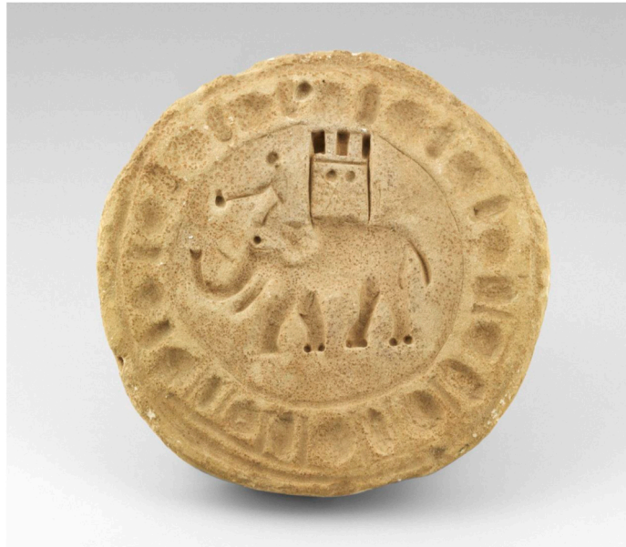
Figure 16. Turreted Elephant (APM inv. no. 7855); limestone; Delta (?), Egypt; late Roman (?).

Regardless of the role of elephants in relation to the fight with the Gauls, the “Galatian Victory” became a trope consciously modeled not only as the Hellenistic equivalent of the historical Graeco-Persian Wars (499–449 BCE), but also as the mythic Amazonomachia and the Gigantomachia . 83 The Pergamon Altar itself is a deliberate imitation of the relief friezes of the Athenian Parthenon. 84 The various statues of wounded, dying, and otherwise defeated Gauls express in sculpture what Callimachus conveyed in hymnic poetry. 85 Among the reliefs of Pergamon, a reused and thus damaged block portrays an elephant head in naturalistic detail. 86 In Hellenistic ideology, reality was influenced by myth, history modeled after legend; if myth can bleed into reality, it is clear that “myth” and “reality” were not mutually exclusive categories.