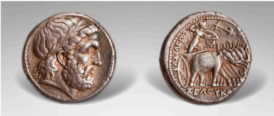
Figure 12. Zeus and Athena (ANS inv. no. 1944.100.44992); silver; Seleucia-on-the-Tigris, Iraq; ca. 296–281 BCE.

(Figure 13). 75 Later, Seleucus II (r. 246–225 BCE) issued bronzes with either his diademed head or the helmeted head of Athena on the obverse, and an elephant with rider on the reverse (Figure 14). 76 Evidently, the elephant was a popular theme in early-Seleucid ideology and iconography.