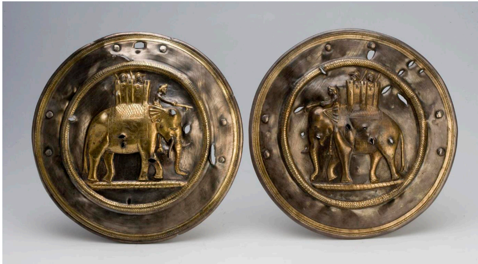
Figure 21. Elephant Phalerae (SHM inv. nos. S-64 and 65); silver; Eastern Iran (?); ca. 3rd–2nd century BCE. [Image courtesy of the State Hermitage Museum, St. Petersburg, Russia].

Farther still to the East, elephants were depicted on many coins and seals from Hellenistic Bactria and India—a practice going back to Harappan stamp seals of the Indus Civilization (Figure 1). For instance, the Greco-Bactrian king Demetrius I (r. ca. 205–171 BCE) is portrayed wearing an exuvia elephantis , diadēma , and chlamys (Macedonian cloak) on the obverse of his silver coins (Figure 22). 91 The elephant scalp, first devised for Alexander the Great on the coinage of Ptolemy I, was thus appropriated in a Greco-Indian context. 92 The reverse depicts a youthful, nude Heracles standing with the lion's skin and his club in his left hand, while placing an ivy wreath on his head with his right hand.