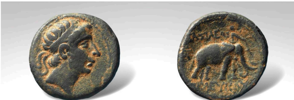
Figure 14. Seleucus II and Elephant (APM inv. no. 5148); bronze; Ecbatana, Iran; ca. 228–226 BCE. [Image courtesy of the Allard Pierson Museum, Amsterdam].