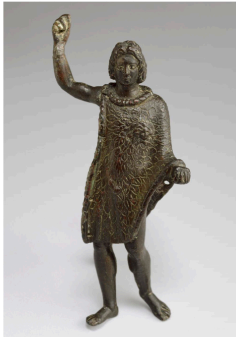
Figure 33. Alexander Aegiochus (WAM acc. no. 54.1075); bronze; Alexandria, Egypt (?); ca. 1st–2nd century BCE.

might even hint to the snakes connected with Alexander's mother Olympias; in one tale, Olympias was accustomed as a bacchant to handle snakes, whereas other legendary tales claimed that she was in fact impregnated by a snake—or rather, Zeus-Ammon or Amun-Ra in serpentine form, or even Pharaoh Nectanebo (Nachthoreb) II (r. 360–343 BCE) in the guise of Ammon (Amun). 146