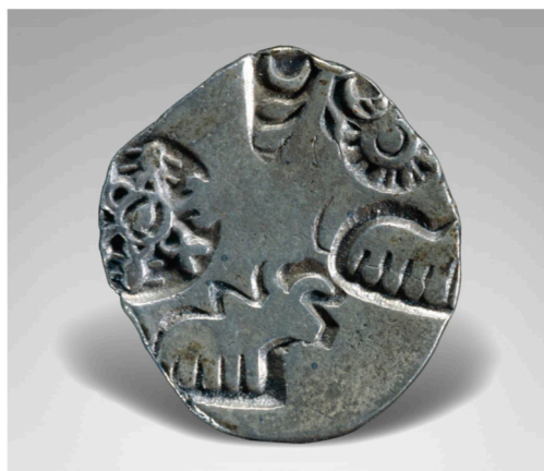
Figure 24. Mauryan Karshapana (BM reg. no. OR.7296), featuring a sacred tree on a hill, the sun, an elephant, a bull, and the chakra (clockwise from the top); silver; Maurya, India; ca. 3rd century BCE. [Image courtesy of the Trustees of the British Museum, London].

In the Mauryan kingdom (ca. 321/0–185 BCE)—established by Chandragupta shortly after Alexander's death and ultimately overtaken by the Shunga dynasty—punch-marked silver coins called karshapana were issued featuring beside an elephant, a bull, a chakra , the sun, and a tree on a hill (Figure 24). 95 To be sure, all five images refer to esoteric Hindu and Buddhist symbols: the bull, of course, has been held sacred in South Asia since the Harappan civilization; the tree represents the ficus religiosa ("sacred fig") of Hindu and Buddhist worship; sūrya , the divine sun, was already revered in the Vedic hymns; and the chakra (lit. "disc"; cognate with "cycle") is a Tantric nerve nexus. The combination of these symbols thus intimates the sacred status of the elephant in the Indus valley at the onset of the Hellenistic period.