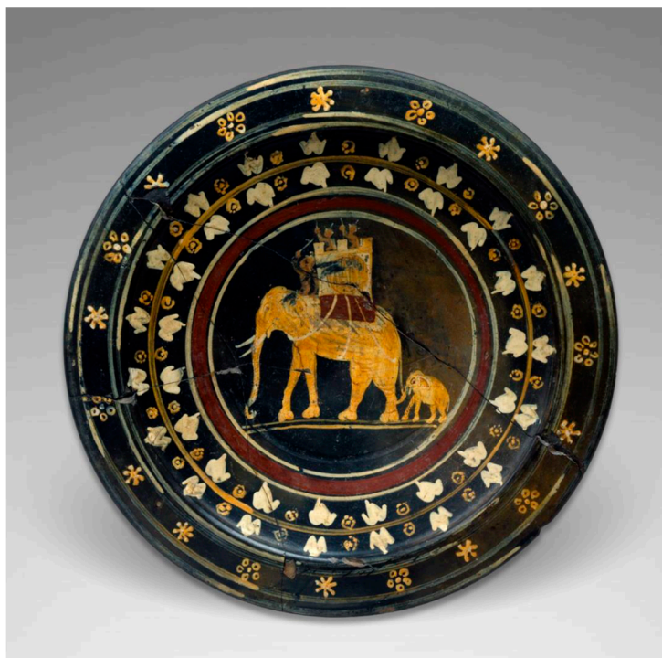
Figure 8. Elephant plate (MNE inv. no. 23.949); ceramic; Capena, Italy; ca. 275–270 BCE.

When Pyrrhus of Epirus (319–272 BCE) set out on his Italian campaign (280–275 BCE), he took with him 20 elephants. 50 It remains unclear whether he had captured the animals from Antigonus' son Demetrius, or had received them either from Lysimachus or Ceraunus. 51 Pyrrhus had earlier requested support from Ptolemy II (308–246 BCE), who could then still afford to promise 5000 infantry, 4000 cavalry, and 50 elephants. 52 (Pyrrhus and Ptolemy II were related through the former's marriage to Antigone, a daughter of the latter's mother Berenice from her first husband, before she married Ptolemy I.) Despite his elephant force, Pyrrhus was unable to effect a decisive victory and was eventually defeated at Beneventum (274 BCE) by the Roman troops under consul Manius Curius Dentatus. Various ancient sources report that a calf and its mother caused great confusion among Pyrrhus' ranks, which gave the Romans the upper hand in the battle. 53 Dentatus was able to capture four elephants—the first elephants ever seen in Rome—which he exhibited as his most magnificent triumph. 54 A ceramic plate from Capena (dated ca. 275–270 BCE), now at the “Villa Giulia” in Rome, illustrating a turreted elephant with a rider and two fighters, followed by an elephant calf, appears to commemorate the Roman victory over Pyrrhus (Figure 8). 55