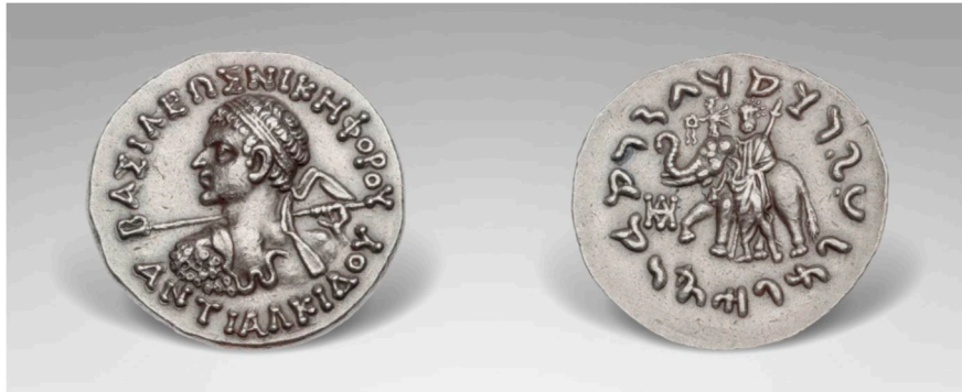
Figure 23. Antialcidas and Krishna (?) with Elephant (MFA inv. no. 47.128); silver; Taxila, Pakistan; ca. 115–95 BCE. [Image courtesy of the Museum of Fine Arts, Boston].

hand, the shoulders frontal from the back draped with an aegis (Figure 23). 94 The bilingual coins record the king's name and epithet, Nikephorus ("Bearing Victory"), in both Greek and Prakrit. The reverse shows a standing deity, dressed in a heavily pleated garment, his head radiate, holding a scepter in his left hand; behind him stands an Indian elephant facing left with a raised trunk and a bell hanging around its neck; a small figurine of Nike stands on the animal's head, holding a wreath in her outstretched right hand. The identity of the radiate deity is unclear, but might be understood as Krishna.