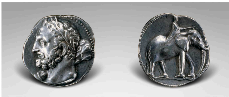
Figure 9. Hannibal as Melqart (BM reg. no. 1911,0702.1); silver; Mogente, Spain; ca. 237–209 BCE. [Image courtesy of the Trustees of the British Museum, London].

Numidians). 56 When Hannibal (247–ca. 182 BCE), crossed the Pyrenees from the Iberian peninsula with 50,000 infantry and 9000 cavalry, his forces also included 37 war elephants. In his crossing of the Alps a month later, he suffered heavy losses. While the sources indicate that Hannibal reached the Po Valley with 20,000 infantry and 6000 cavalry, the number of surviving elephants remains unstated. He nevertheless crushingly defeated the Roman consular armies at the Battle of the Trebia (ca. December 218/January 217 BCE), in which he employed an (again) unspecified number of elephants among the cavalry on both wings. How many survived is (once more) unclear, but Livy reports that seven elephants perished in a winter storm. 57 Although reinforcements including elephants did eventually reach Hannibal, like Pyrrhus, he was unable to effect a decisive victory over the Roman forces, even at the final battle at Zama (202 BCE). Still, the ideological importance of elephants for Carthage was powerfully expressed on a series of coins. For instance, on Punic silver shekels from Spain, the portrait of a bearded Hannibal in the guise of a wreathed Melqart with a club over his shoulder graces the obverse, while the reverse features an African forest elephant with a cloaked rider holding a goad in hand on its back (Figure 9). 58 Notice the absence of the turret, which could only be used on Asian elephants ( Elephas maximus ). 59