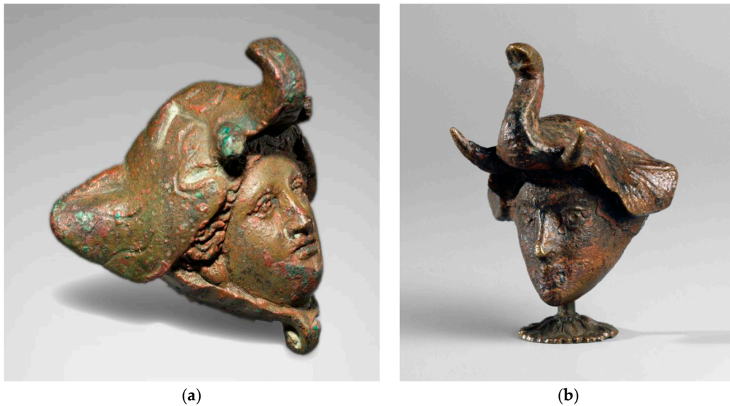
Figure 29. (a) Alexander in Elephant-Scalp (Bonhams, London, 25 April 2012, lot 43); bronze; unknown provenance; ca. 3rd century BCE. [Image taken from bonhams.com]. (b) Alexander in Elephant-Scalp (SHM inv. no. GR-27.178); bronze; unknown provenance; ca. 2nd–1st century BCE. [Image courtesy of the State Hermitage Museum, St. Petersburg].

based on large-scale marble or other stone sculptures depicting Alexander in combat, perhaps on horseback or even riding an elephant. For instance, a figure of a rider—whose animal is now missing—wearing an elephant scalp as headdress, said to be from Athribis, Egypt (ca. 3rd century BCE), is now at the Metropolitan Museum of Art in New York (Figure 30). 122