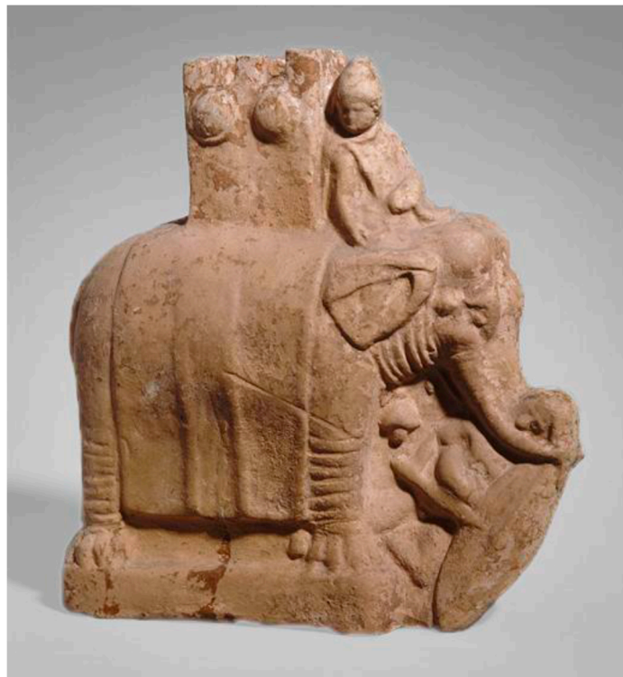
Figure 15. Elephant Trampling Gaul (Louvre inv. no. Myr. 284); terracotta; Myrina, Asia Minor (mod. Turkey); ca. 3rd century BCE. [Image courtesy of the Louvre Museum, Paris].

According to Appian (fl. ca. 140–150 CE), Antiochus I owed his cult epithet Sōtēr (“Savior”) to driving out the Galatians. 77 These Gallic tribes had crossed the Balkans and—after the successive deaths of Lysimachus, Seleucus, and Ceraunus (280–279 BCE)—moved from Europe into Asia Minor. The satirical rhetorician Lucian of Samosata (ca. 125–post 180 CE), relates that Antiochus’ 16 elephants instilled panic among Galatians, who supposedly had never seen the animal before (despite the battle against Ceraunus). 78 They caused such great carnage that Antiochus was able to claim a decisive victory although greatly outnumbered. In gratitude, he supposedly engraved a trophy only with the image of an elephant. While Altay Coşkun has rightly questioned the accuracy of this “Elephant Victory”, 79 there is no reason to doubt the historicity of the Seleucid king’s engagement against the invading Galatians, and that Antiochus deployed war elephants in the battle (ca. 275/4 BCE). 80 The importance of the elephant for the war against the Gauls is borne out visibly by terracotta figurines, such as that found in a grave at Myrina (Figure 15). 81 It shows a decked-out war elephant with a rider and a wooden turret with metal shields charging a Gaul—recognizable by his Celtic shield. A similar imagery on a limestone cake- or bread-stamp, without the enemy, suitably illustrates the enduring popularity of the turreted-elephant theme (Figure 16). 82