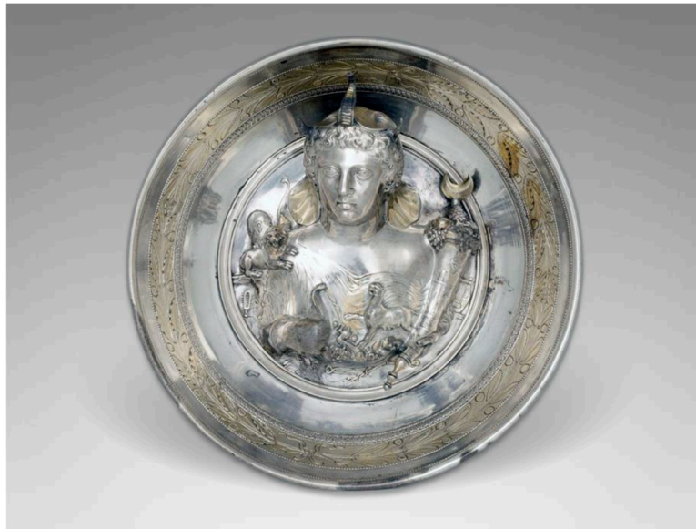
Figure 11. Cleopatra Selene (Louvre inv. no. Bj 1969); silver; Boscoreale, Italy; ca. 25 BCE–25 CE.

Much earlier, at the end of the Fourth Syrian War (219–217 BCE), Ptolemy IV (244–204 BCE) had defeated Antiochus III (ca. 241–187 BCE) at the Battle of Raphia (22 June 217). 68 The Seleucid infantry numbered about 70,000 opposite 62,000 Ptolemaic infantry, and while Antiochus is said to have deployed over 100 war elephants, Ptolemy is said to have fielded just under 75. 69 Moreover, this was perhaps the only ancient battle in which African elephants fought against Asian. 70 Even though Ptolemy's smaller elephants panicked at the sight of Antiochus' larger pachyderms, the Egyptian phalanx ultimately effected a decisive victory.