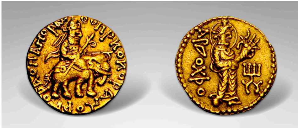
Figure 25. Huvishka and Ardochsho (ANS inv. no. 1948.34.1); gold; Peshawar, Pakistan; ca. 151–190 CE.

If I could beg for the reader's patience, one last example may suffice to illustrate the elephant's lasting importance in the Indian subcontinent well into the common era. The elephant continued to be depicted frequently on coinage of the Kushan Empire (1st–4th century CE). King Huvishka (r. 151–190 CE), for instance, issued gold coins on which he is shown riding an elephant, holding a scepter and goad; the reverse depicts the goddess Ardochsho, standing in a heavily pleated dress, her head surrounded by a nimbus, holding an overflowing cornucopia in her left hand (Figure 25). 96 The goddess, identified by the legend in Kushan-Greek script (Αρχδοχφο), was an Avestan deity of good fortune who—by the attribute in her hand—was equated with the Greek Agathe Tyche, the Roman Fortuna, and the Gandhara-Buddhist Hariti. 97