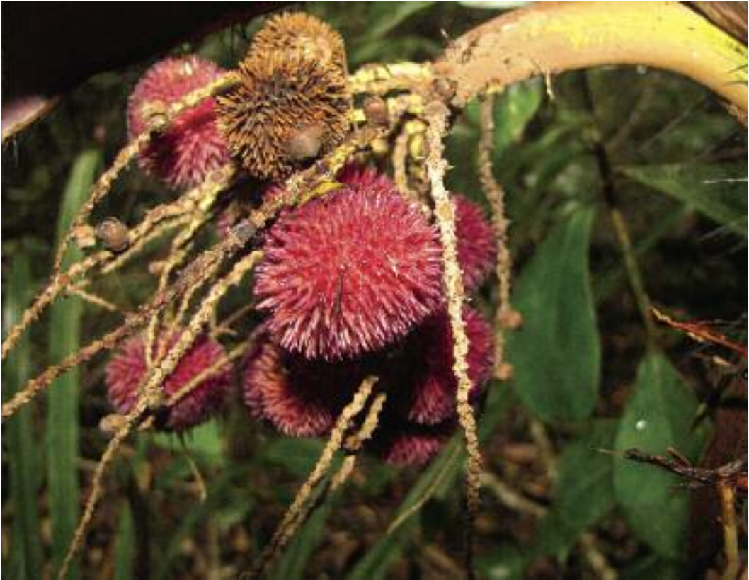
9. The red, spiky fruits of Bactris constanciae .