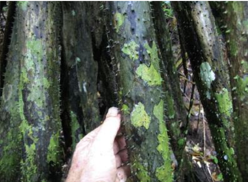
2. The spines on the stilt roots of Socratea exorrhiza .

Piste means track or road and there are many roads that say that they go to places that they do not, and the Piste de St. Elie does not go to