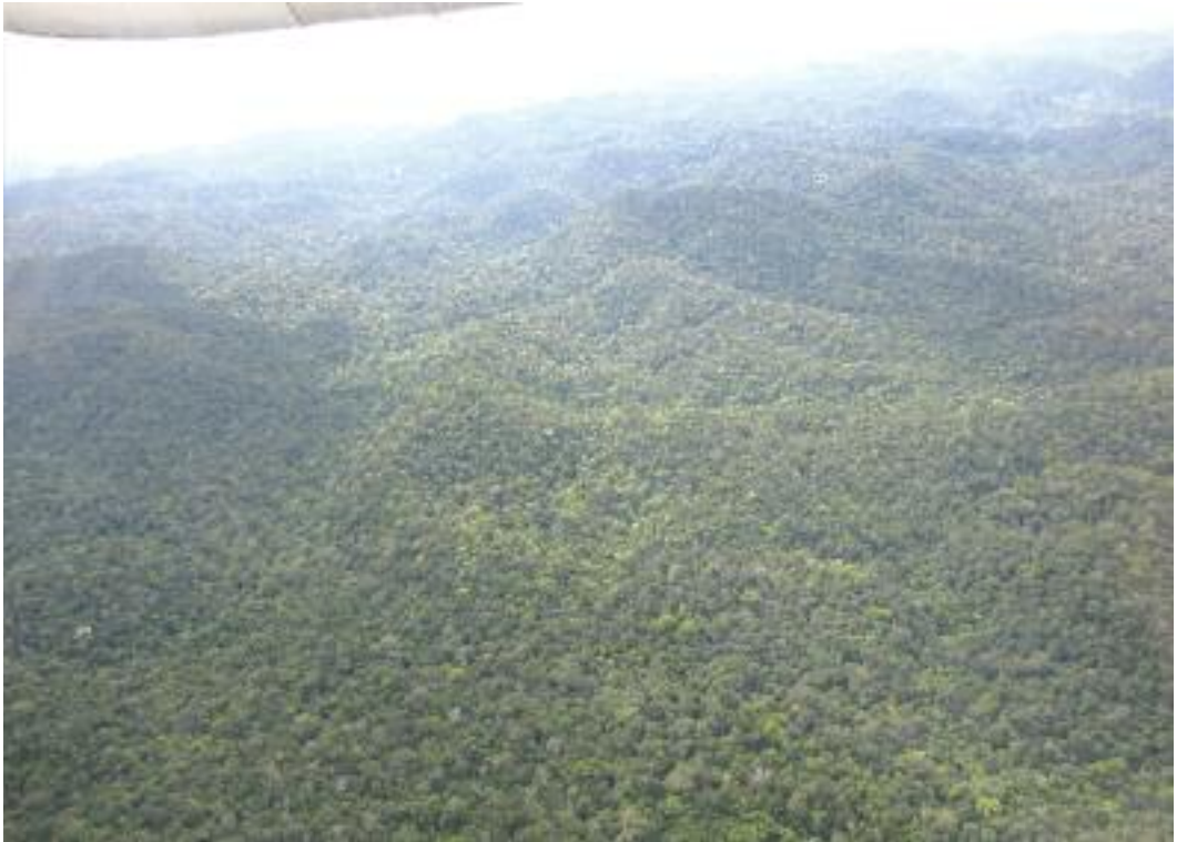
1. The vast, undisturbed rain forests of central French Guiana near Saül.

Since on this trip most of my collecting was done near the coast, I encountered only a few of the several Geonoma species found in French Guiana, such as G. stricta , G. baculifera and G. oldemanii . Many smaller Bactris species commonly fill the Geonoma niche in the forest understory, such as Bactris aubletiana , B. gastoniana and B. simplicifrons .