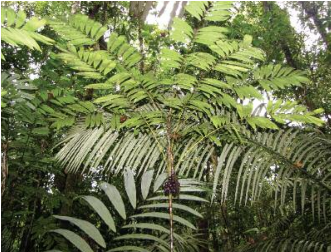
6 (top). Asterogyne guianensis growing in habitat in a swampy depression. 7 (bottom). The elegant leaves and fruits of Bactris elegans .