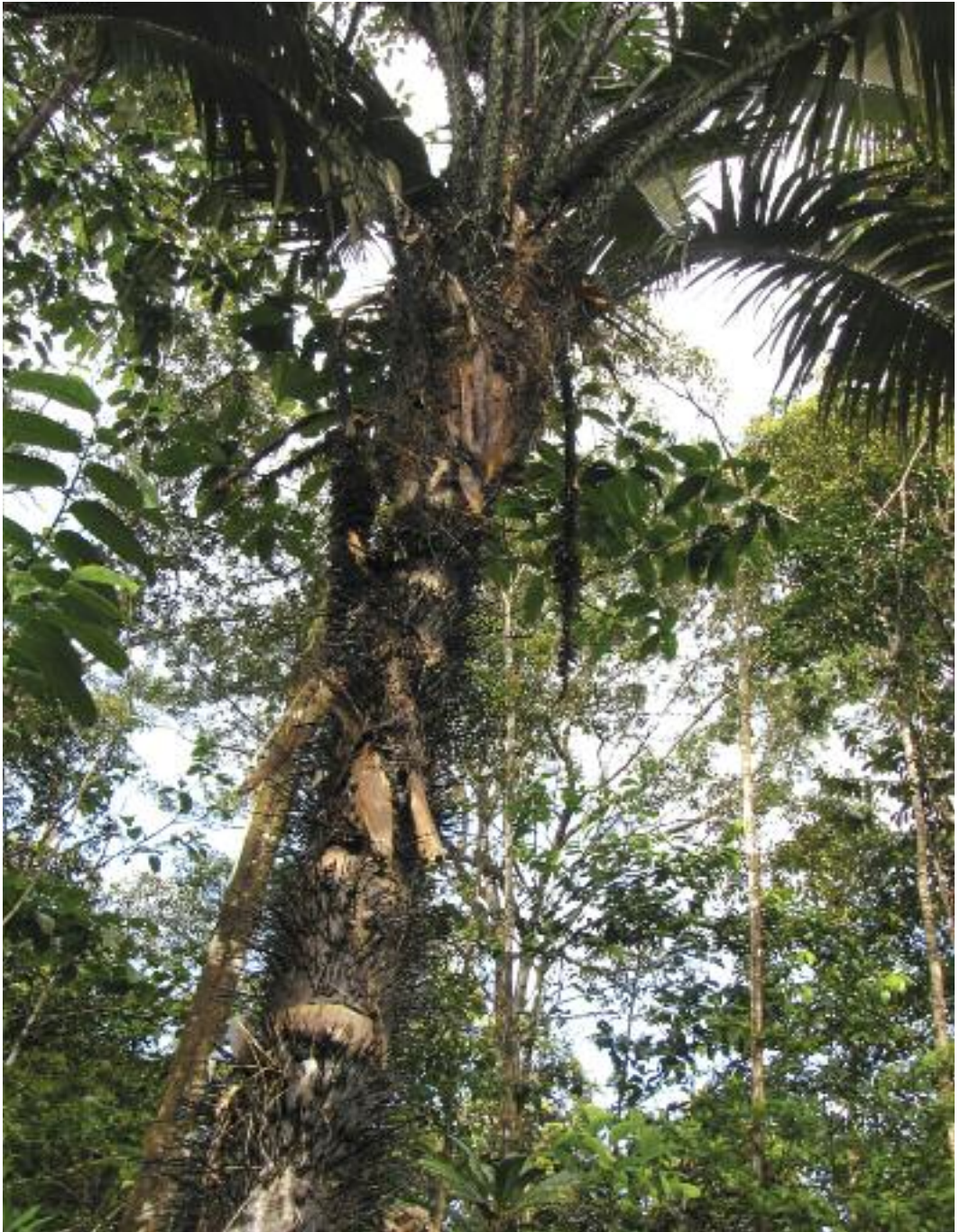
13. The fast-growing and horribly spiny Astrocaryum rodriguesii .

muddy. All terrain vehicles (ATVs) are apparently the vehicle of choice, as we saw several people using them to meet family members at the airstrip. ATVs are indeed the most practical way of getting around Saül, and I thought that it would be the only vehicle we would see. However, as we waited at the airstrip, we were met by a bright red pickup truck, one of the few non-ATVs in town. This