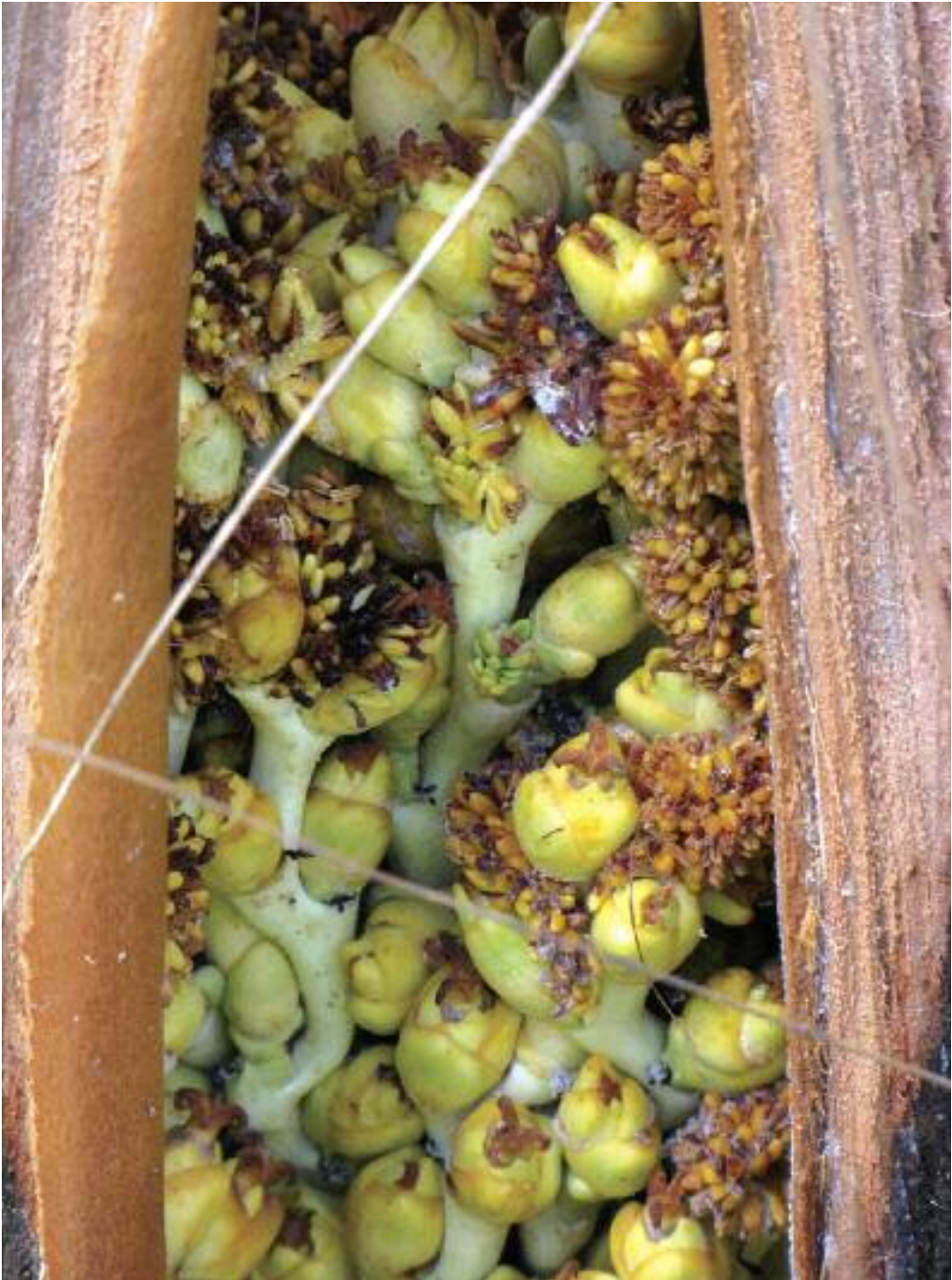
12. Female inflorescence of an acaulescent Attalea ( Scheelea ) with small (<3 mm) male flowers.

etc. After spending some time exploring the inselberg, we all returned to the cars soaked in rain and sweat.