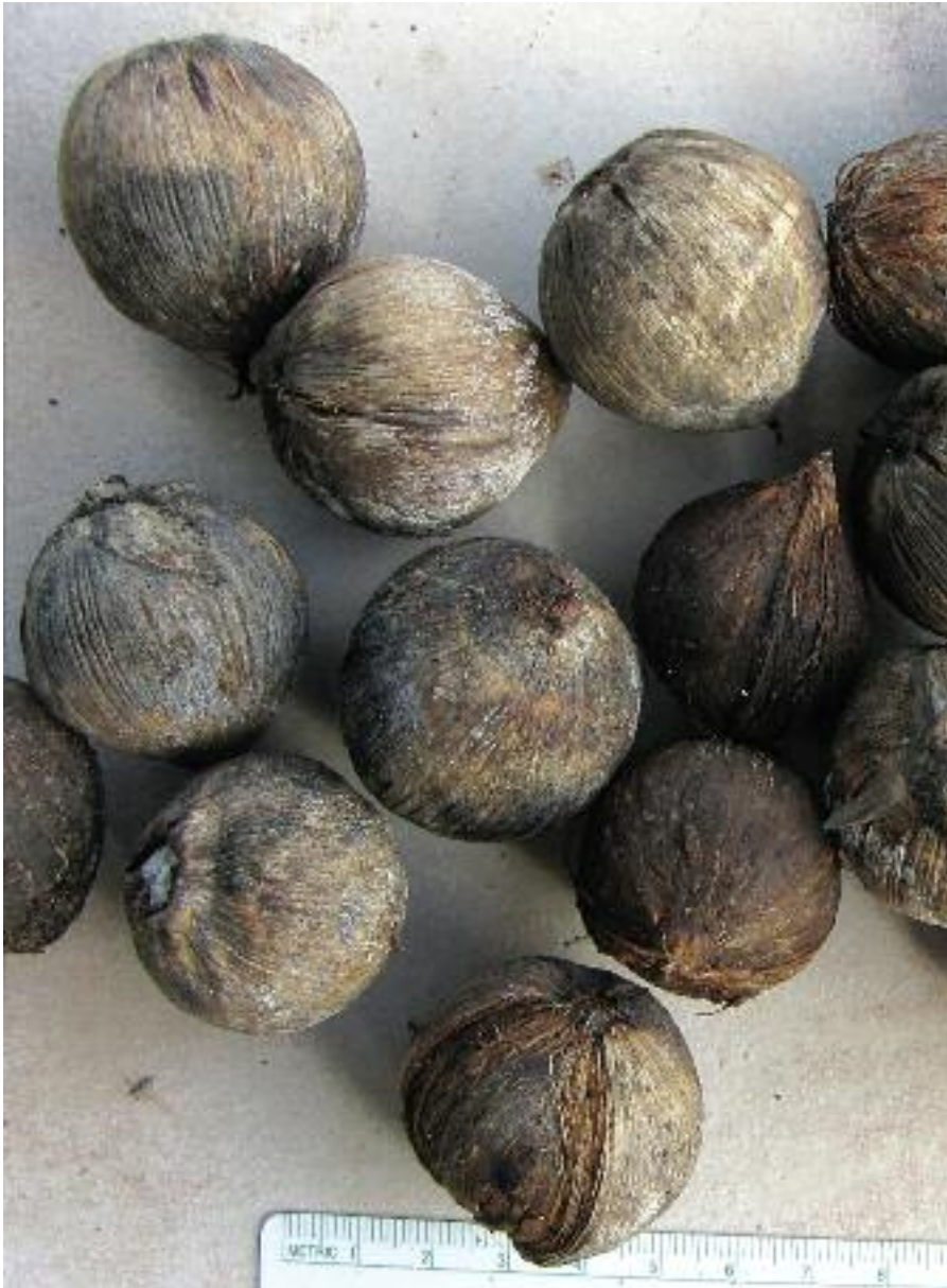
3. The longitudinally grooved exterior of Syagrus stincola fruits.

St. Elie. However, it is the site of a well-established trail and camp that have been used by the botanists from the Herbar de Guyane for many years. Sterile, acaulescent Attalea on well-drained soils were seen here. The trail also had a number of other interesting palms, like single stemmed species of Oenocarpus , O. bataua and O. bacaba (Fig. 4) and a Geonoma with strap shaped leaves, G. oldemanii . There was also Bactris raphidacantha , B. aubletiana , B. simplicifrons and Astrocaryum sciophilum . Although no palm collections could be made at the Piste de St. Elie, we found mature orange fruiting Astrocaryum vulgare (Fig. 5) at the edge