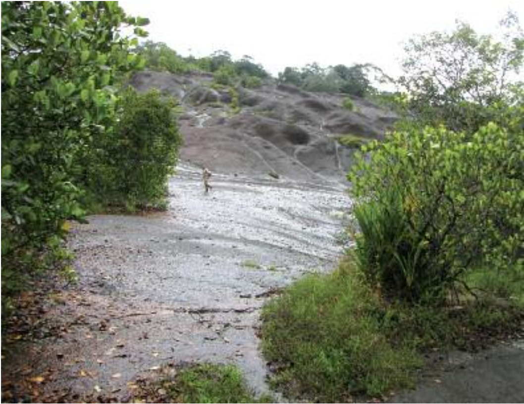
14. The Savane Roche de la Virginie inselberg with its dangerously slippery granite slopes.

lodging, Les Carbets du Bord. Our sleeping quarters were open to the elements, and the building where we stayed also had a small kitchen, large dining area with several picnic tables for eating and preparing meals (or pressing plants). The sleeping area was located on a higher level and included two foldout beds with mosquito netting but was mainly designed for hanging hammocks. In the evening, the electric lights were run from batteries, which were recharged daily by solar panels. We were pleasantly surprised to learn that they even had warm water (solar-heated) showers. We made an advanced reservation with a restaurant in town, which was required since we would be their only guests. It did not take us long to familiarize ourselves with the town, which included the city hall, the post office, the church, the fire station, and the National Park office.