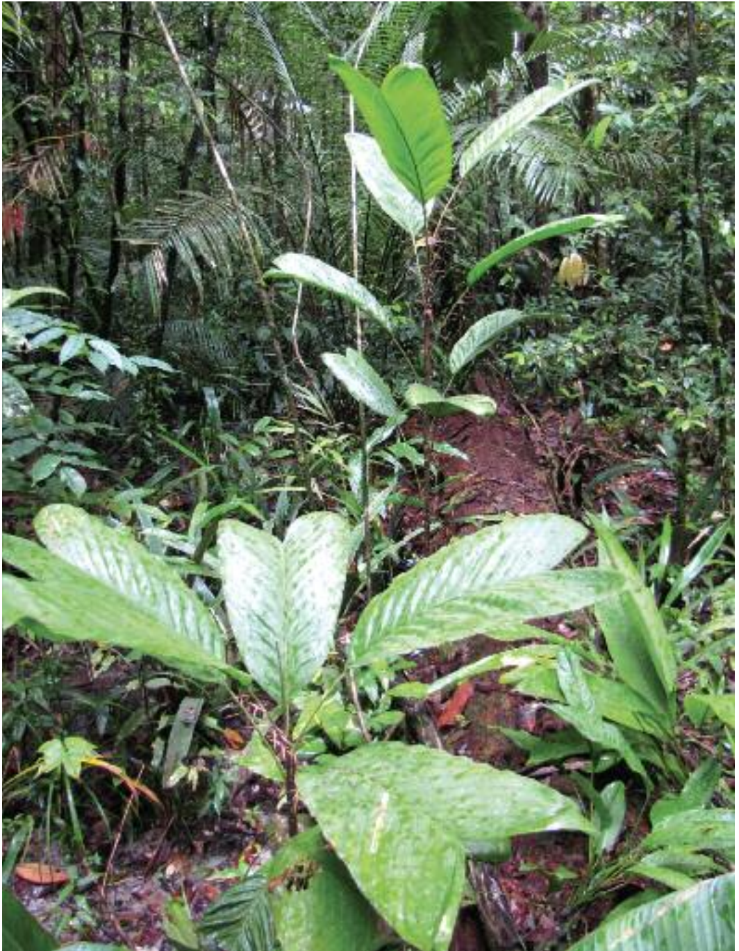
8. The rare, endemic Bactris nancibaensis with its entire bifid leaves.

resemble “koosh balls” or rambutans (Fig. 9). It is a very attractive but rather odd palm fruit.