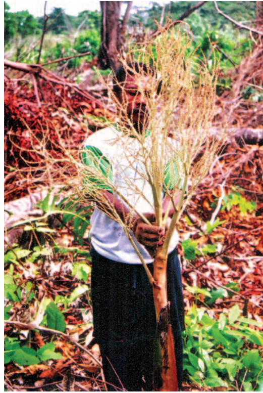
2. The inflorescence of Heterospathe elata .

The Heterospathe found on Gag is very rare, occurring scattered throughout the limestone forest and rarely as one or two trees in open grassland near the airstrip and in an old abandoned garden close to a coconut plantation in the north of the island. The palm is solitary, with a slender stem to 10 m high, and has about 17 leaves forming a dense crown