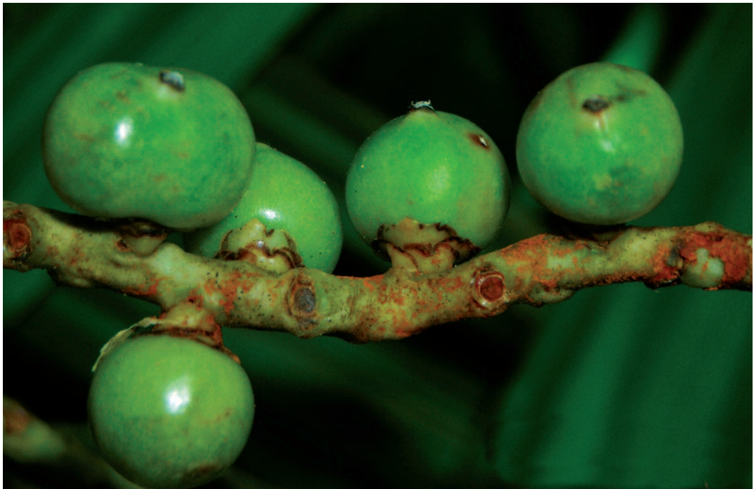
4. The fruits of Heterospathe elata – showing development of bi-lobed fruit and the rusty brown indumentum on the rachilla.

The Gag island palm displays an intriguing condition that has not been noted in Heterospathe before and is very unusual within tribe Areceae. Infructescences produce a mixture of single, bi-, and occasionally tri-lobed fruits, which contain one, two or three seeds correspondingly (Fig 4). From a total of three specimens from Gag Island, one specimen had 10.6% of its fruit with multiple lobes (26 out of 246 fruit), another 11.1% (43 out of 387), and the last specimen 5.3% (16 out of 302). On examining all fruit from all specimens of H. elata currently at Kew we found a single cultivated specimen at Kew, from “Lawn O” of Singapore Botanic Garden ( Nur s.n. ) collected in June 1929, and determined by Furtado, with a single bi-lobed fruit. We have no information as to where this specimen originally came from, but the fruit is still attached to a rachilla and indicates that this taxon has the capacity to produce such multi-lobed fruits.