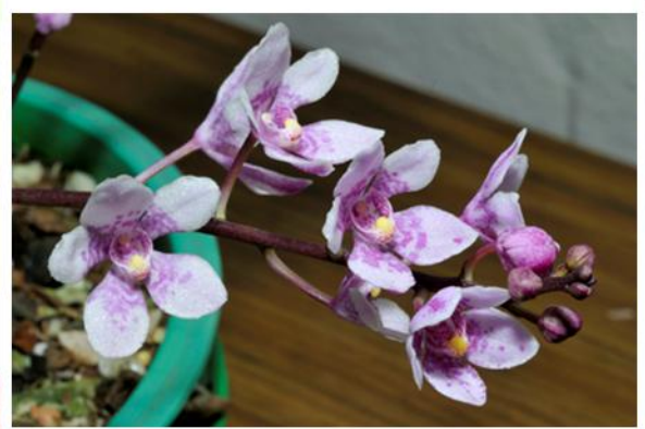
Sarcochilus Highton Magic