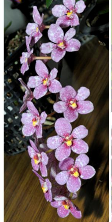
Sarc. Burgundy on Ice