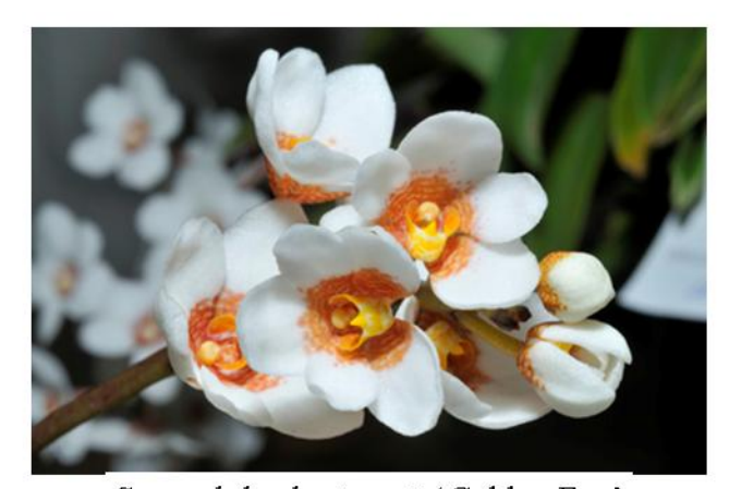
Sarcochilus hartmanii 'Golden Eye'