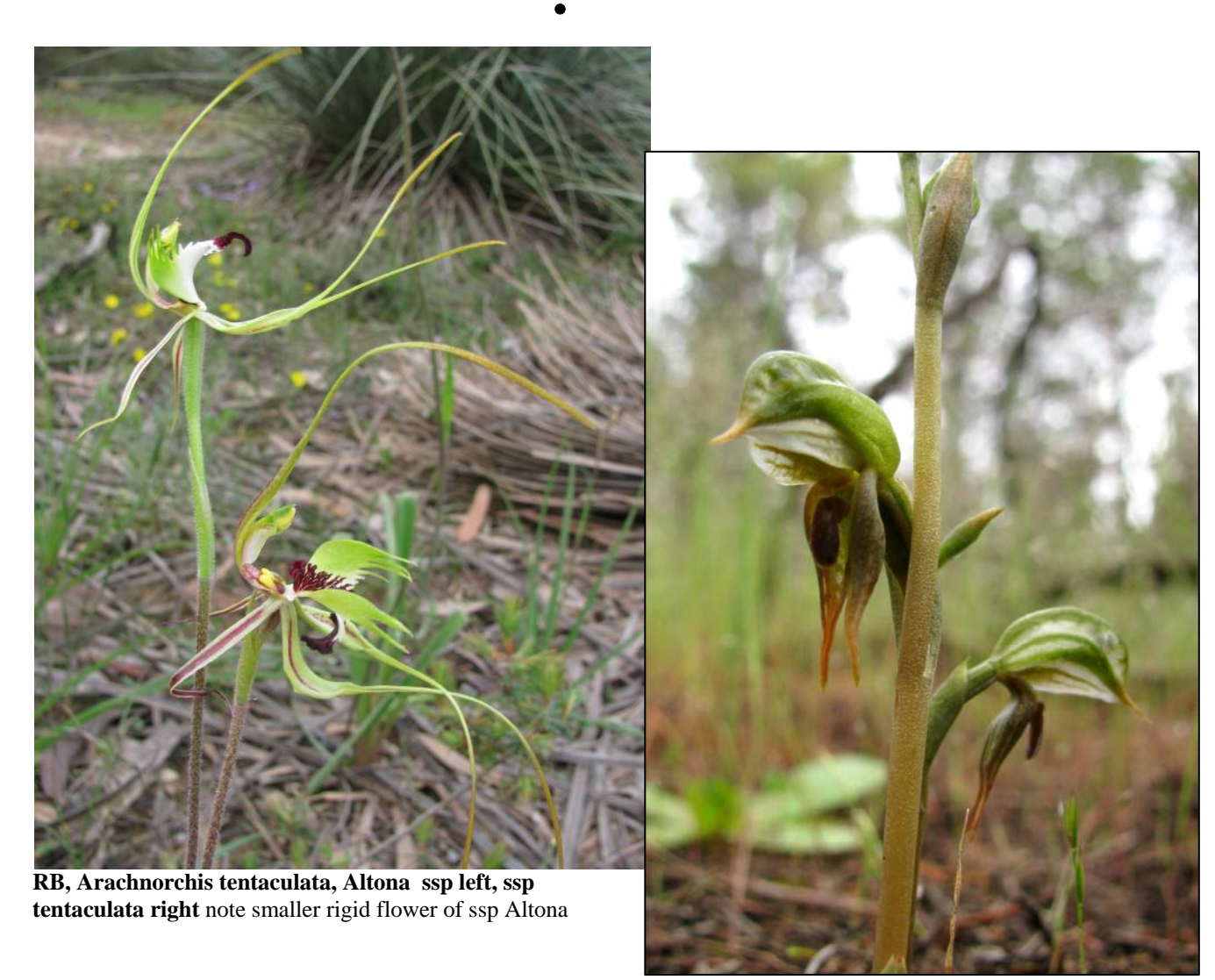
RB, Oligochaetochilus sp Sandy Creek, with O. pusillus behind