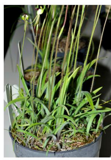
Count the seedlings.