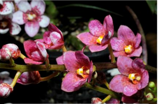
Sarc. Nabiac x Heidi 'Wedding Day'