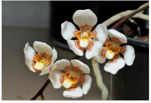
Sarcochilus falcatus x hartmanii