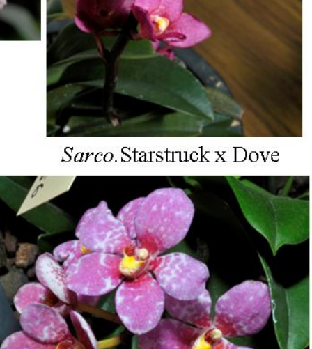
Sarcochilus Burgundy on Ice