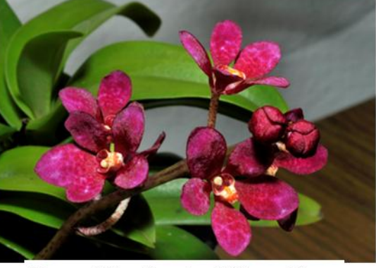
Sarcochilus Bernice Klien x Zoe