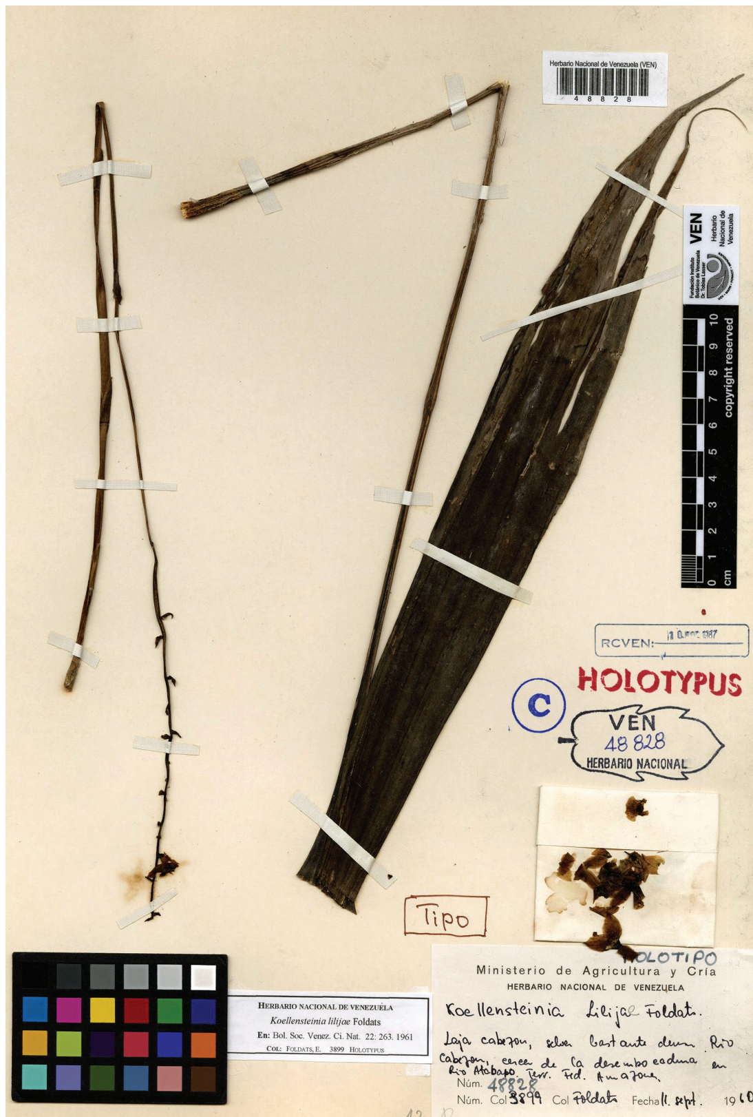
FIGURE 3. Koellensteinia lilijae Foldats. Holotype.