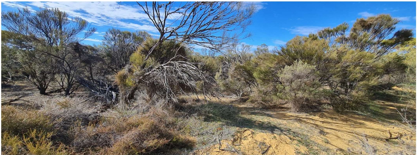
Figure 7. Photo showing roadside vegetation proposed to be cleared (Service Stream Maintenance, 2023)