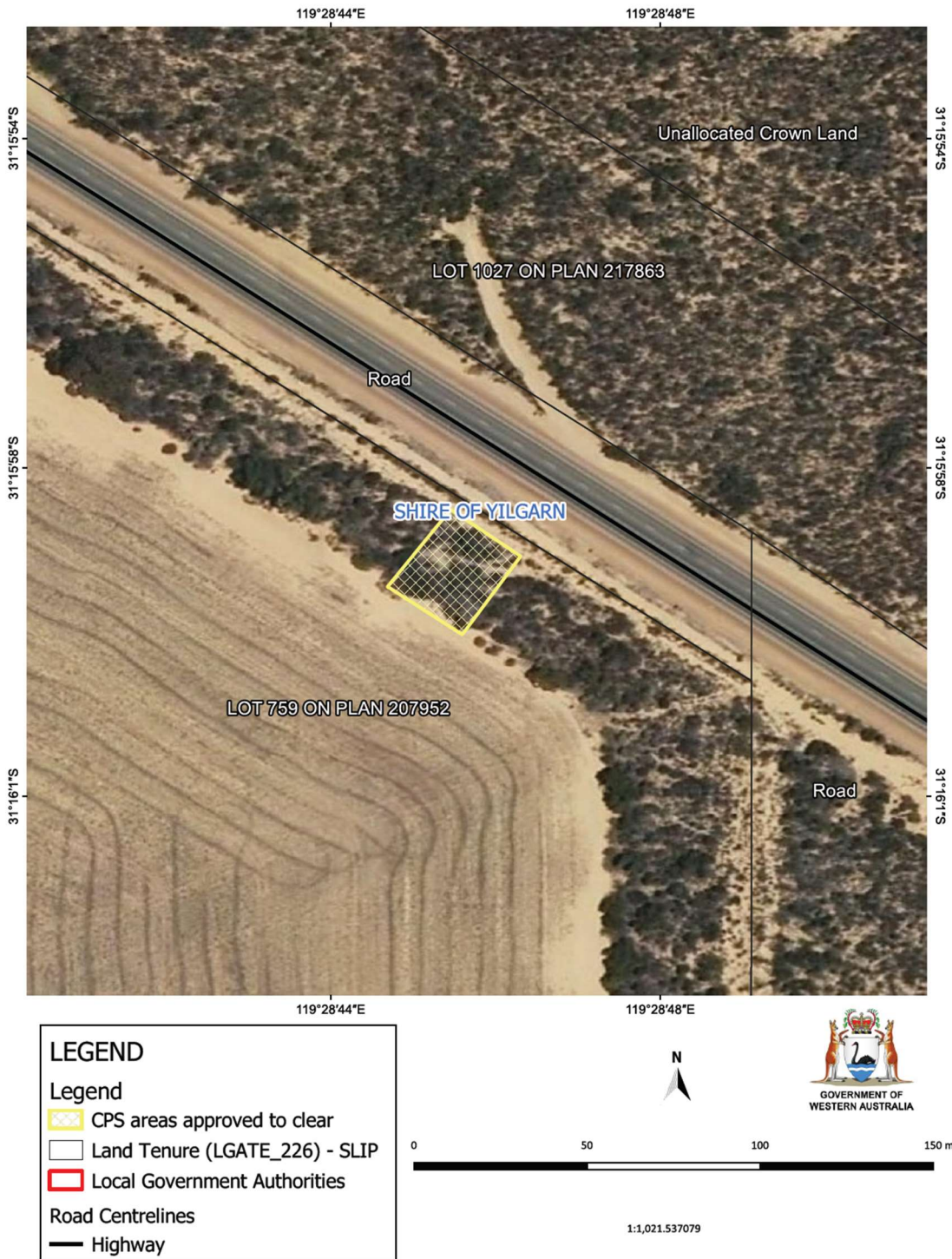
Figure 1 Map of the application area

The area crosshatched yellow indicates the area authorised to be cleared under the granted clearing permit.