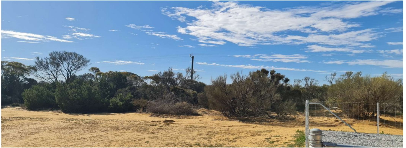
Figure 6. Photo showing roadside vegetation proposed to be cleared (Service Stream Maintenance, 2023)