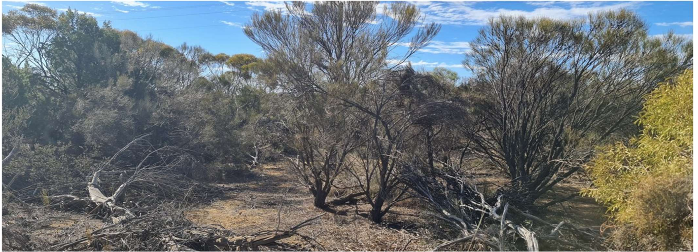
Figure 9. Photo showing roadside vegetation proposed to be cleared (Service Stream Maintenance, 2023)