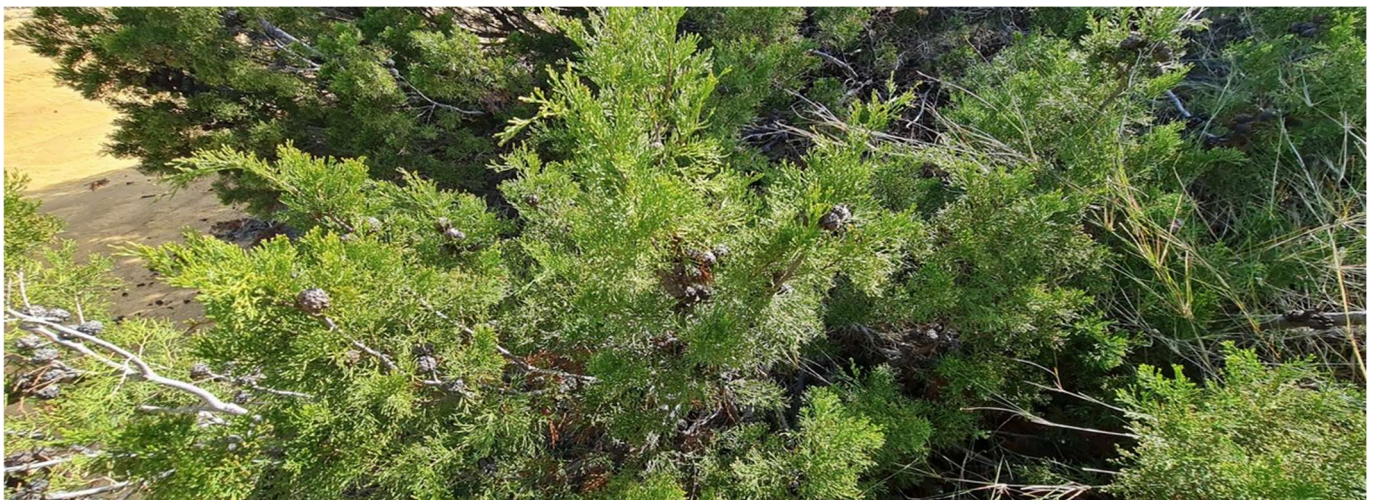
Figure 8. Photo showing roadside vegetation proposed to be cleared (Service Stream Maintenance, 2023)