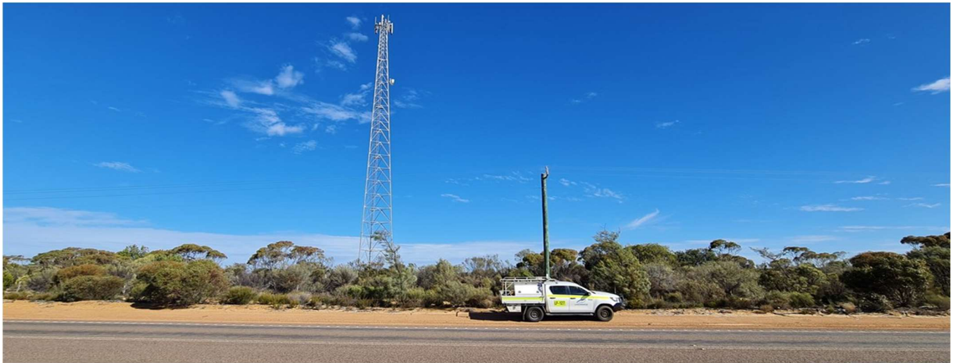
Figure 1. Photo showing roadside vegetation proposed to be cleared (Service Stream Maintenance, 2023)