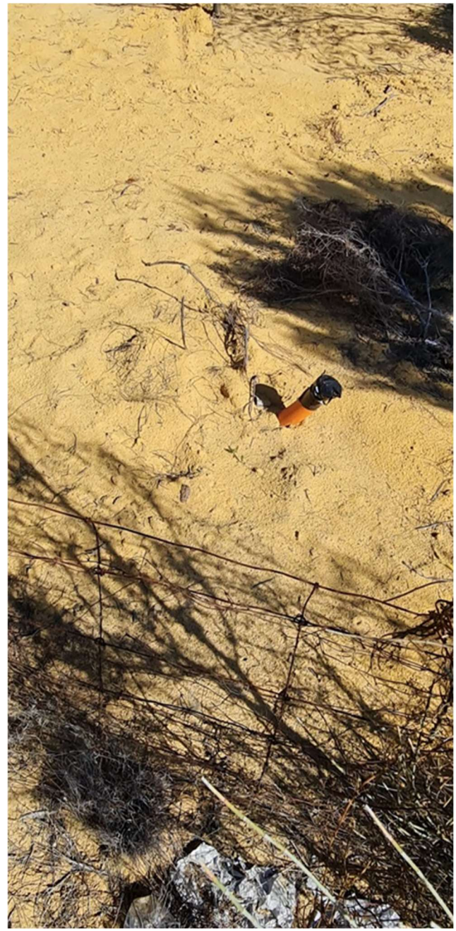
Figure 12. Photo showing underground conduit in area proposed to be cleared (Service Stream Maintenance, 2023)