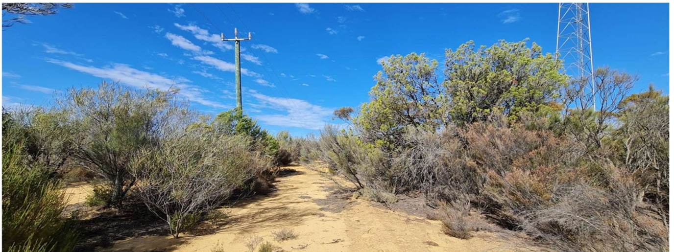
Figure 4. Photo showing roadside vegetation proposed to be cleared (Service Stream Maintenance, 2023)