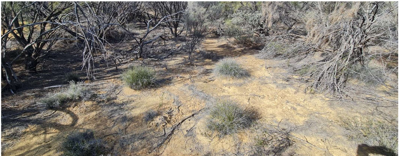
Figure 10. Photo showing roadside vegetation proposed to be cleared (Service Stream Maintenance, 2023)