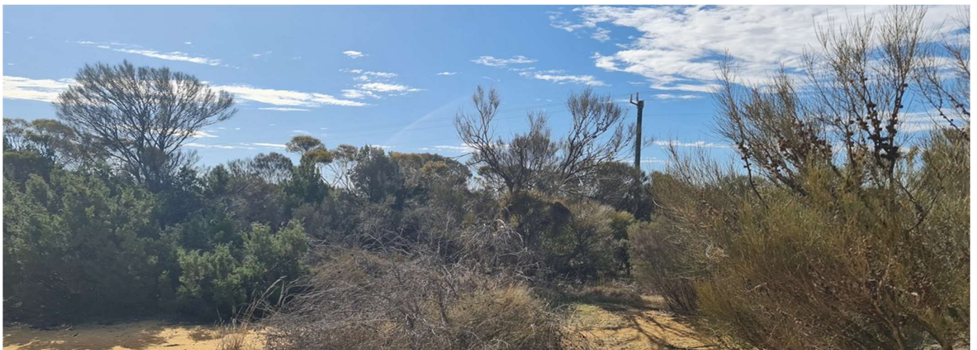
Figure 5. Photo showing roadside vegetation proposed to be cleared (Service Stream Maintenance, 2023)