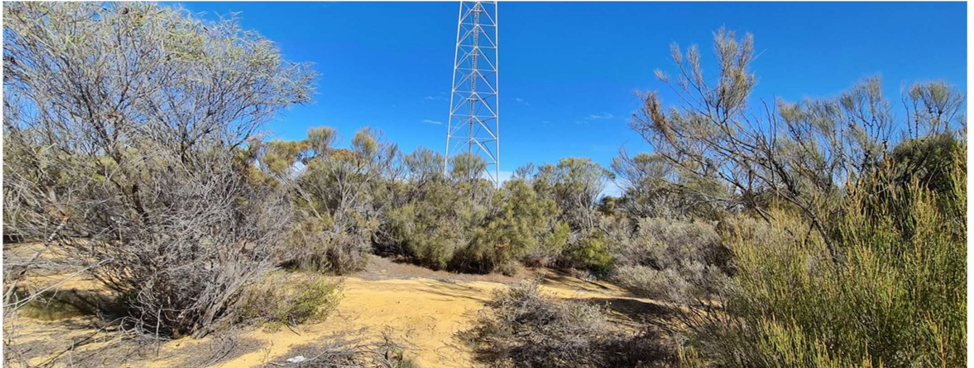
Figure 3. Photo showing roadside vegetation proposed to be cleared (Service Stream Maintenance, 2023)