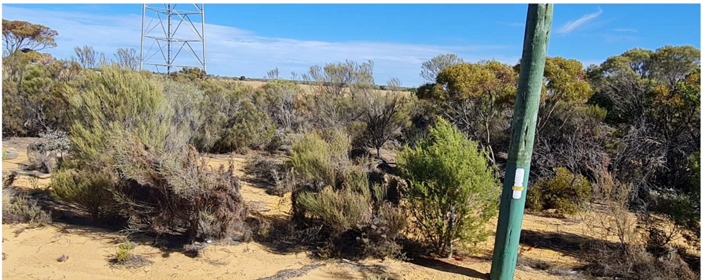
Figure 2. Photo showing roadside vegetation proposed to be cleared (Service Stream Maintenance, 2023)