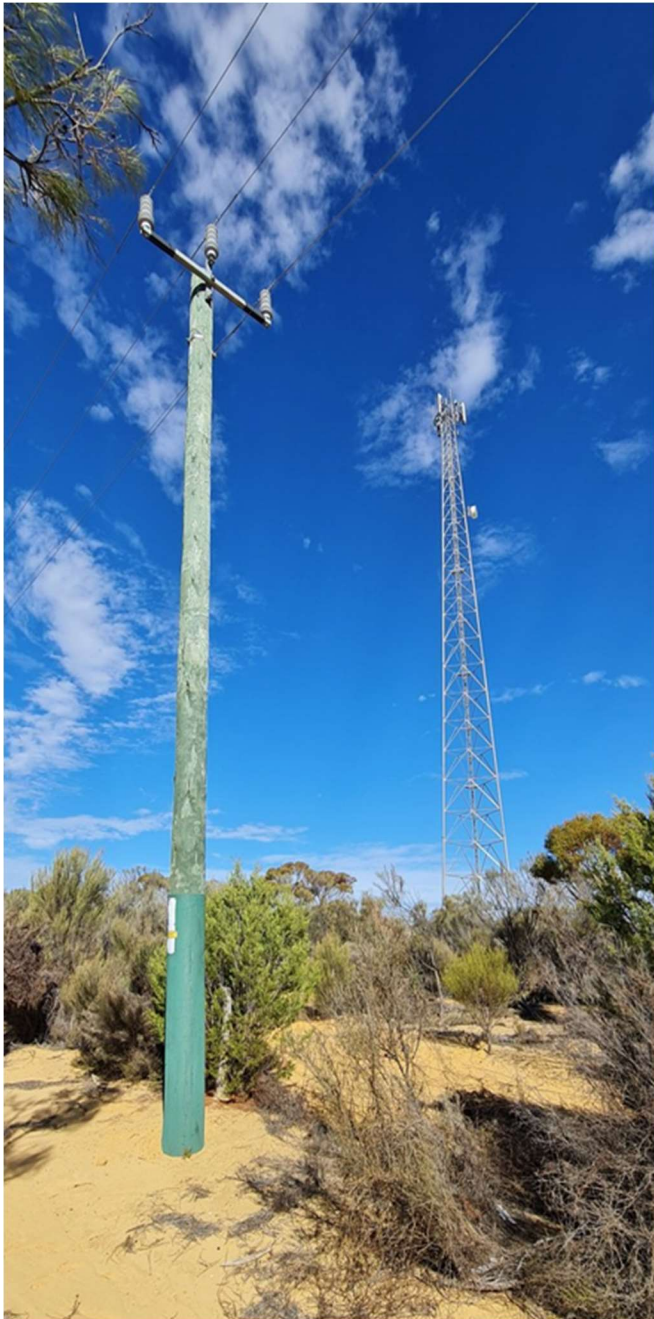
Figure 11. Photo showing roadside vegetation proposed to be cleared, noting the power pole to be connected (Service Stream Maintenance, 2023)