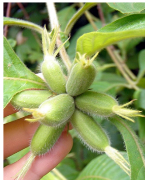
ຕັງເບີຕົ້ນ tang beu tohn bge130