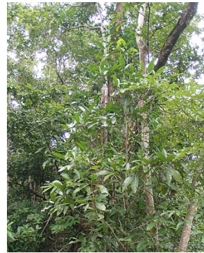
13 Tarenna disperma RUBIACEAE