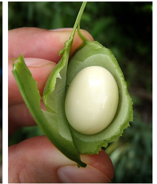
9 Entada reticulata FABACEAE-MIMOSEAE