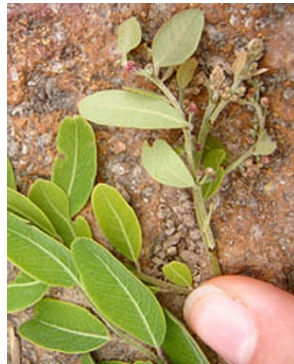
ຕັງຕີບ tang teep bge181, 203