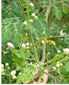
Moringa oleifera MORINGACEAE