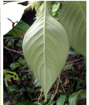
ຕັງເບີຕົ້ນ tang beu tohn bge130