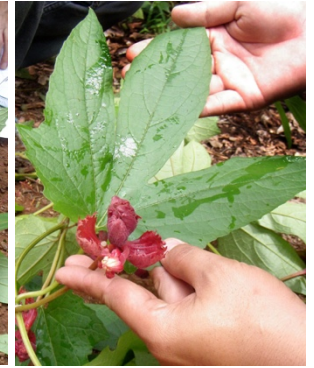
6 Combretum quadrangulare COMBRETACEAE