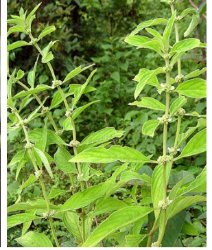
12 Hedyotis microsepala RUBIACEAE