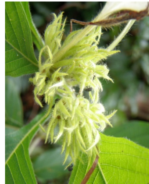
Mussaenda dinhensis RUBIACEAE