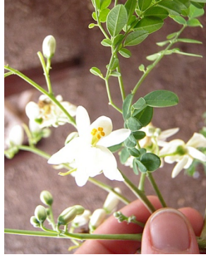
ຕົ້ນຜັກອີຮຸມ tohn pak ii houm