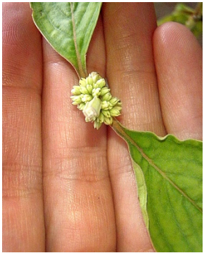
12 Hedyotis microsepala RUBIACEAE