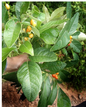
16 Clausena guillauminii RUTACEAE