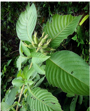
15 Mussaenda dinhensis RUBIACEAE