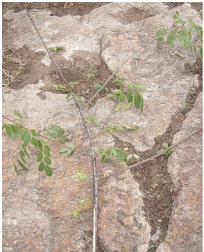
14 Phyllanthus reticulatus PHYLLANTHACEAE