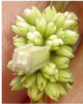
nya moung ka tai bge205