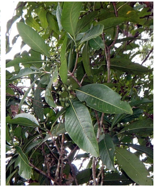
ເຂັມຈ້າງ khem sang bge207