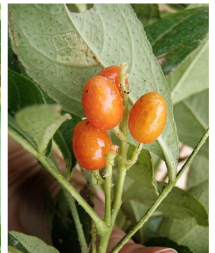
ສ່ອງຜ້າ song fa bge232