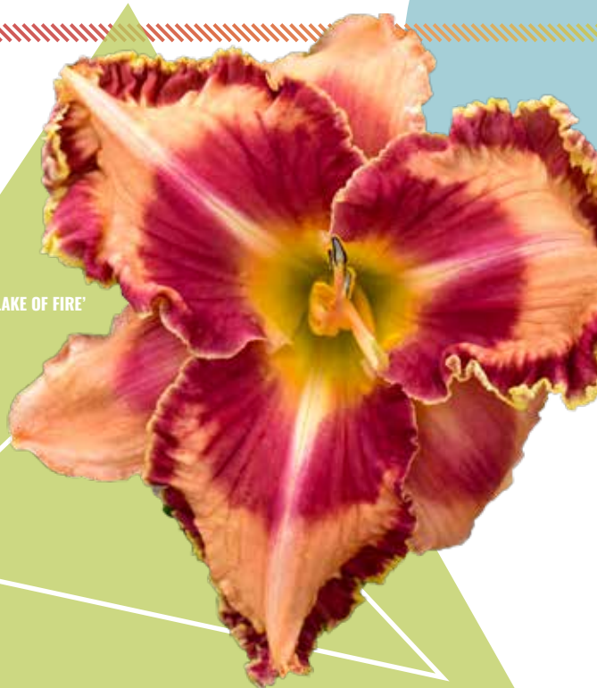
'LAKE OF FIRE'