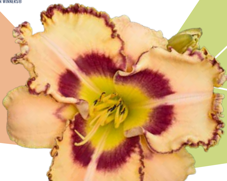
'KING OF AGES'