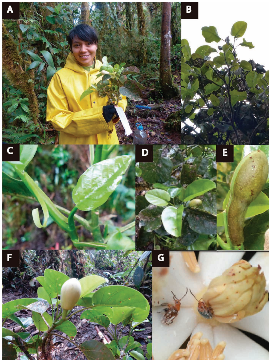
FIGURE 2. Magnolia vargasiana A. Yajaira Malucín, student at Universidad Estatal Amazónica, holding a flower bud, with sepals all the way down in day one (male phase) at 9:16 hrs, where flea beetles had just overnighted and are about to leave the flower in the afternoon. With dense “bosque siempreverde montano” in the background. B. Foliage. C. Detaching stipule. D. Branch with flower bud including second hypsophyll. E. First hypsophyll. F. Flower bud in day 0 (0D, female phase), without hypsophylls. G. Flea beetles (Tribe Alticini, Chrysomelidae) covered with pollen. (Photographs: B, C & E by Fausto Recalde, from the holotype; A, D, F & G by Lou Jost, from Merino-Santi et al. s.n. , ECUAMZ, IBUG).

Trees 11–26 m tall, 20–50 cm dbh, first branches at 6–10 m; bark longitudinally and narrowly striate with lenticels, apparently smooth, greyish; terminal twig internodes 4.0–8.0(–10.0) × 2.8–4.0 mm, lenticellate, glabrous; petioles 4.0–6.50 × 0.2–0.3 cm, stipules c. 3.4 cm long, covering the entire length of petiole; mature leaf blades 6.0–10.5 × 7.5–11.0, suborbicular, broader in the lower half, rarely wider than long, subcordate to cordate at the base, obtuse or rarely emarginate at the apex, coriaceous, glabrous, 6–7 lateral veins per side; hypsophylls (2.0–)3.5–2.8 × 2.5–3 cm, peduncle 1.0–1.8 cm, flower buds ellipsoidal 1.5–2.8 × 1.5–1.7 cm, glabrous; open flower 7.0–7.5 cm in diameter; sepals elliptic 3.6–3.7 × 1.8–2.0 cm, adaxially creamy white, abaxially dark grayish at the base and axis, fading to creamy white at the margins; petals 8, obovate to spatulate and concave, unequal in size, 2.7–3.8 × 0.8–2.0 cm, creamy white; stamens 50–54, 1.20 × 0.15 cm, creamy white; gynoecium ellipsoid, 1.5–1.7 × 0.7–0.8 cm, pale yellowish green; carpels 10, stylar tips 1.5 mm long, black. Fruit and seeds unknown.