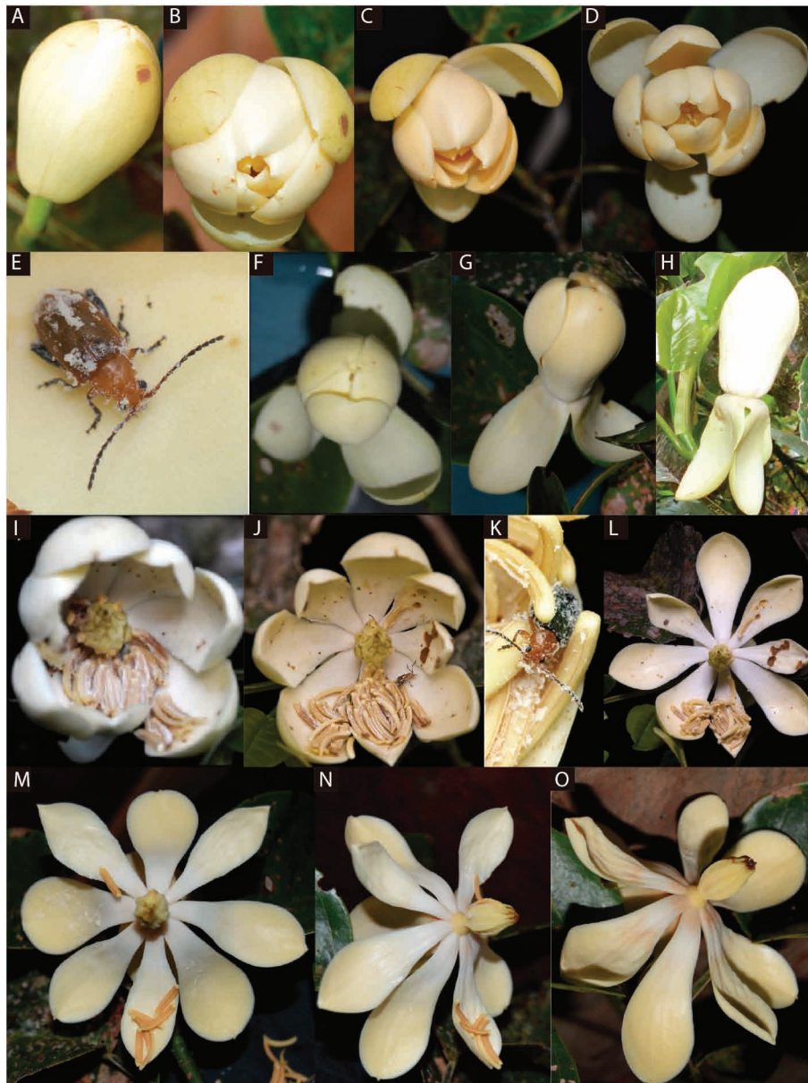
FIGURE 3. Magnolia vargasiana . Flowering timing. A. Day zero (0D, female phase), 16:49 hrs. B. 0D 17:16 hrs. C. 0D 17:28 hrs. D. 0D, 18:00–19:58 hrs. E. Flea beetle, orange brownish (Tribe Alticini, Chrysomelidae). F. 0D 21:04 hrs. G. Day one (1D, male phase) 4:23 hrs. H. 1D, ca. 9:13 hrs. I. 1D, 14:05 hrs. J. 1D, 14:25 hrs. K. Flea beetle, bright green. L. 1D, 14:55 hrs. M. 1D, 18:27 hrs. N. 1D, 18:27 hrs. (side view). O. 2D, 2:43–6:19 hrs. (Photographs: A–D, F–G, & M–O by Antonio Vázquez, from Vázquez-García et al. 10131; E & I–K by Lou Jost, based on Merino s.n. , ECUAMZ, IBUG; and H by Efrén Merino, based on Merino-Santi s.n. , ECUAMZ, IBUG).

Distribution and ecology: — Magnolia vargasiana is endemic to the Cordillera de los Llanganates, Tungurahua (Ecuador) and is thus far only known from the type locality, consisting of two trees > 10 cm dbh within a permanent forest inventory plot of 0.25 ha at 2000 m elevation in the Río Zuñac Reserve (Zuñac Plot 2). The Río Zuñac Reserve is a privately held conservation area privately owned by an Ecuadorian non-government organization, the EcoMinga Foundation. The plot itself is about 1 km outside the boundary of Llanganates National Park, located on a steep mountain ridge above the canyon of the upper Río Zuñac; this portion of the Llanganates is also known as the Cordillera Abitagua. The climate is perhumid with annual rainfall greater than 4000 mm (Ministerio del Ambiente, 2012). Vegetation is described as being a dense cloud forest, with about 800 trees \geq 10 cm DBH per hectare and a closed canopy about 25 m tall with abundant vascular epiphytes and bryophytes. In the classification system of terrestrial ecosystems of Ecuador (Ministerio del Ambiente, 2012) the vegetation type at the site is “bosque siempreverde montano del Norte de la Cordillera Oriental de los Andes”. The dominant tree species recorded in the 0.25 hectare include Wettinia fascicularis (Arecaceae), Brunellia pallida (Brunelliaceae), Weinmannia pinnata (Cunoniaceae), Dicksonia