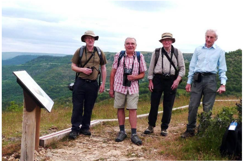
The Cevennes Butterfly Group

Setting up a personal profile at <u>www.facebook.com</u> is quick, free and easy. The <u>Naturetrek Facebook page</u> is now live; do please pay us a visit!