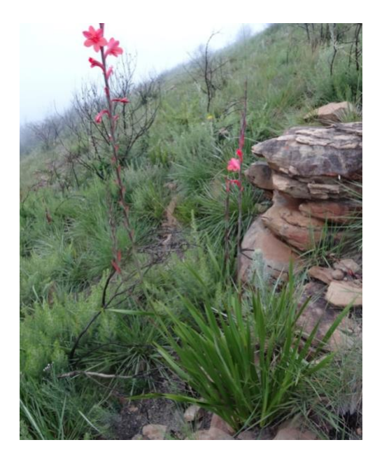
Fig.2 Watsonia pillansii showing its tolerance of harsh growing conditions in the wild. http://www.africanplants.senckenberg.de/