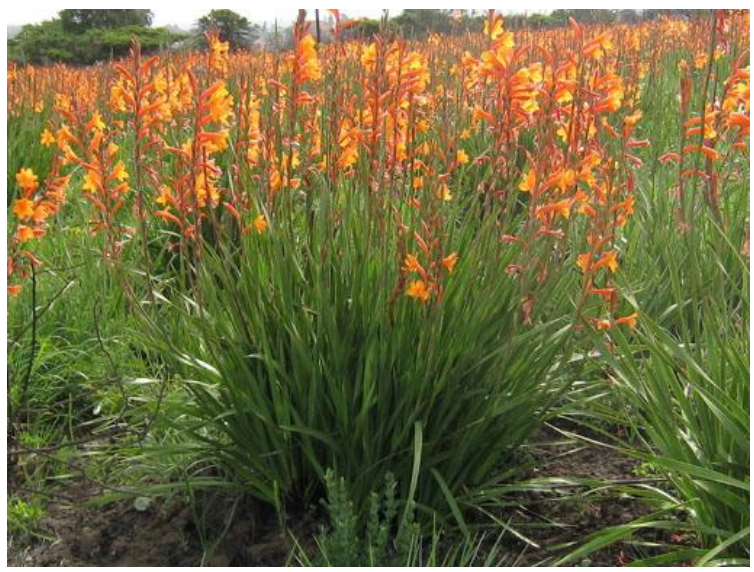
Fig. 1. Watsonia pillansii growing in South Africa (Images from http://www.africanplants.senckenberg.de/)

6 weeks) and requires at least 3 years to flower. It does not have known medicinal uses and is not a valuable food source for human consumption.