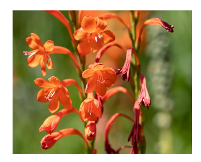
Fig. 3 Blomming Watsonia pillansii https://www.gardenia.net/plant/watsonia-pillansii