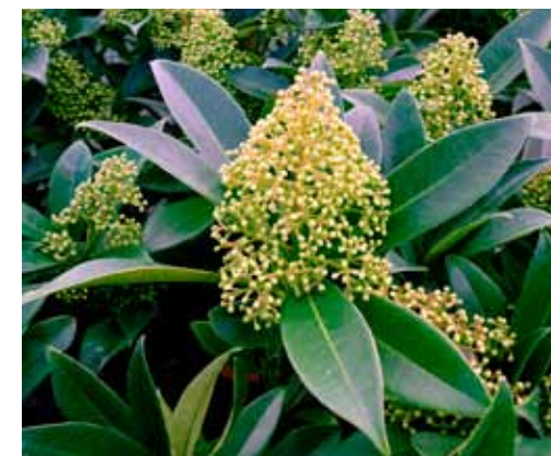
Skimmia Kew Green