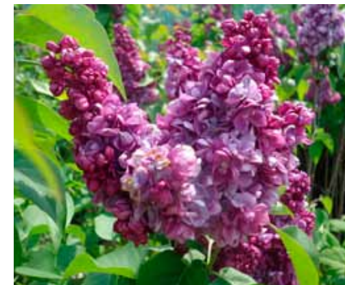
Syringa vulgaris cv.