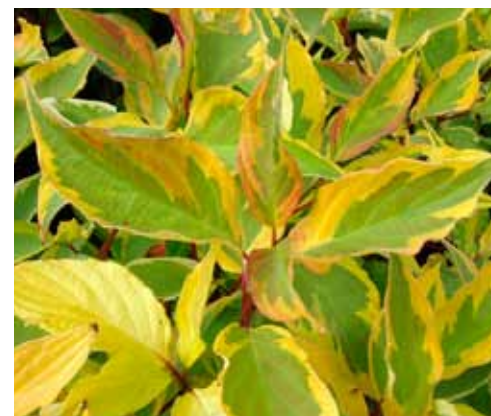
Cornus alba Gouchaltii