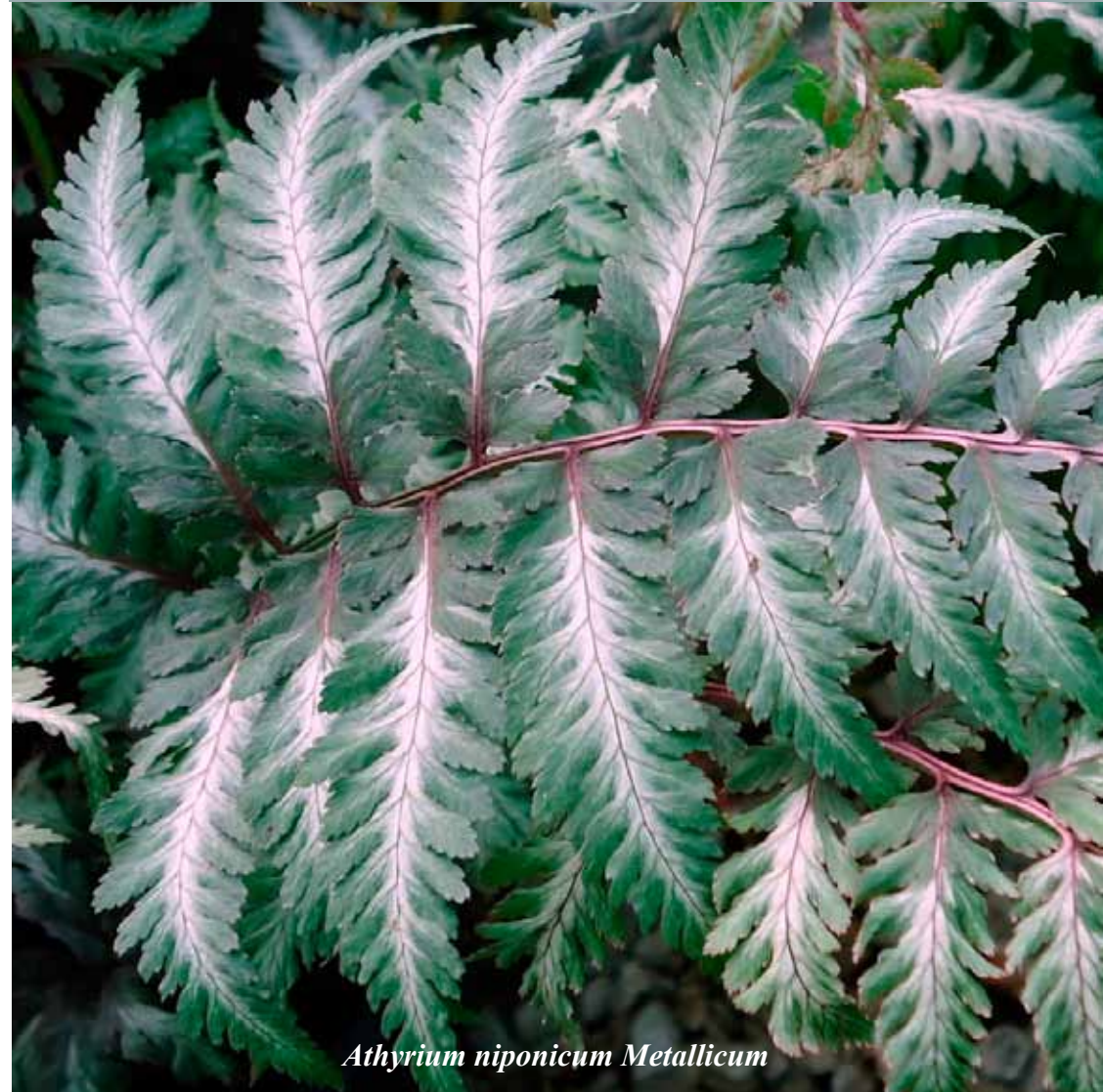
Athyrium niponicum Metallicum