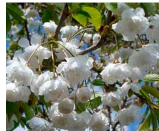
Prunus avium Plena