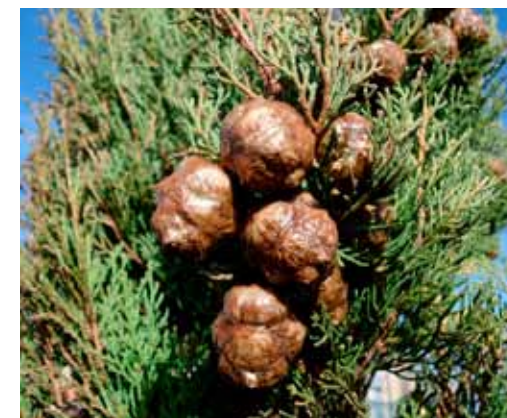
Cupressus sempervirens pyramidalis