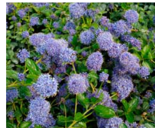
Ceanothus thyrsiflorus repens