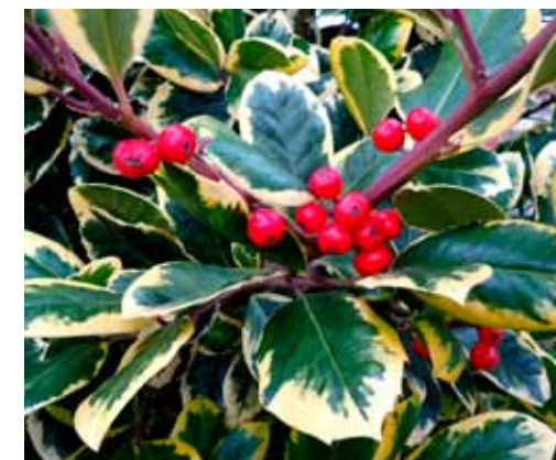
Ilex altaclarensis Golden King