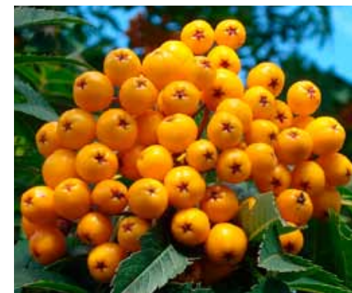
Sorbus arnoldiana Sunshine