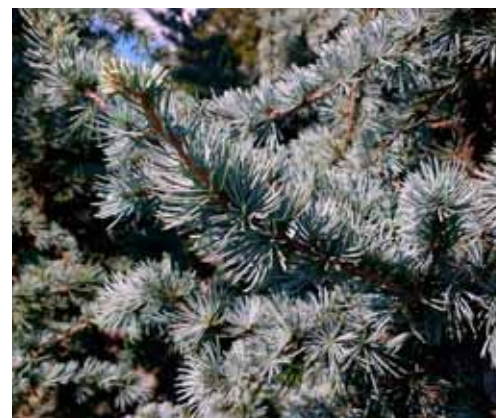
Cedrus atlantica glauca