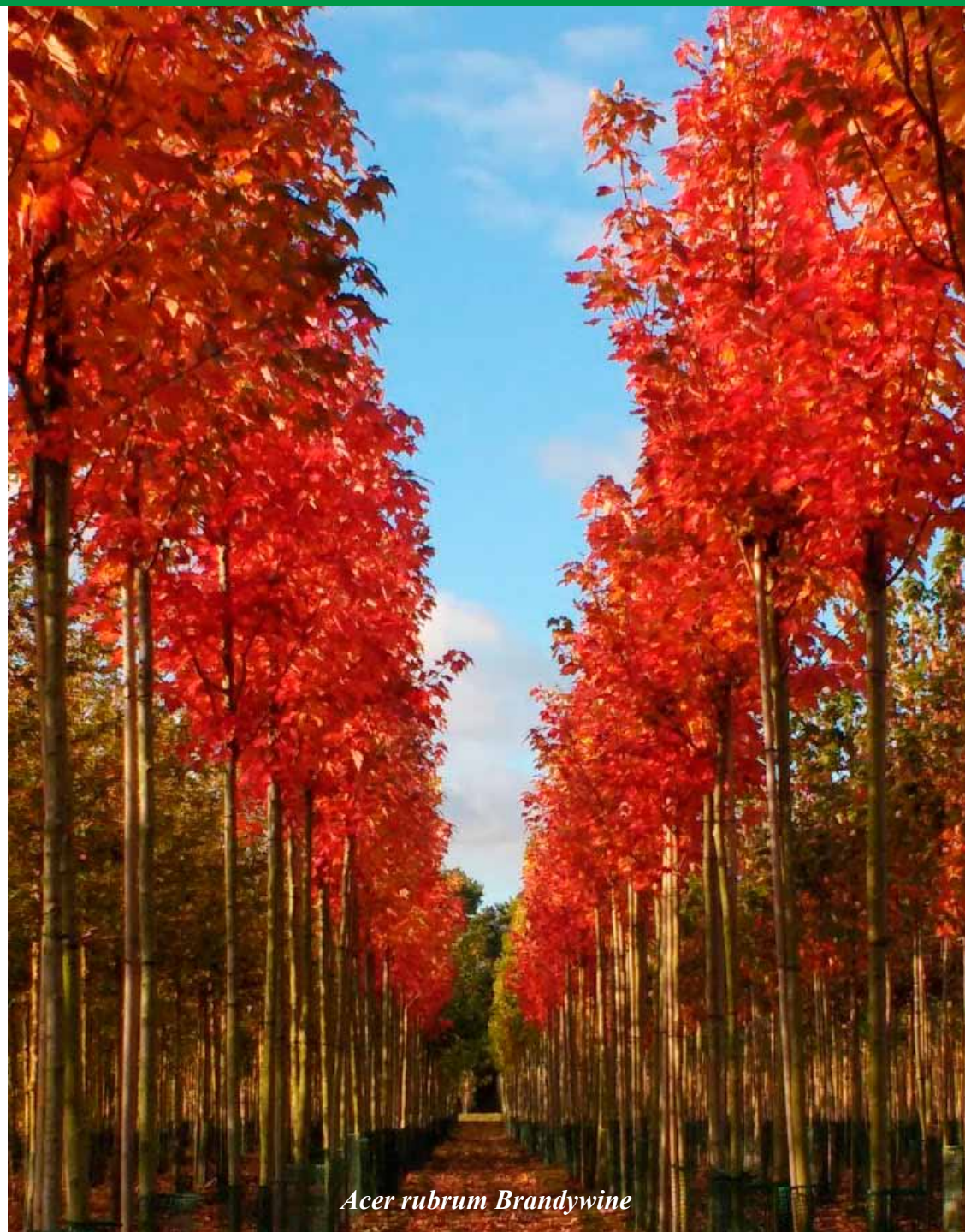
Acer rubrum Brandywine

THE PLACING OF AN ORDER IMPLIES ACCEPTANCE OF THESE TERMS & CONDITIONS.