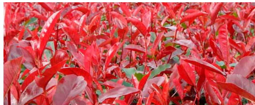
Photinia x fraseri Red Robin