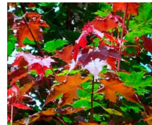
Acer platanoides Deborah