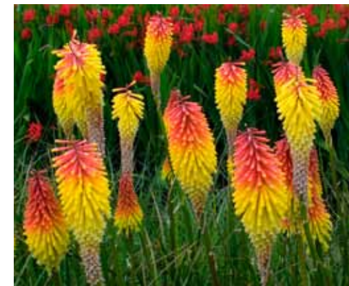
Kniphofia Royal Standard