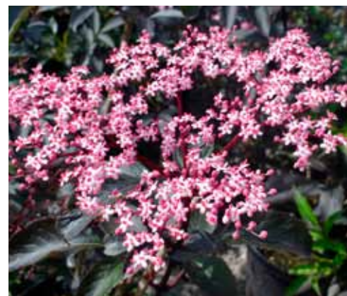
Sambucus Black Beauty