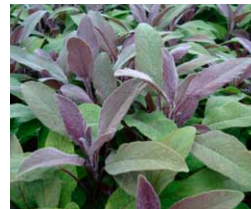
Salvia officinalis Purpurascens