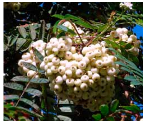
Sorbus White Wax