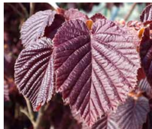
Corylus maxima Purpurea