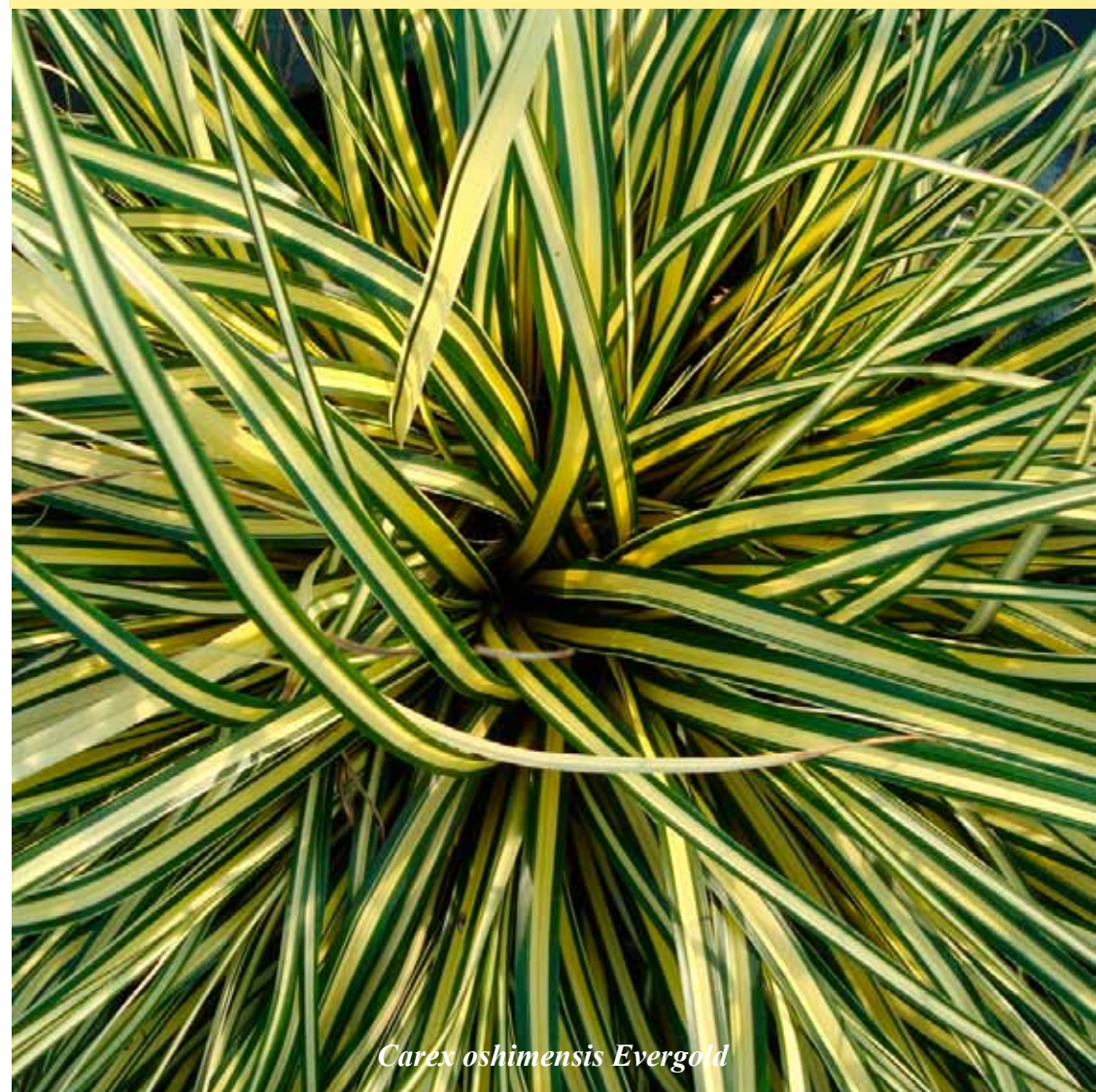
Carex oshimensis Evergold