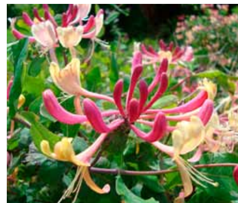
Lonicera periclymenum Belgica