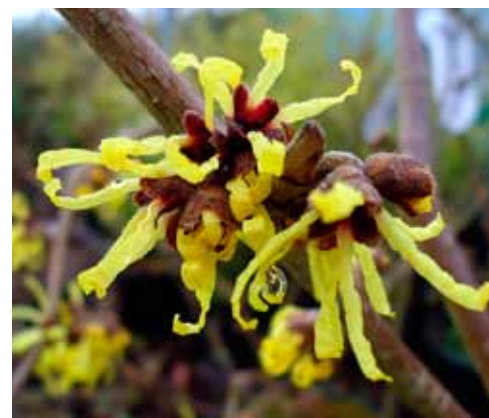
Hamamelis intermedia Arnold Promise