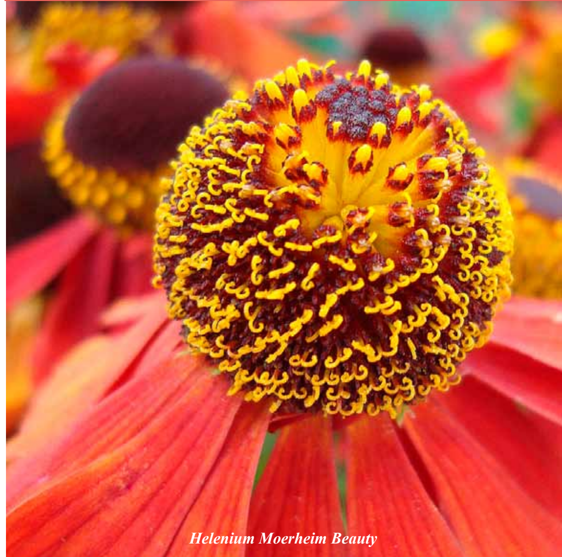
Helienium Moerheim Beauty