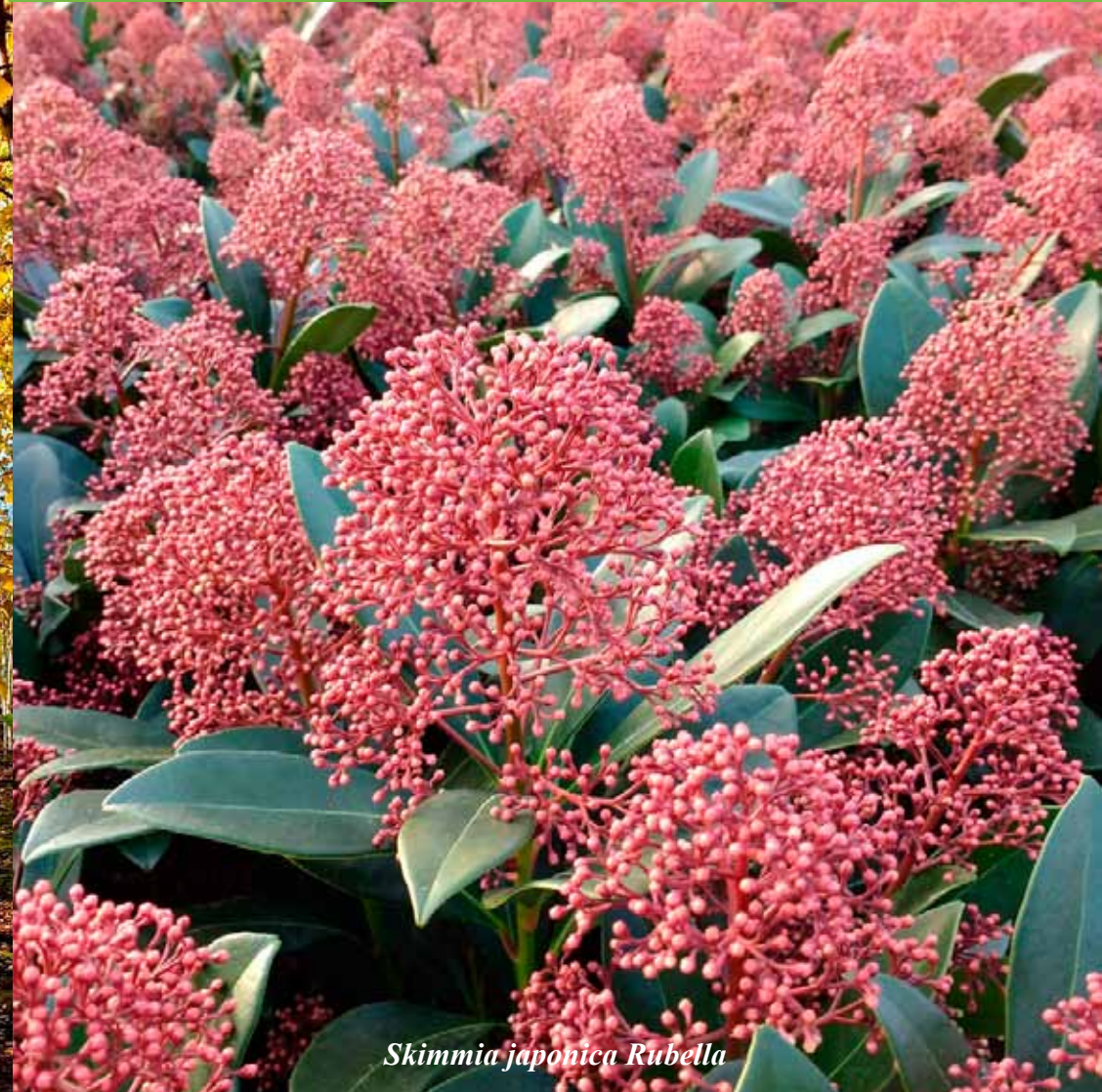
Skimmia japonica Rubella