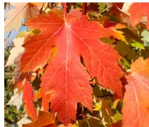
Acer freemanii Celebration