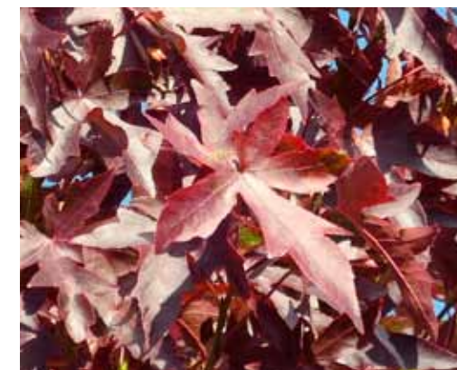
Liquidambar styraciflua Worplesdon