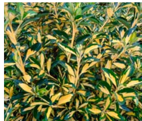
Euonymus japonicus Aureo-pictus