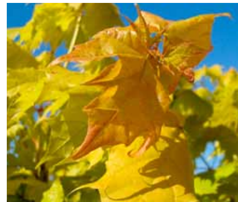
Acer platanoides Princeton Gold