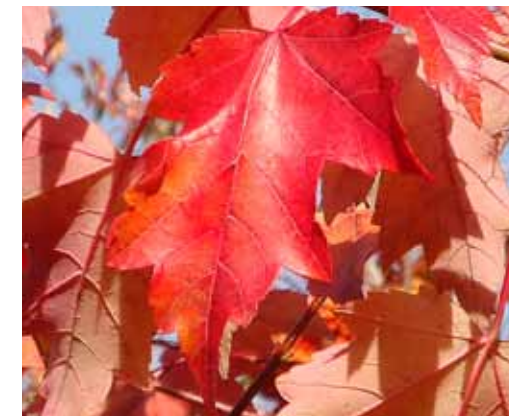
Acer rubrum Red Sunset