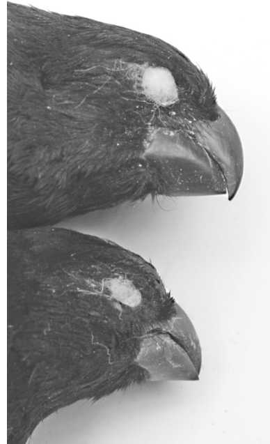
Figure 2. Comparison of bill size between Cuban Bullfinch Melopyrrha n. nigra of Cuba (lower bird) and M. n. taylori of Grand Cayman (upper bird), United States National Museum, Smithsonian Institution, Washington DC (James W. Wiley)

Female nigra is uniform dull slate-black and less glossy, sometimes almost dark slate, especially on the posterior underparts. The upperparts are almost uniform except the lower neck, back and rump are tinged brownish contrasting with the slate-black head. Female taylori is bicoloured, being mostly blackish slate on the head and upperparts, although not as dark as nigra , and has dull brownish olive-grey lower abdomen and flanks (Fig. 3). Throat, breast and upper abdomen are not dull black as in nigra , but are blackish grey contrasting with a paler lower abdomen and flanks. In Cuban females, the slate-black coloration is practically uniform from throat to undertail-coverts. Immature nigra resembles adult females, but have brownish wing feathers and tail, a smaller and less contrasting white wing patch, with no gloss or slate tones. Immature male taylori resemble adult females, with an olive-tinged dark head and much paler olive-grey posterior upperparts (Ridgway 1901), brownish fringes to the primaries, and abdomen tinged cinnamon. White in the wing is reduced or absent in both sexes (Bradley & Rey-Millet 2013).