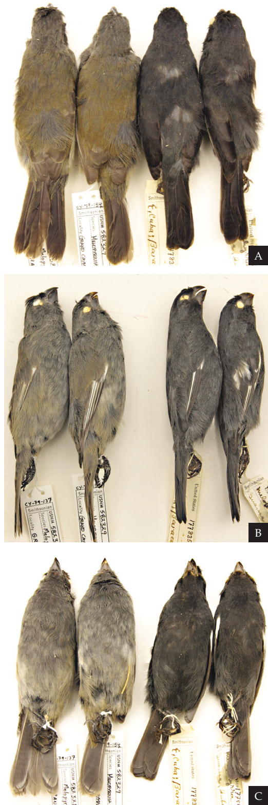
Figure 3. Comparison of plumage coloration between female Cuban Bullfinch Melopyrrha nigra taylori of Grand Cayman (left two individuals) and Melopyrrha n. nigra of Cuba (right two individuals): (A) upperparts, (B) lateral view, (C) underparts, United States National Museum, Smithsonian Institution, Washington DC (James W. Wiley)

Although formerly considered common on Grand Cayman, the bullfinch's range has been reduced and it is now rare to absent west of Savannah due to urban development and loss of habitat due to forest clearance and hurricanes. East of Savannah, it is a locally common resident breeding mainly in dry forest within the protected Botanic Park and Mastic reserve, and in shrubland and woodland in the north and east where continued development threatens habitats (Bradley 2000, Bradley & Rey-Millet 2013). It bred infrequently in mangroves but since Hurricane Ivan (2004) breeding has not been observed in mature black ( Avicennia germinans ), white