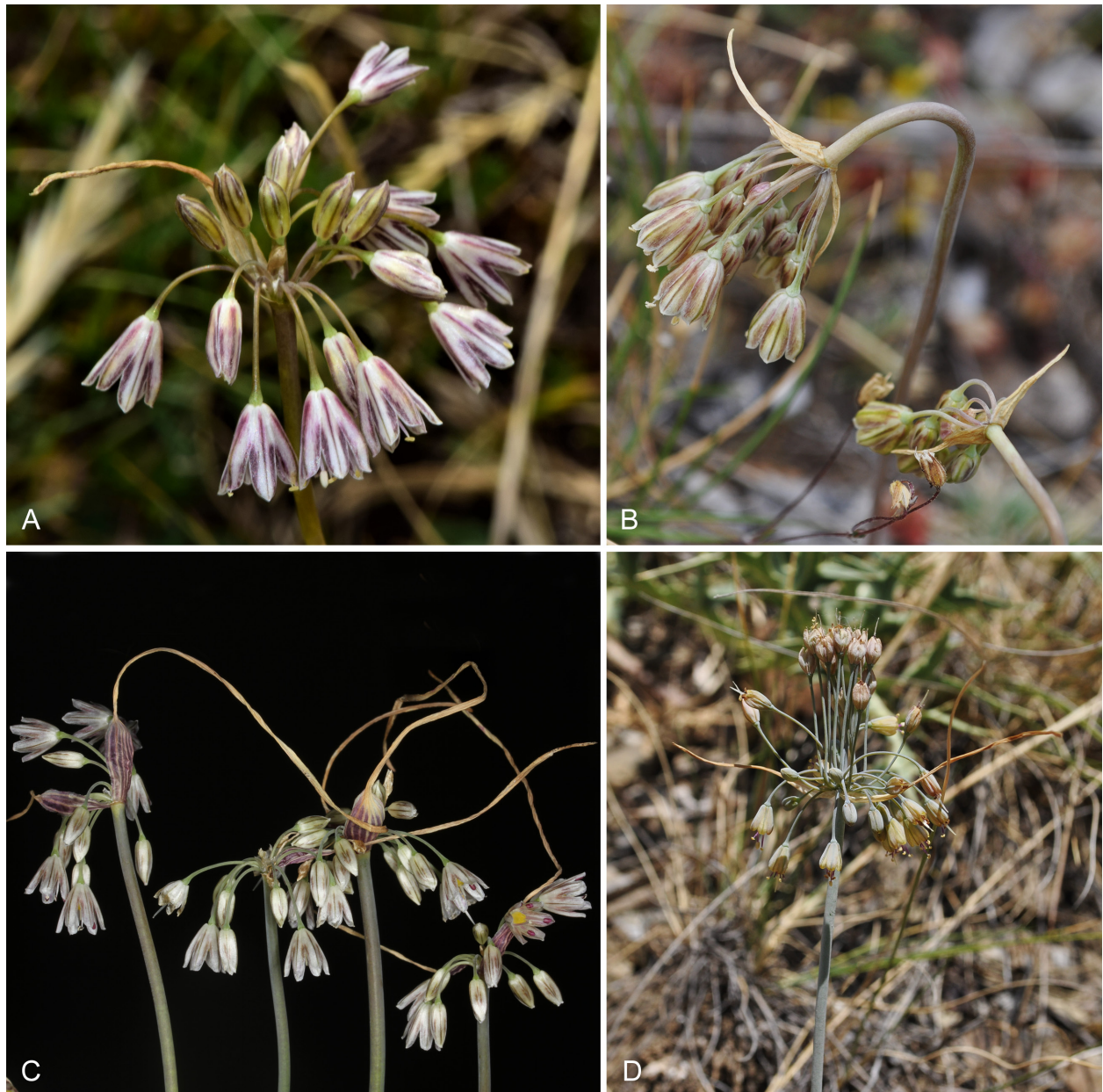
Fig. 1. Inflorescences – A: Allium oreohellenicum from S Pindos (Mt Kakarditsa, 6 Aug 2017, photograph by I. Kofinas); B: A. frigidum from Peloponnisos (Mt Panachaikon, 24 Jul 2014, photograph by D. Tzanoudakis); C: A. parnassicum from Sterea Ellas (Mt Parnassos, 28 Jul 2015, photograph by P. Trigas); D: A. flavum subsp. tauricum from Peloponnisos (Mt Klokos, 11 Jul 2017, photograph by D. Tzanoudakis). – The last (D) erroneously considered by Bogdanović & al (2011) as the “true A. achainum ”.

Stearn (1978, 1980, 1981) and Kollmann (1984: 135). On the contrary, A. achainum has been subsequently reappraised as a distinct species of the Greek flora by Andersson (1991: 709), with the Orphanides gathering from Mt Klokos in G-BOISS as the holotype of the species and its total distribution range indicated from Peloponnisos to the mountains of Sterea Ellas and Southern and Northern Pindos (Thessalia/Ipiros).