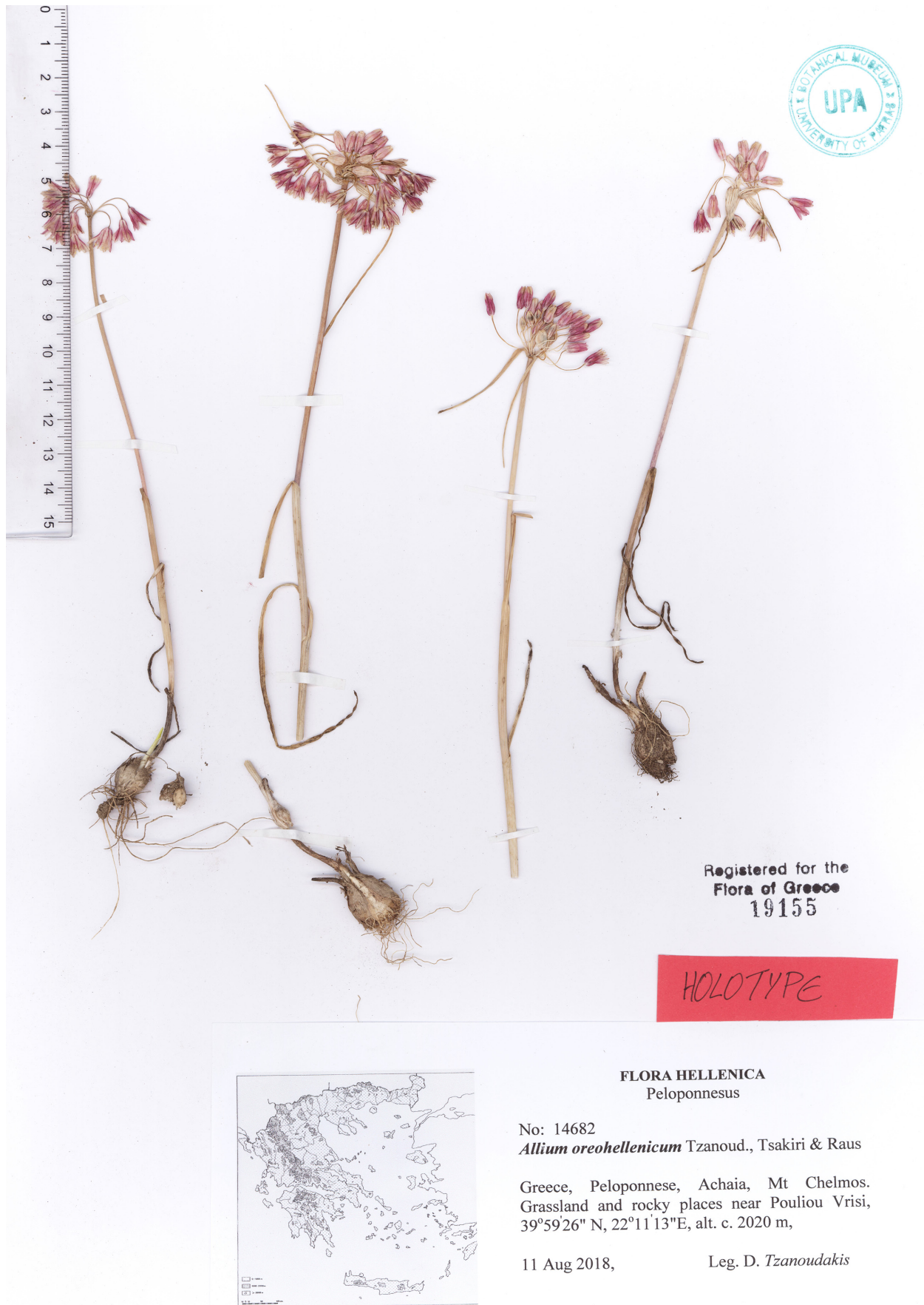
Fig. 4. Holotype of Allium oreohellenicum Tzanoud., Tsakiri & Raus, Tzanoudakis 14682 (UPA).