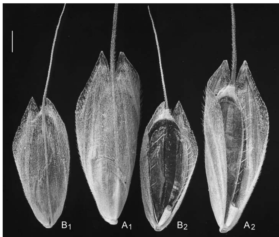
Fig. 2. Florets in fruiting state (1 = dorsal and 2 = ventral view) – A: Bromus incisus (from Otto 10651); B: B. lepidus (from Otto 10461). – Scale bar = 1 mm; photograph by Otto.

The Herbarium of the Botanical Museum Berlin-Dahlem (B) holds a mounted specimen of an annual brome grass obtained in 1946 from R. Gross, who himself received it from the National Her-