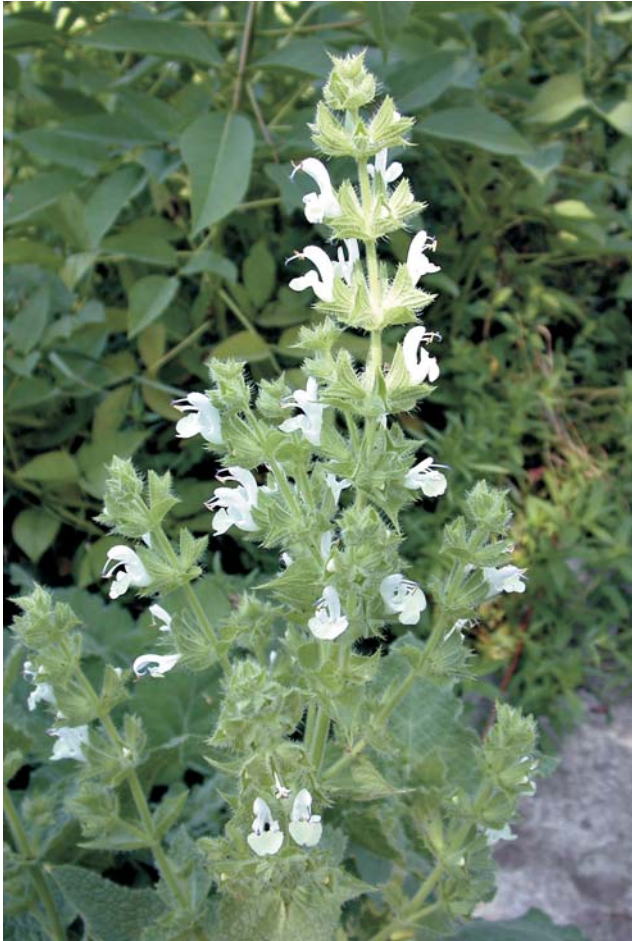
Fig. 5. Inflorescence of a cultivated plant of Salvia tingitana .