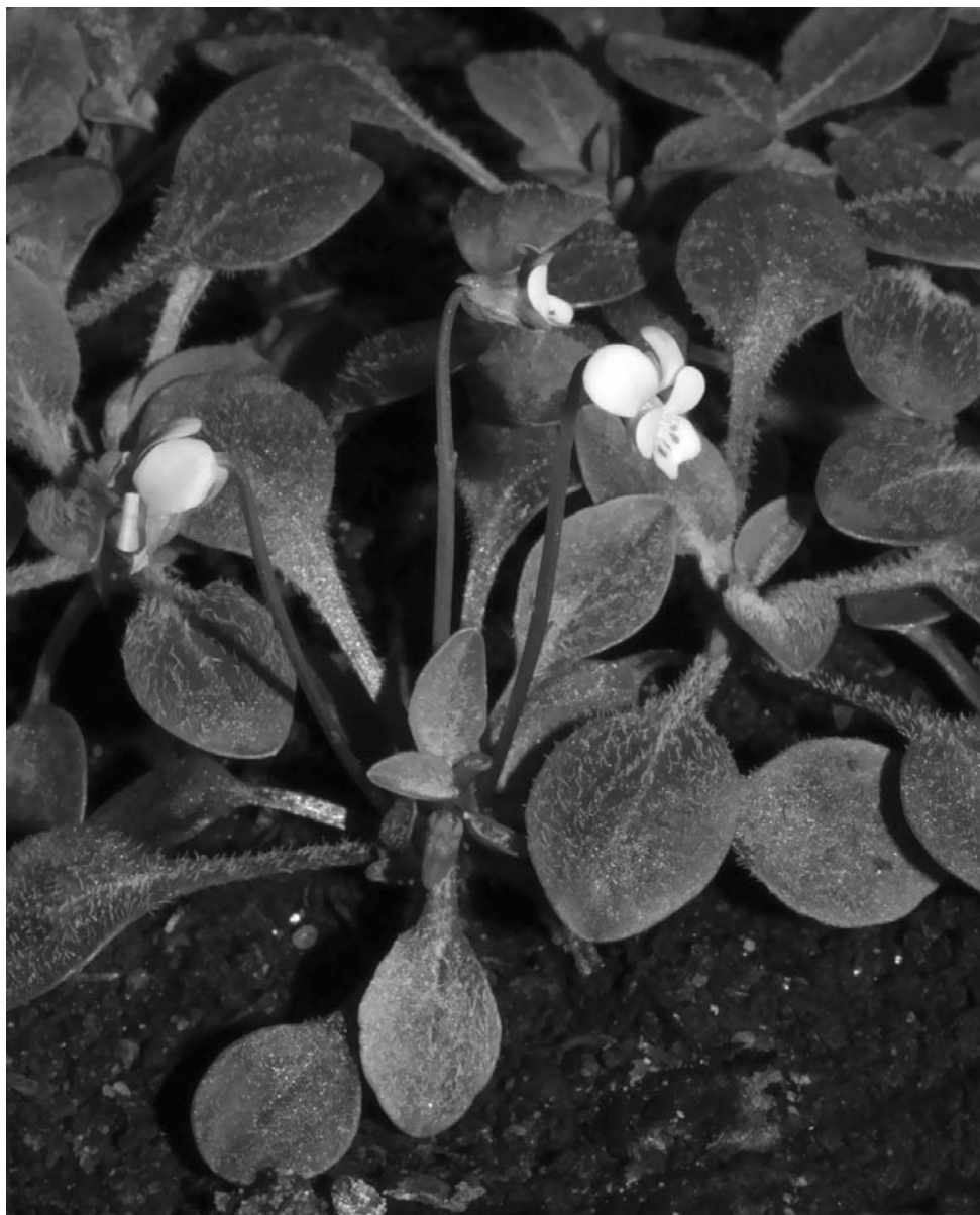
Fig. 3. Viola dirimliensis – cultivated plants raised from Eren & Şirin 4738 (herb. Parolly).

for colour photographs see the electronic supplement). This number is also new for the genus and fills the single gap in the descending aneuploid series from x = 11 to x = 2 in V. sect. Melanium (Erben 1996). V. rauliniana has 2n = 36 (Erben 1985), and thus must be deleted from the flora of Turkey. The Turkish plant can neither be seen as a putative subspecies of V. rauliniana , as was our hypothesis for some time, nor is it close to V. mercurii , endemic to the eastern Peloponnisos, which is clearly distinct from V. dirimliensis in many morphological characters and 2n = 10 , as has V. parvula .