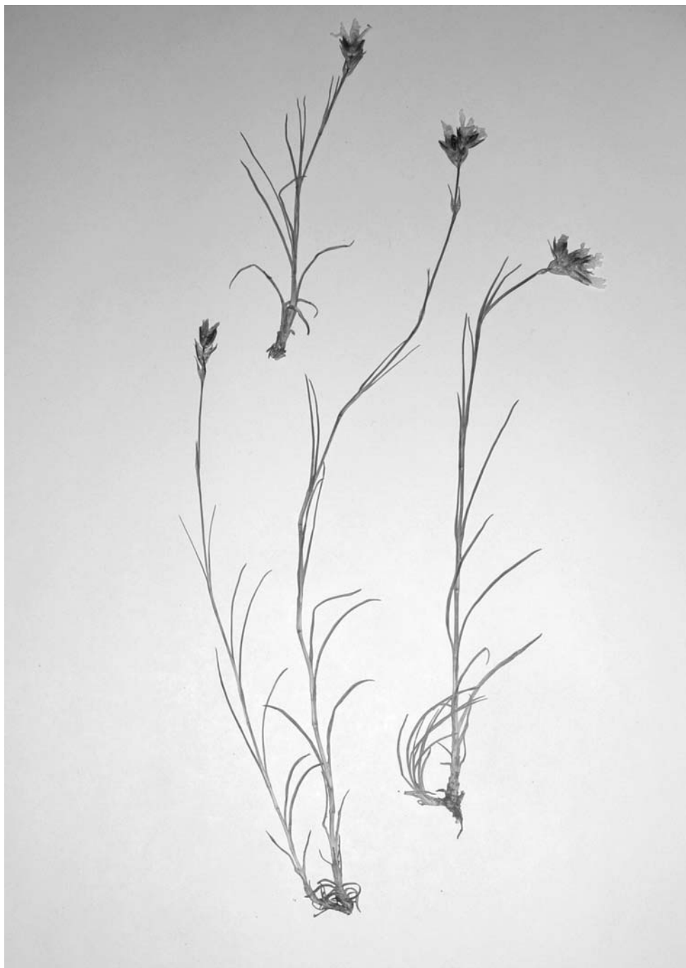
Fig. 2. Arenaria dianthoides subsp. tuncbasi – isotype at AYDN.