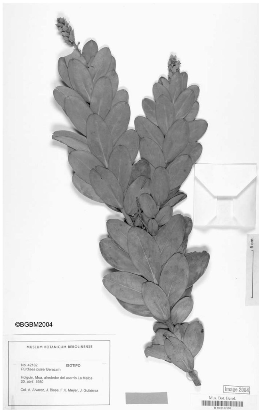
Fig. 1. Isotype specimen of Purdiaea bissei , HFC 42162 (B).