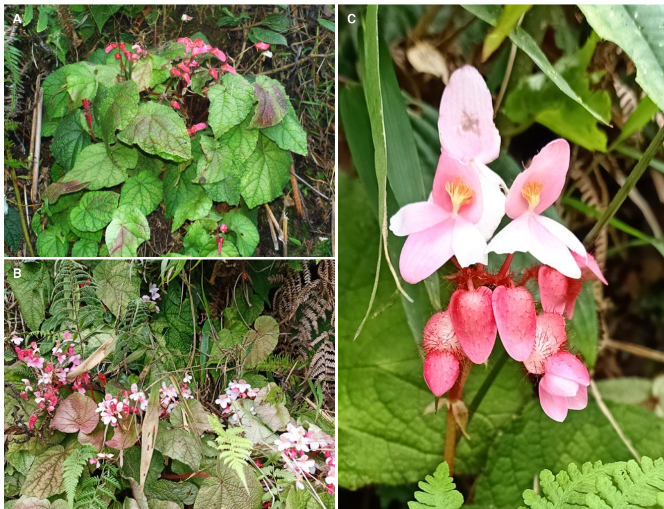
Fig. 2. – Begonia egamii D. Borah, Taram & M. Hughes. A, B. Habitat; C. Detail of staminate flowers showing the unusual asymmetric androecium.

Flowers from November to December, fruiting from December to January.