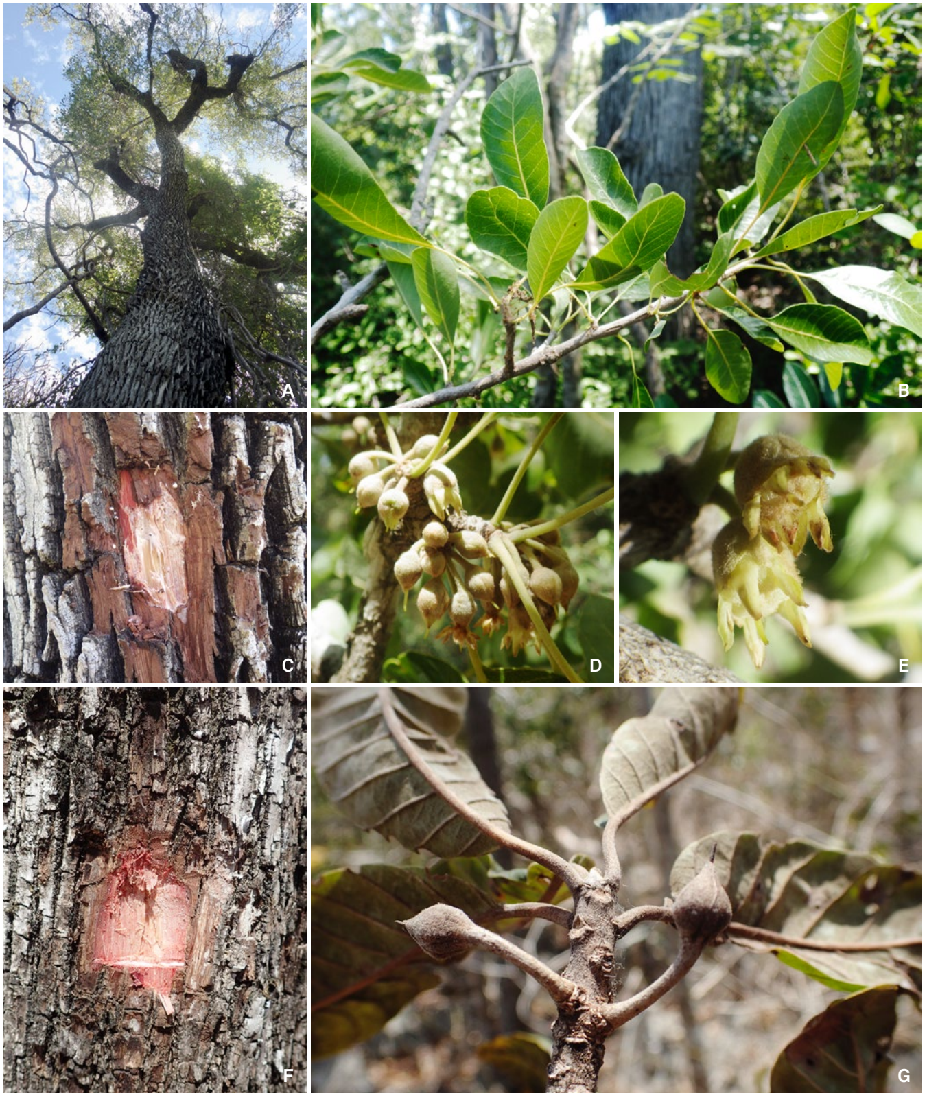
Fig. 2. – Capurodendron miquearum L. Gaut. & Boluda: A. Habit; B. Twig; C. Slashed bark; D. Fascicles of flowers; E. Flowers. Capurodendron namorokense L. Gaut. & Boluda: F. Slashed bark; G. Twig with two old flowers in an early fruit development stage. [A: Gautier 6329; B–E: Gautier 6339; F–G: Gautier et al. 6276]